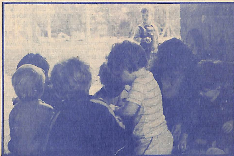
A busy morning at the Occasional Care Centre.

The centre is bright and airy. Children have painted murals on the glass and drawings and paper chains decorate the room. The pine