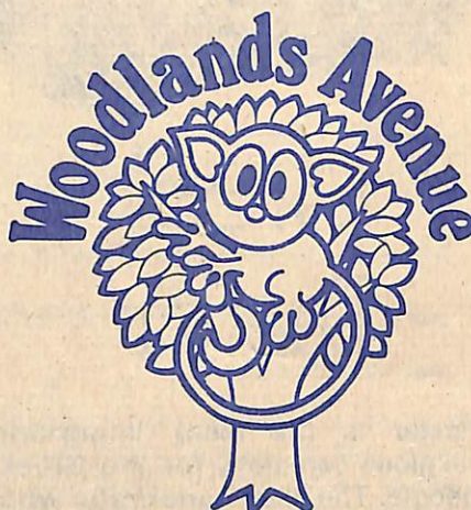
KEW PRE-SCHOOL SUPPORT GROUP

To raise money users of the playgroup take out term memberships which amount to $20.00 per family. Members this year have increased by 30% to 110