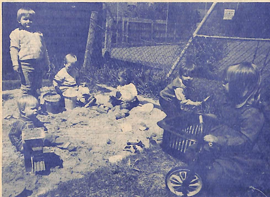
Enjoying Highbury Grove Playgroup.

Contact Kew Playleader Estelle Collinson on 862 2466 Monday to Friday from 12 noon to 2 pm for more information about neighbourhood or community playgroups in Kew.