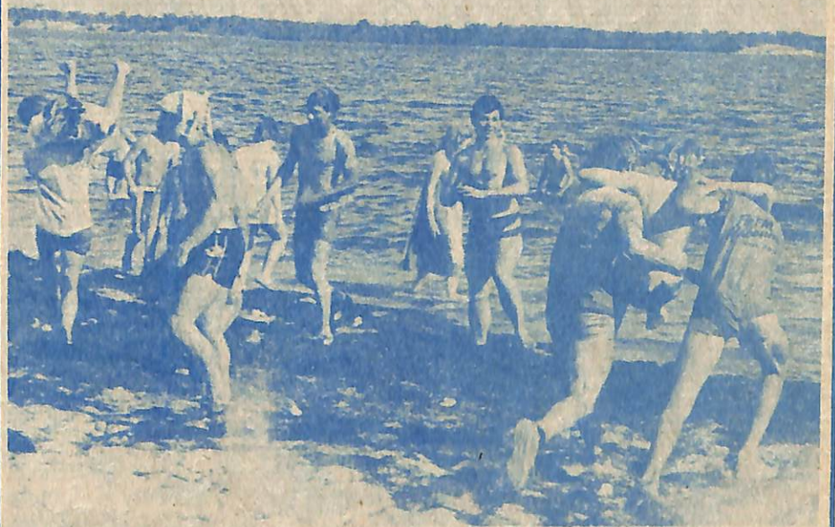
Some of the activities undertaken by the EARTH CLUB.