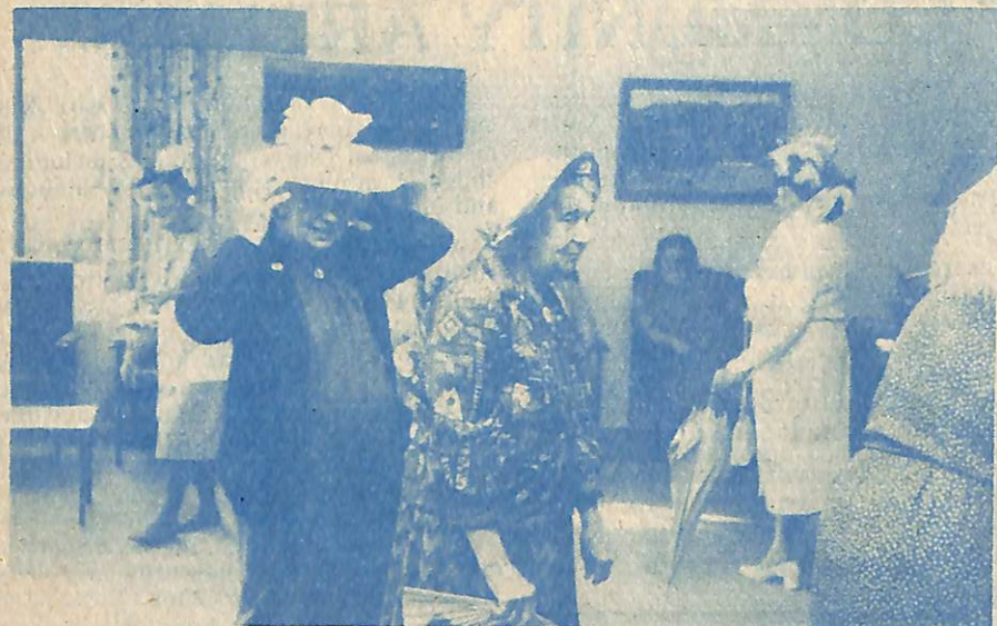
Residents of Hamer Court Hostel recently revived a traditional Easter activity — bonnet making. The accompanying photographs will give you an idea of the skill and imagination that went into the making of the bonnets. The finished products were then paraded for friends, and the winner received the traditional Easter gift as a reward.