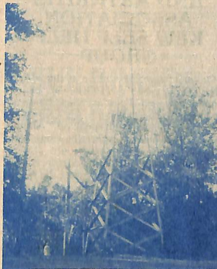
See pages 4 and 5 for more on this.

— lead soldiers — Diablo — Girls wooden top — Rag book — Rag doll — Double decker pencil case — coffee or cocoa tin — small show samples of the past — programmes of pantomimes or plays — dance programme — boy-proof watch — picture frame with seed pods and twigs glued on and varnished — small iron kettle — box iron — flat iron — china mug with picture of royalty — silk card from France 1914 — biscuit issued in 1914-18 war — goffering iron — Ration book — Sunday School stamps — Sunday School certificate — Magic lantern — Kaleidoscope — Grandma's fan — empty medicine bottle "Greatheads mixture" — Clements tonic — Hypol — Buckleys Canadiol — Golchrist — Button-up boots — lace collar — Merit Certificate — little book when pages flicked the people appear to move — sealing wax — box wax matches — jack-in-the-box — puppets — cigar bands in box — music box — child's toy piano — cable tram ticket — school slate — bottle with marble — army badges — Anzac book — antimacassar — sampler — moustache cup — china whistling canary — porridge bowl with bear on bottom — Willow pattern plate — sea shell nautilus etc — letter written normally and across — black emu egg.