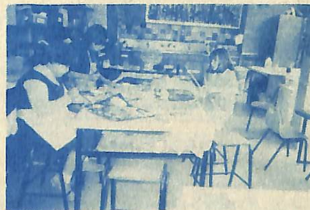
Children at Glendonald School.