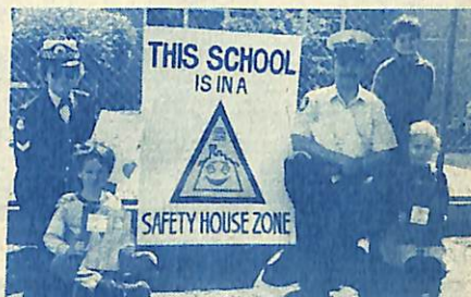
Children from Kew PS, with Safety House sign, and members of Police Force who addressed them on 'Stranger Danger'.

The programme commenced in October this year.