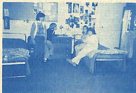
Children at John Cannon House.