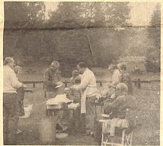
Hungry as Lions. Barbecue picnic at Silvan Dam means hard work to feed the hungry throng.