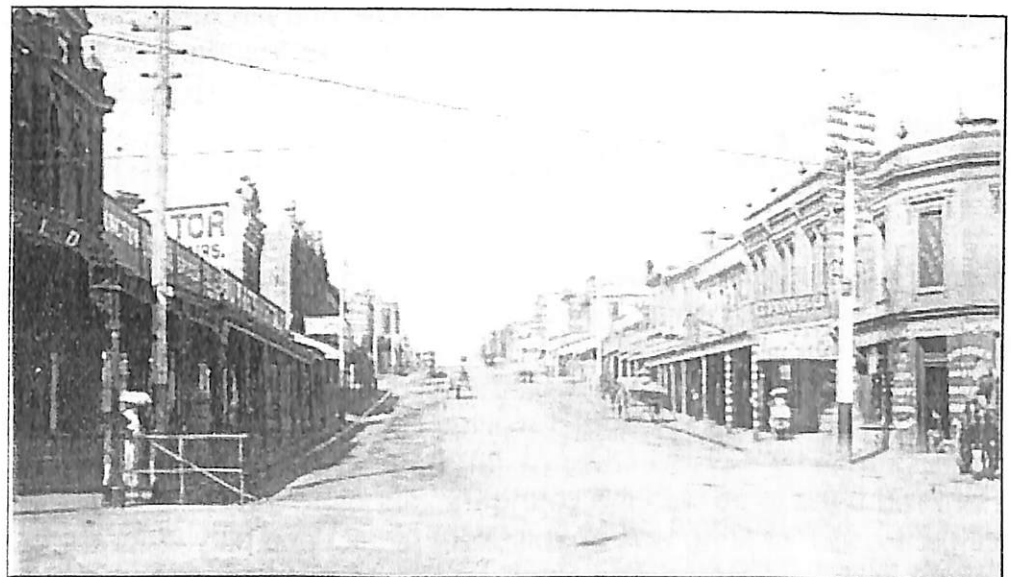
View from the Kew Junction, looking up High Street to Post Office- Some of the buildings on the left are still in place but very little remains on the right hand side today because of road widening. The tram lines can be seen in the road.