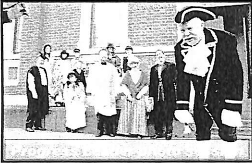
Friday 23rd June 2006