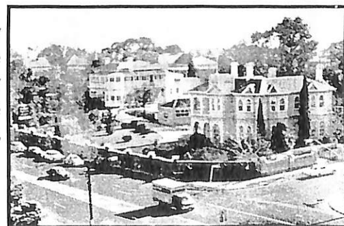
St Pauls in 1957