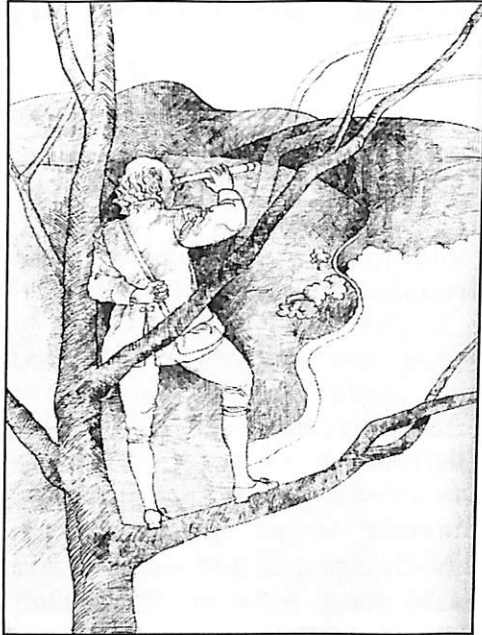
Commander Robins viewing the Yarra valley from a tree.

The purpose? To establish whether or not either location might prove a suitable site for a new settlement.