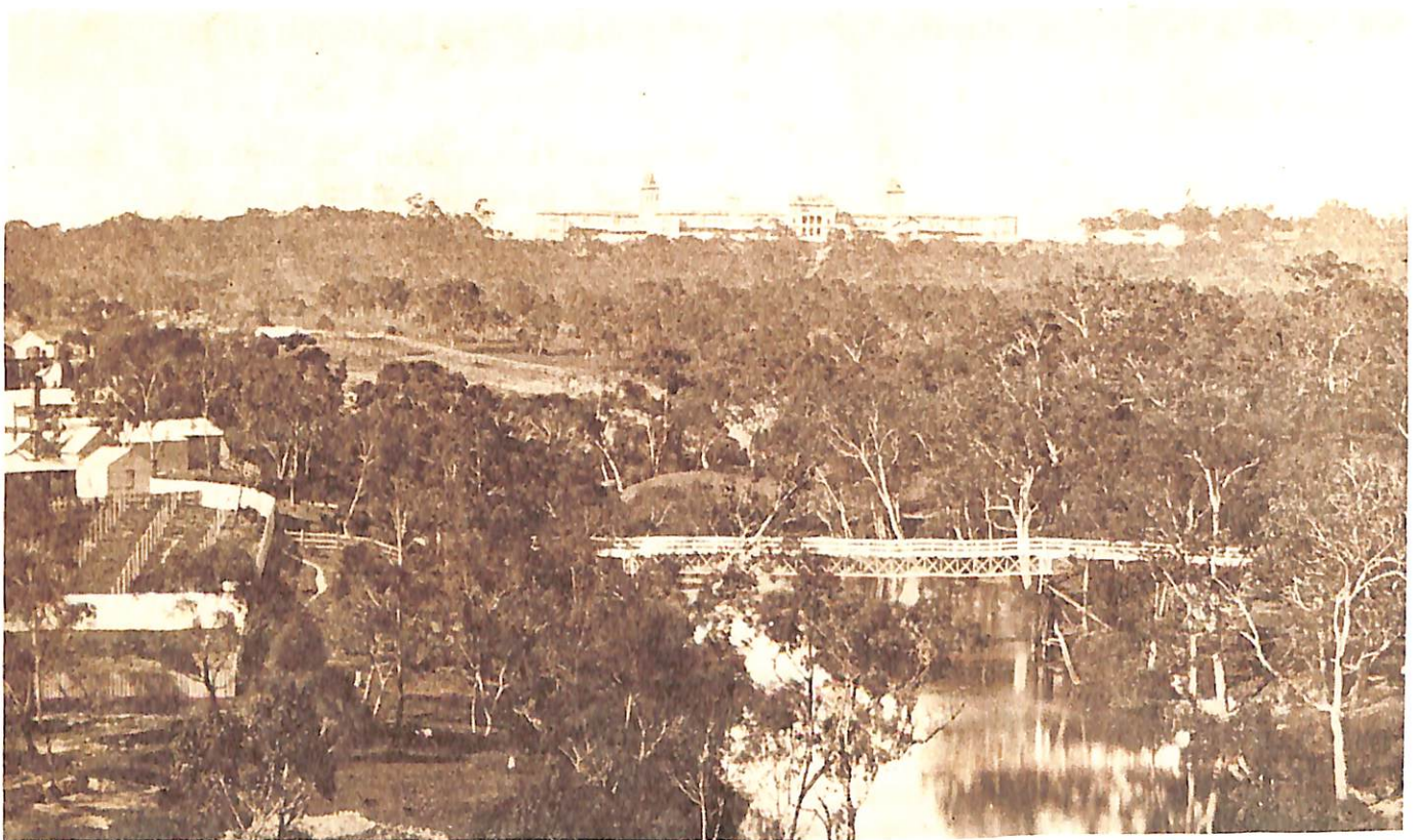
Circa 1900 photograph showing Yarra Bend Asylum on the left with Kew Asylum on the horizon. Burn's boatshed is just out of sight on the lower right.

The Argus newspaper dated 22 nd November 1875 reported on a double drowning that had occurred about a week earlier in the Yarra at Studley Park. A boy employed at Burn's boatshed at Studley Park had seen the body of a man floating past. The corpse was brought ashore and found to be that of a stout male person, 5' 7" in height and between the age of 43 and 44 years, dressed in an old dark monkey jacket, tweed vest, moleskin trousers, blue striped Rob Roy scarf, grey woollen socks, one elastic side-boot and one lace-up boot. In the pockets were found an old clay pipe and a woman's old sun-bonnet.