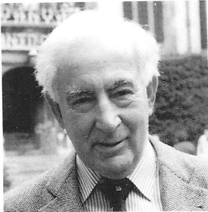
The Rt Hon Sir Zelman Cowen