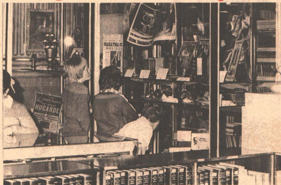
Fascinated children visit the 'W. G. Alma Conjuring Collection' on display until January 25, 1980 at the State Library.