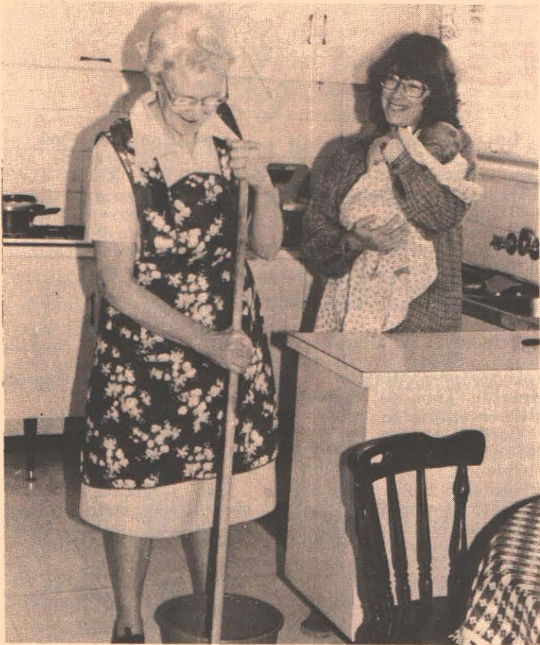
Practical service and support is provided by Caulfield City Council's Home Help program for mothers with new babies. Emergency and post operative situations along with our elderly residents also receive care.