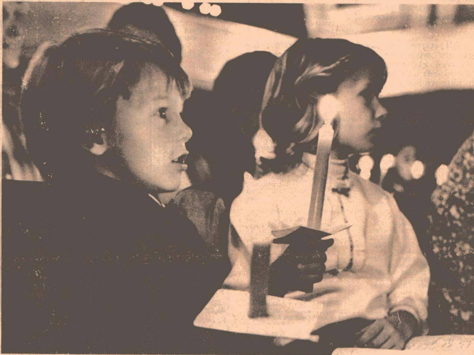
Children join in the Annual City of Caulfield presentation of Carols by Candlelight.

There is something special about candlelight at Christmas. And it was a very special time as people young and old joined together to sing, once again, those favourite old Christmas carols.