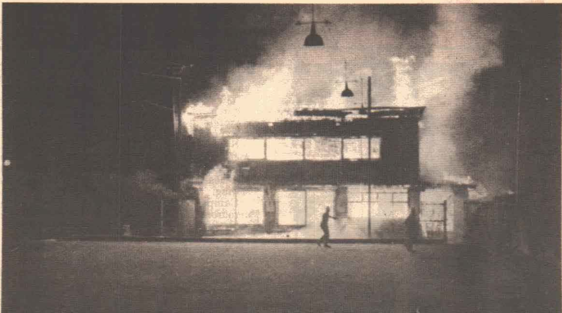
The old clubhouse which was burned down some years ago has been replaced by a more modern building.