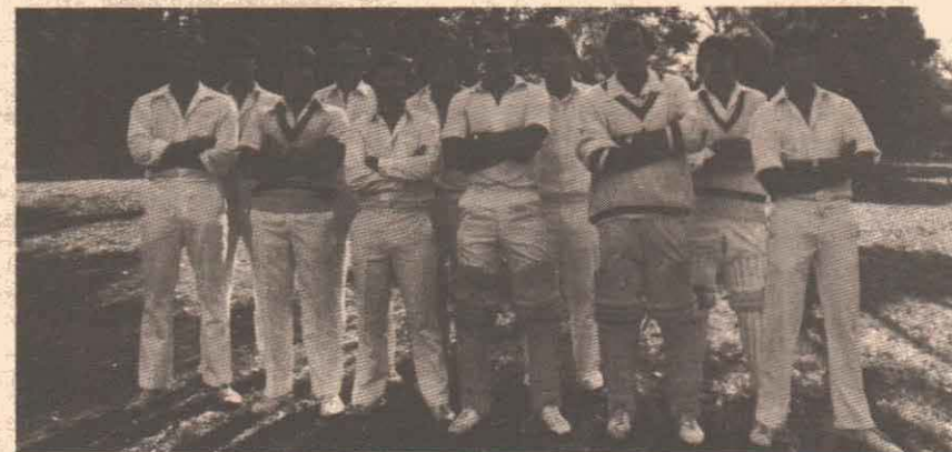
Above, North Caulfield/Glenhantly's First Eleven Premierships team.

Training is on Wednesdays commencing in September from 4.30 p.m. Training is supervised and enquiries from parents and boys are most welcome. Phone 578 8681 or 569 6992 for details.