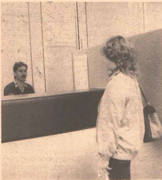
A new Social Security Office.

A new Social Security office at 861-871 Dandenong Rd., East Caulfield was recently opened to cater for the large number of people in the area who previously travelled to the St. Kilda, Prahran or Oakleigh offices.