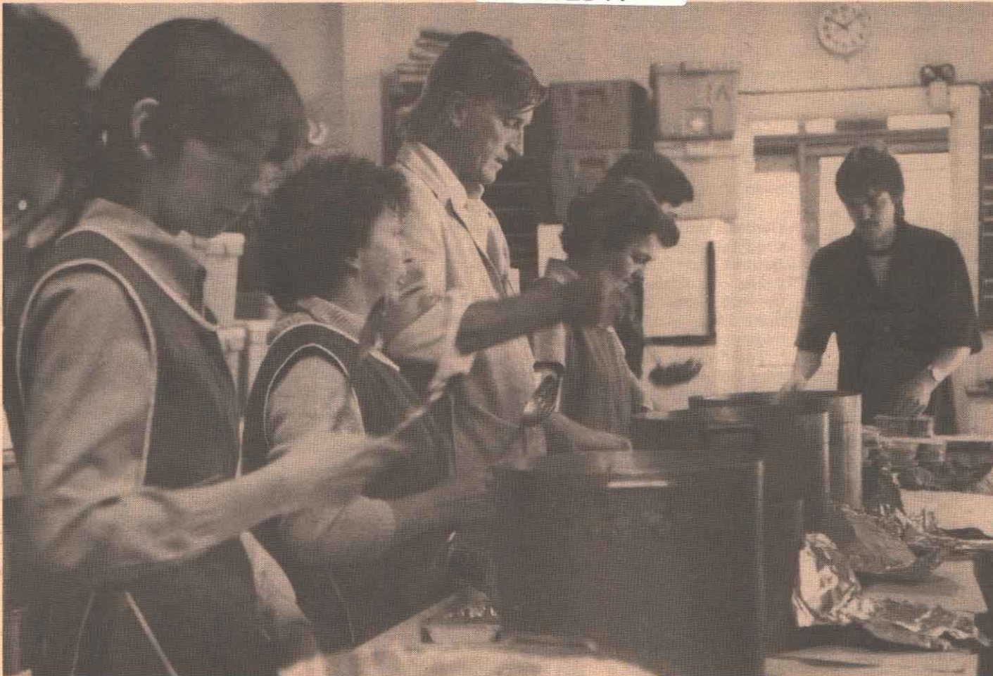
Pictured are the Meals-on-Wheels kitchen staff seen working in their present cramped conditions. Right, the old Library building in Truganini Rd, soon to be modified to accommodate the new kitchen facilities.

The City of Caulfield owes a debt of gratitude to Gladys Machin and her vision in post-war days. The City's Meals-on-Wheels activities grew from a service to the elderly, with no one to care for them, to today's highly successful enterprise. Gladys Machin and her band of workers used to work from a shopfront before the Elderly Citizens Club was built, and