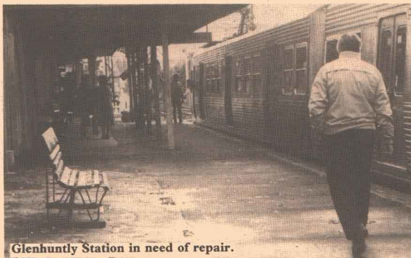
Glenhuntly Station in need of repair.

The construction of the extra line on the Frankston line also means a new railway station at Glenhuntly and the upgrading of the Glenhuntly and Neerim Rds level crossings.