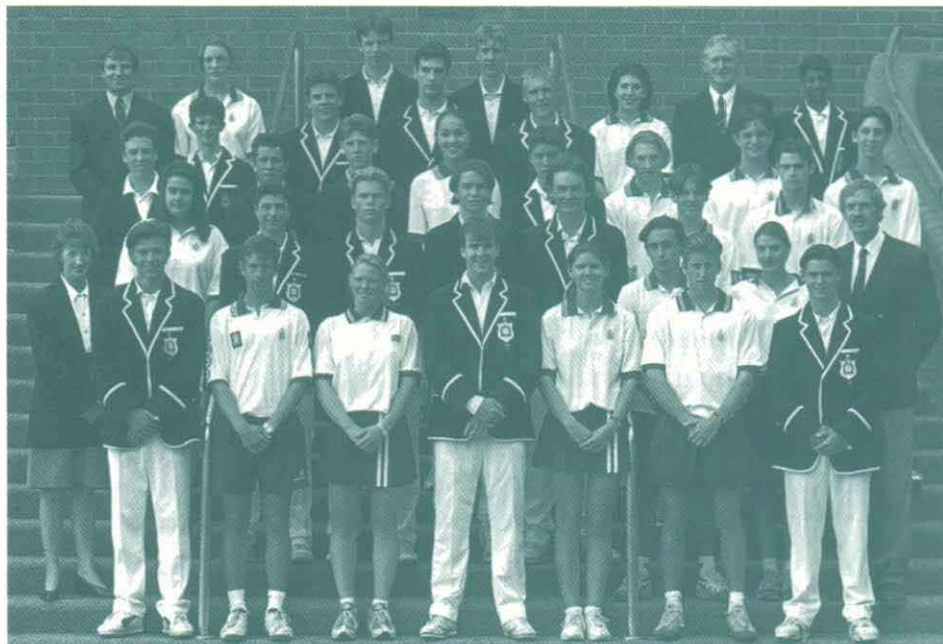
Members of the Caulfield Grammar School cricket and tennis teams tour of England 1996.