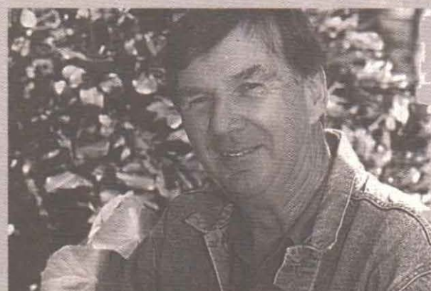
ABC-TV gardening buff Peter Cundall will be at Joyce Park for our Garden Festival celebrations on 17 November. Peter's "Gardening Australia" screens at 6.30pm on Fridays.

The City of Glen Eira Garden Festival is in full swing, and two more Discovery Afternoons are coming up, with the chance to "talk gardening" with expert Peter Cundall and enjoy our wonderful parks and gardens.