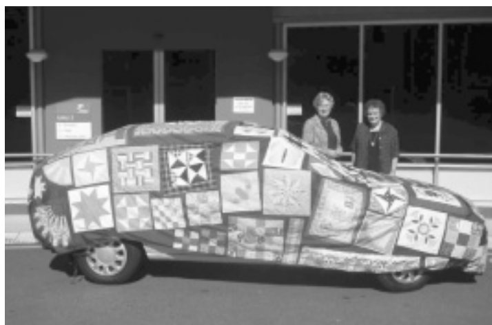
Artwork by the Patchworkers' and Quilters' Guild

Quilters use a variety of textural, colourful and intricate techniques. Often using layers of threads and fabrics to decorate the pieces, sometimes communicating stories or special moments and exchanging them as a gift.