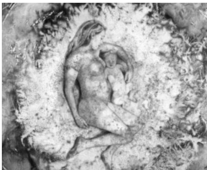
Artwork: Magic Happens by Ona Henderson

On display will be mediums as broad as sculpture, photography, jewellery, fine art and performance. The inclusion of a diverse array of art forms is aimed at achieving different perspectives and stimulating wide-ranging discussion surrounding the nature of birth.