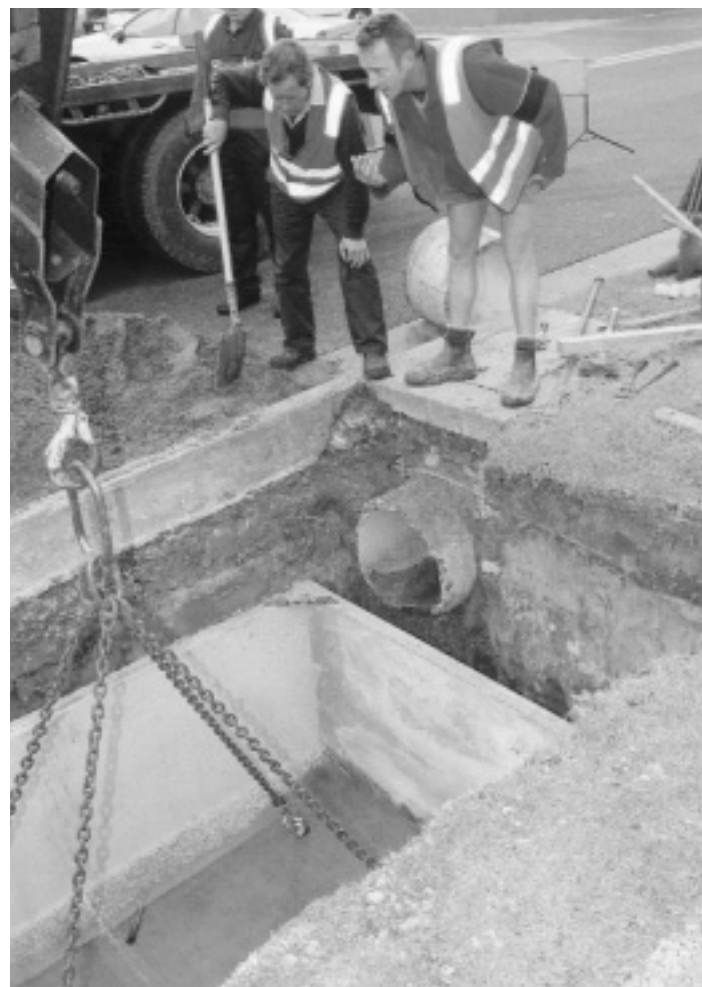
Glen Eira's new gross pollutant trap in Mitchell Street, Bentleigh will help the fight against litter entering local waterways.

The two Bentleigh gross pollutant traps are close to one another, and will collect water borne litter from catchments of similar size, and litter derivation characteristics.