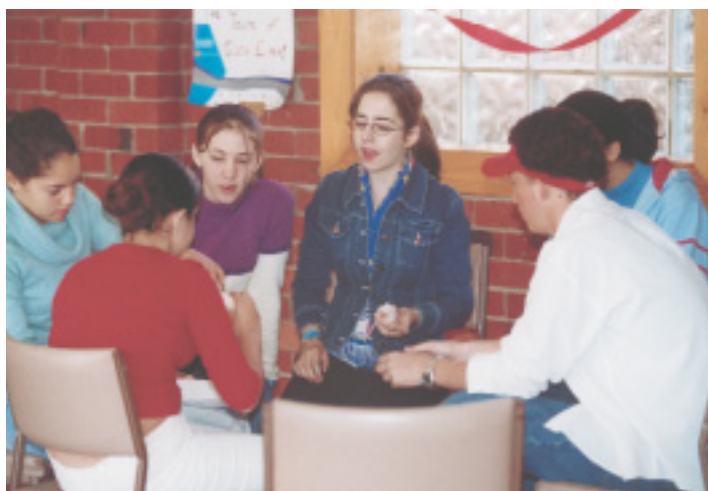
Team-building activities were used as a tool to put leadership skills into practice.

As part of the Kilvington Challenge Program, the girls joined the team at Why? Stop Youth Information Centre as part of their community involvement placement during Term One.