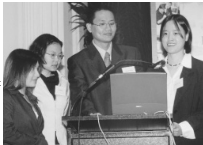
Monash University students launched the Glen Eira BusEd site at the seminar.

To register your interest in a BusEd project log on to the Glen Eira web page — www.gleneira.vic.gov.au — then look for BusEd under the Business page.