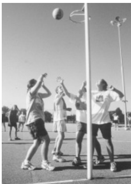
Winter sports like netball and soccer are about to start and Glen Eira kids are certainly spoilt for choice with a range of clubs operating locally.

Goalkick program at Bailey Reserve in East Bentleigh (Melways ref: 68 K12) beginning Saturday 17 May 11am-12.15pm. Contact Norm Jamieson on 9503 8816 for more details.