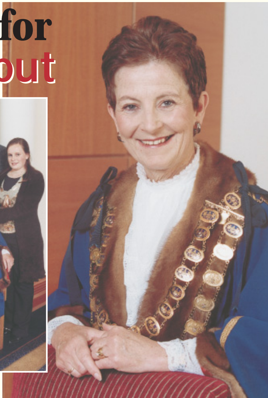
Cr Dorothy Marwick, Mayor of Glen Eira for 2003–04.