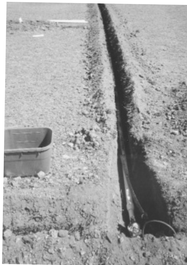
Bailey Reserve is one of five sportsgrounds included in Council's irrigation program. A 2km pipe is being installed 600mm below surface level to improve the ground condition and allow water usage to be monitored.