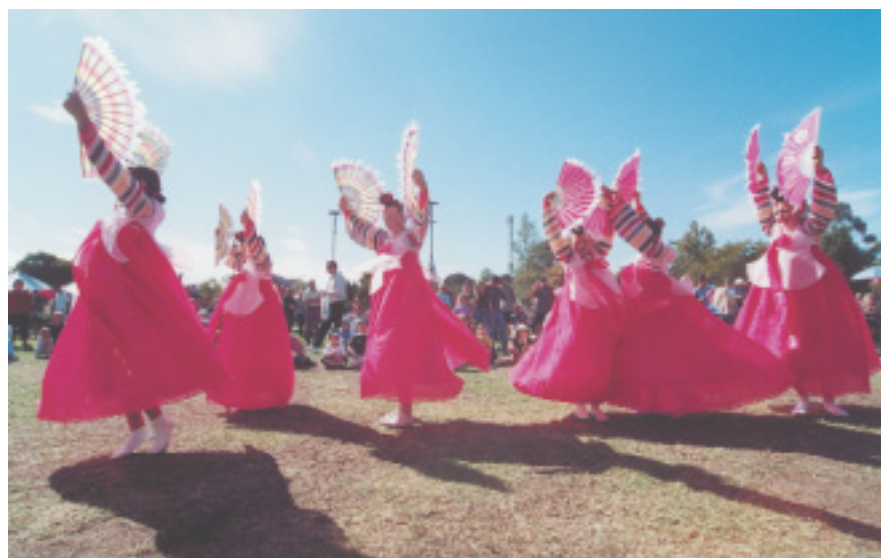
The bright coloured costumes and graceful movements of the Ormond Primary School Korean Fan dancers attracted many spectators at Allnutt Park.

The Why? Stop Youth Information Centre's West African drumming group put on a very polished performance at each Party in the Park . The 10-person group Rhythms of Glen Eira , had extra reason to celebrate at the last party as it coincided with the final day of National Youth Week — 13 April. The group had been rehearsing their repertoire of traditional songs and beats on the Djembe drum for just eight weeks before their first Party in the Park performance at Packer Park.