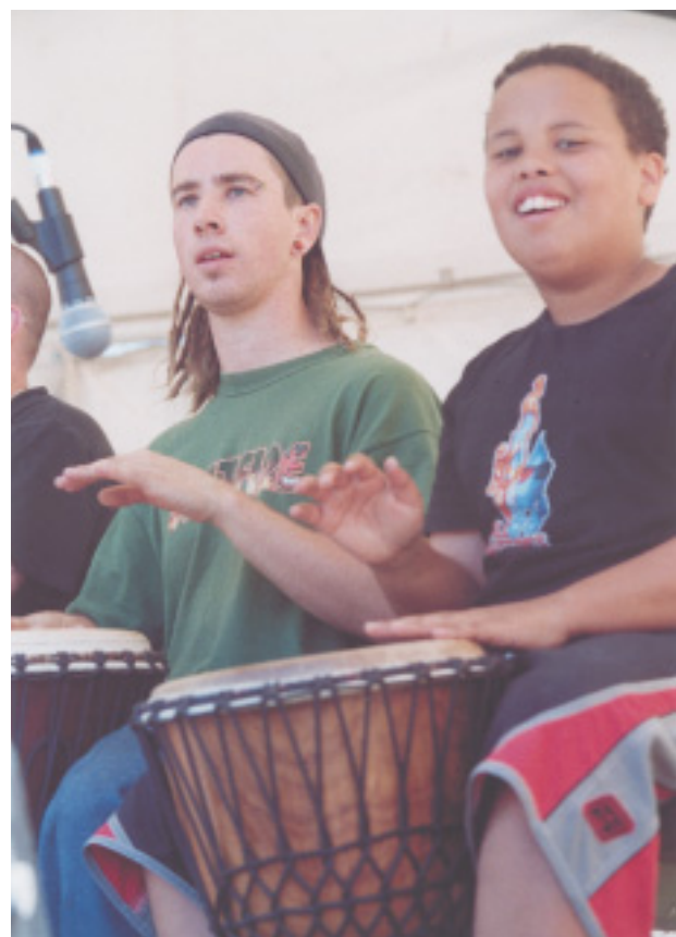
Glen Eira's Djembe drumming group were a popular attraction at all three Party in the Parks.

W hile party revelers were seen ducking for cover at Council's final Party in the Park , the baby animals — especially the ducks — loved the afternoon downpour.