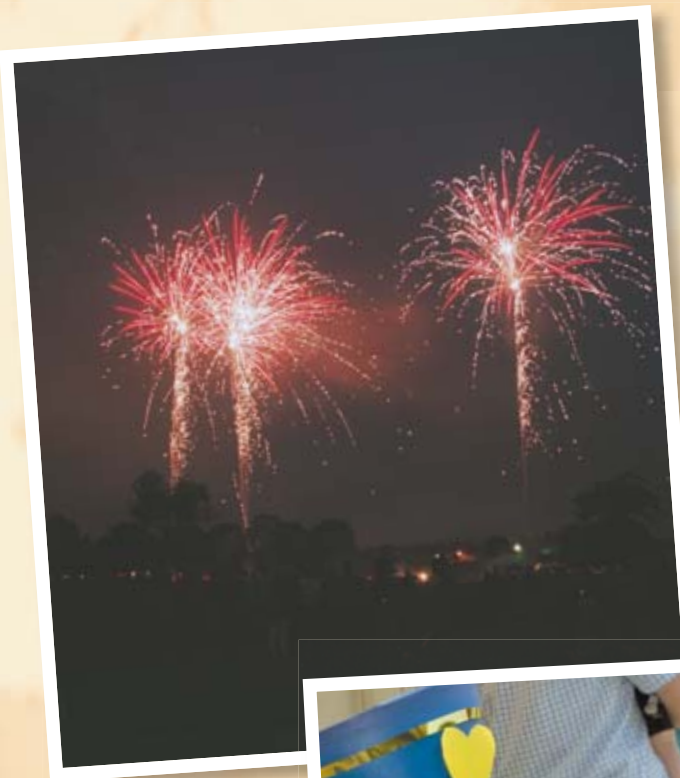
A spectacular fireworks display lit up the sky at the Chanukah Festival.

"Lots of fun activities for kids...provision of water, sunscreen and aerogard [were great]." ISOBEL REID, ELSTERNWICK