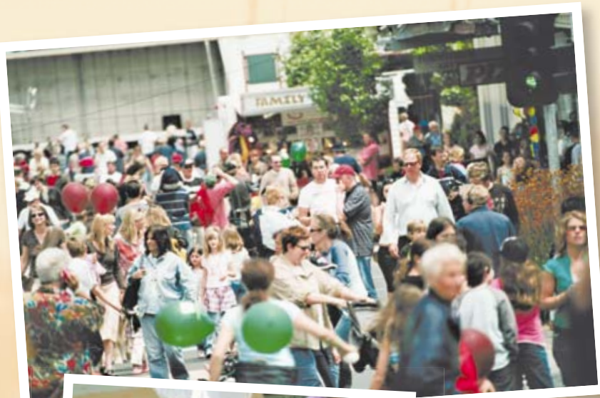
Crowds flock to enjoy a sunny day out at the McKinnon street festival.