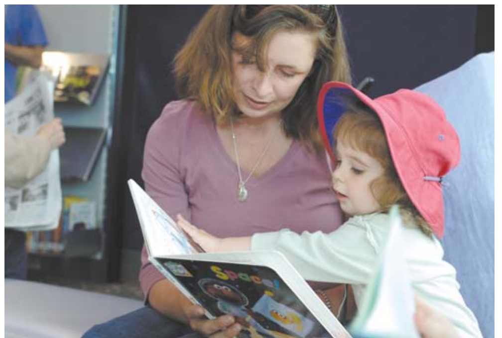
Council's libraries offer hours of information and entertainment for Glen Eira residents.