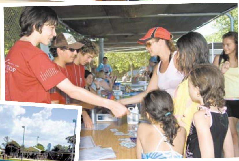
Members of Council's Just Youth team (in red) were on hand to ensure the Big Splash Out ran smoothly.