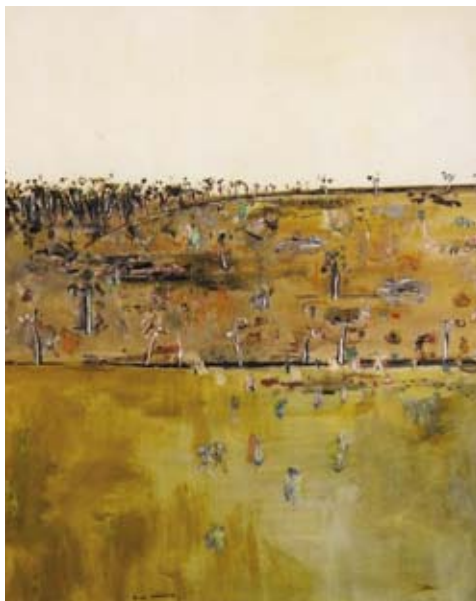
Lysterfield Landscape (1973) Oil on canvas 92 x 107 cm.

Lysterfield Landscape is a trademark Williams in its combination of the vertical against the horizontal and its