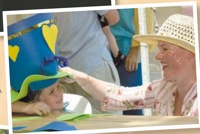
Happy hatmakers at the Mad Hatter's Tea Party.