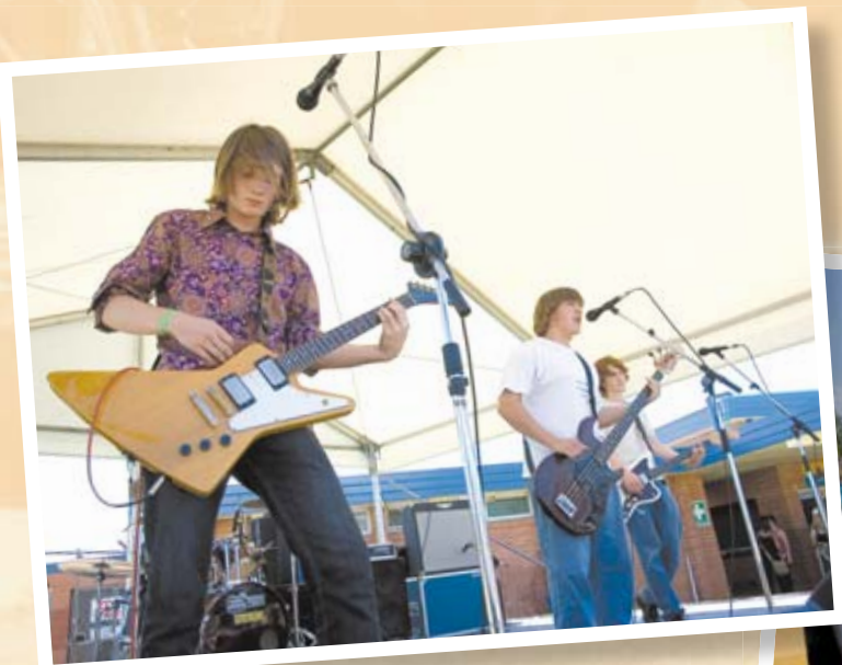
Local band Peyote rocked into the afternoon.