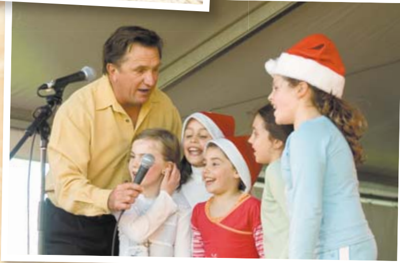
Host Frankie J Holden gets some help belting out the Christmas classics.