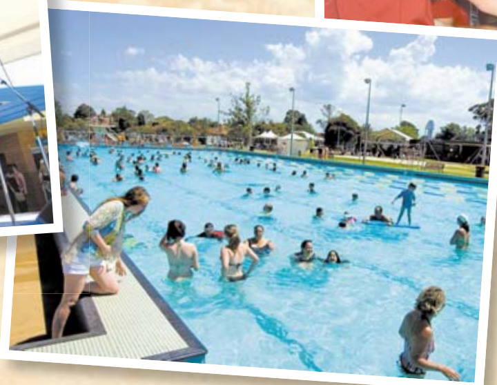
The heat brought hundreds out to enjoy the great pool-side music of the Big Splash Out .