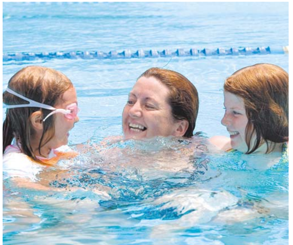
Council's Caulfield and Bentleigh Swim Centres offer fun in the outdoors for residents of all ages.

For further information contact Caulfield Swim Centre on 9571 8143 or Bentleigh East Swim Centre 9570 7394 or visit www.gleneira.vic.gov.au for further information.