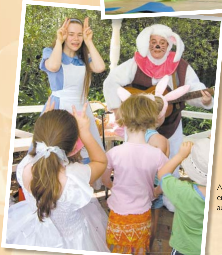
Alice and the White Rabbit enchanted their young audience.