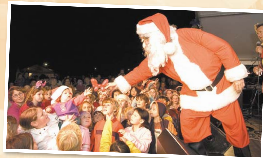
A visit from Santa delights the younger crowd members.

The 50-member strong Young Voices of Melbourne again showed its amazing vocal range, while the first-time performance of 10-piece a cappella group Heart n Soul delighted the audience with a mix of traditional carols and gospel tunes. Deborah Conway's unique renditions of Amazing Grace , The First Noel and Have yourself a merry little Christmas moved the crowd.