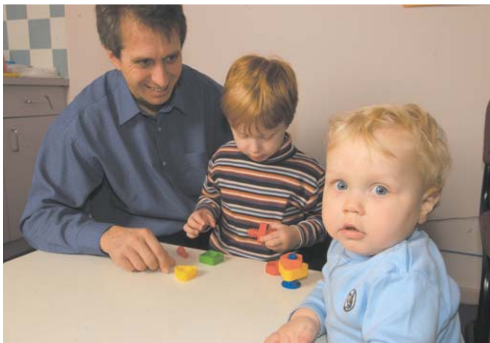
Maternal and Child Health services are important for families in Glen Eira.

A community forum will be held at McKinnon Secondary College on Tuesday 4 April for all residents to have their say. Formal written submissions can also be made to Council until the close of business on Monday 17 April.