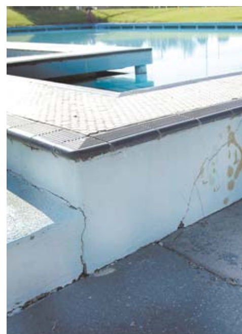
Repairs to cracks at the East Boundary Road pool have a limited lifespan.

In mid-2005 Councillors were briefed on independent expert advice that the pools were collectively losing 90,000 litres of water per day. Drought conditions together with age of the pools have caused sub-surface ground movement which has contributed to the leaks from the expansion joints. Recent repairs were estimated to have a two to three year lifespan. Other leaks may occur due to the original cork and bitumen sealant. Given the shortage of water in our environment, that level of water loss is indefensible. While the environmental effect from the chlorinated water is difficult to quantify, this level of chlorinated discharge is likely to be affecting the water table and damaging the foundations of the pool.