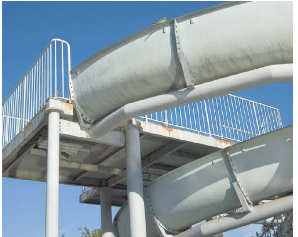
Heavy corrosion to the structural steelwork and supports of the Koornang Road water slide (above) forced its closure last year. The East Boundary Road water slide was closed prior to the 2004-05 swim season.

"We want to make decisions regarding McKinnon through open processes. All views and comments from community members are invited."