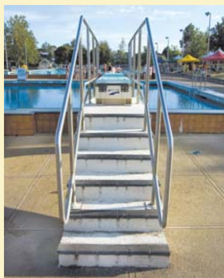
Koornang Road swim centre, Carnegie