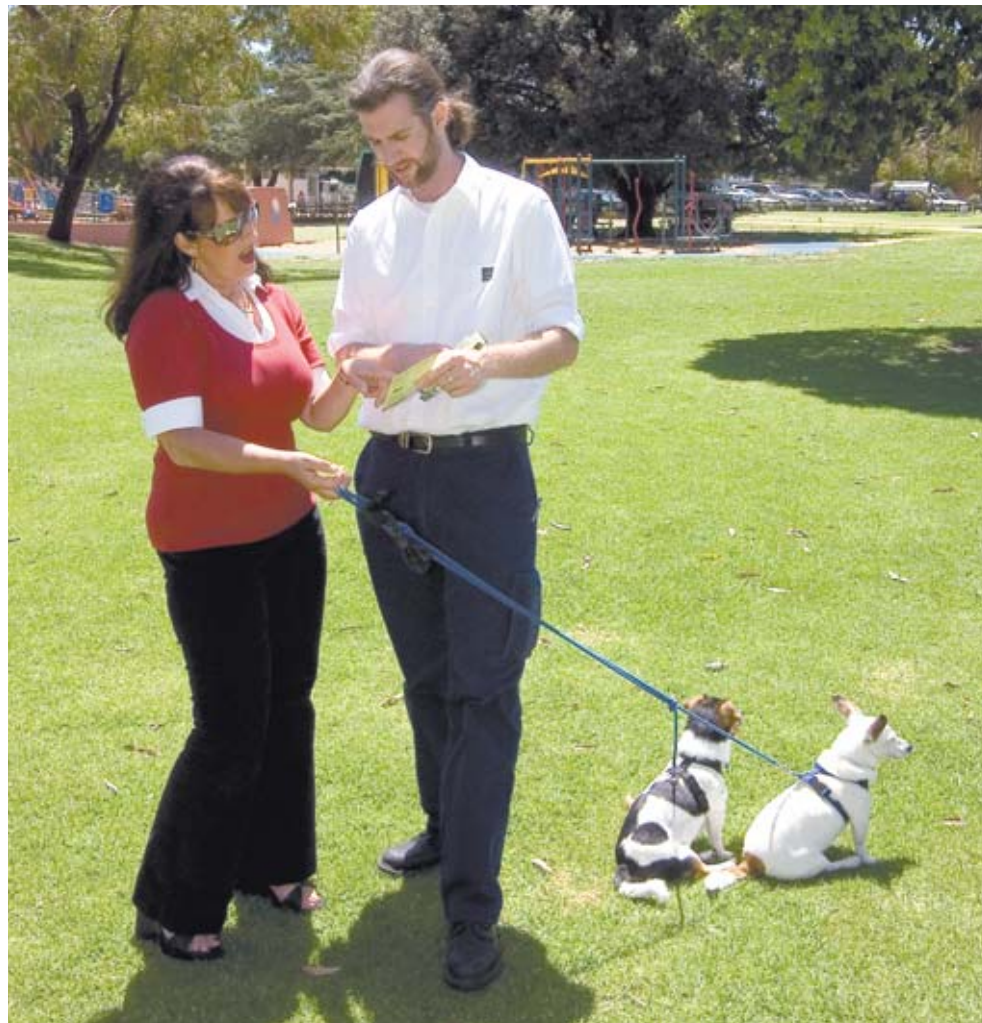
Pet owners are reminded to renew their animal registration this month.

"Reduced fees also apply for pets in a range of categories including desexed, microchipped or more than 10 years old. Once a pet is registered, a new registration tag is provided which the