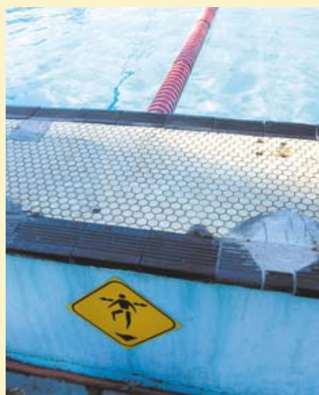
East Boundary Road swim centre, Bentleigh East

The pools currently offer none of these facilities.