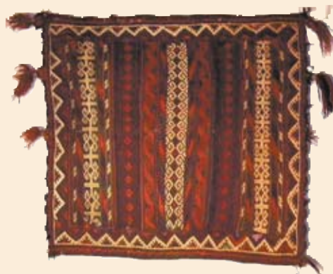
Copeland Collection, Antique cradle, central Asia.

stunning pieces which will be included in the forthcoming exhibition along with works from India.