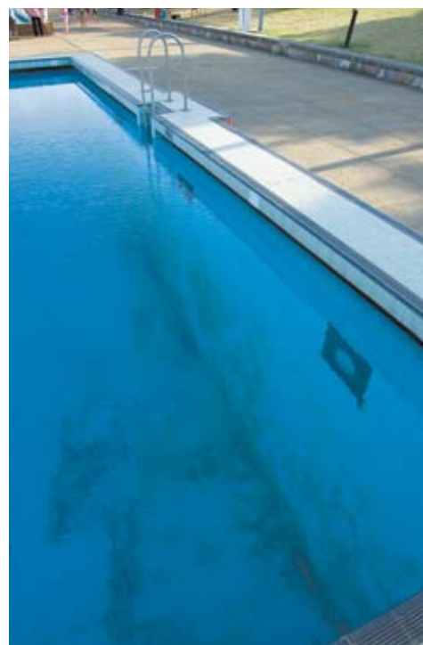
Dive pool algae at the Koornang Road centre.

The Koornang Road dive pool has significant algae all the time. The chlorine dosage required to eliminate the algae would make the other pools unusable for a period. Algae are present in the 50 metre pool, particularly at the dive pool end. When toddlers urinate or defecate in the toddlers' pool, water quality becomes unacceptable. Because that pool is the last to receive chlorinated water, it has to be 'super-dosed' with chlorine. That requires all users to vacate the pool for up to an hour. On popular days this procedure is undertaken at least once a day.