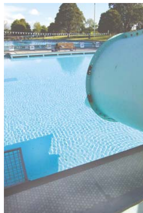
The East Boundary Road water slide splash pool is too shallow.

The Bentleigh East water slide discharges into the learner's pool. Water is drawn from the learner's pool to feed the water