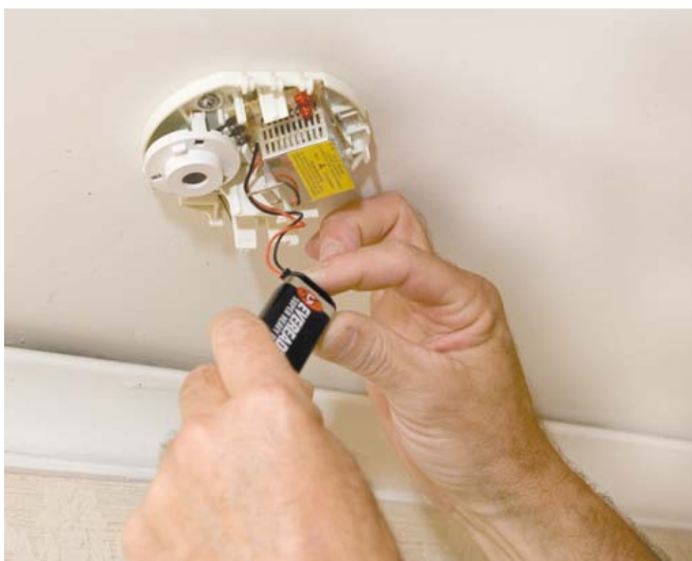
Residents are encouraged to check their smoke alarms at the end of daylight savings in March.

"We are currently distributing letters to all HACC clients who are unable to change the batteries themselves and cannot afford the cost of new batteries. Once eligible clients have been identified, the MFB will change the batteries for them.