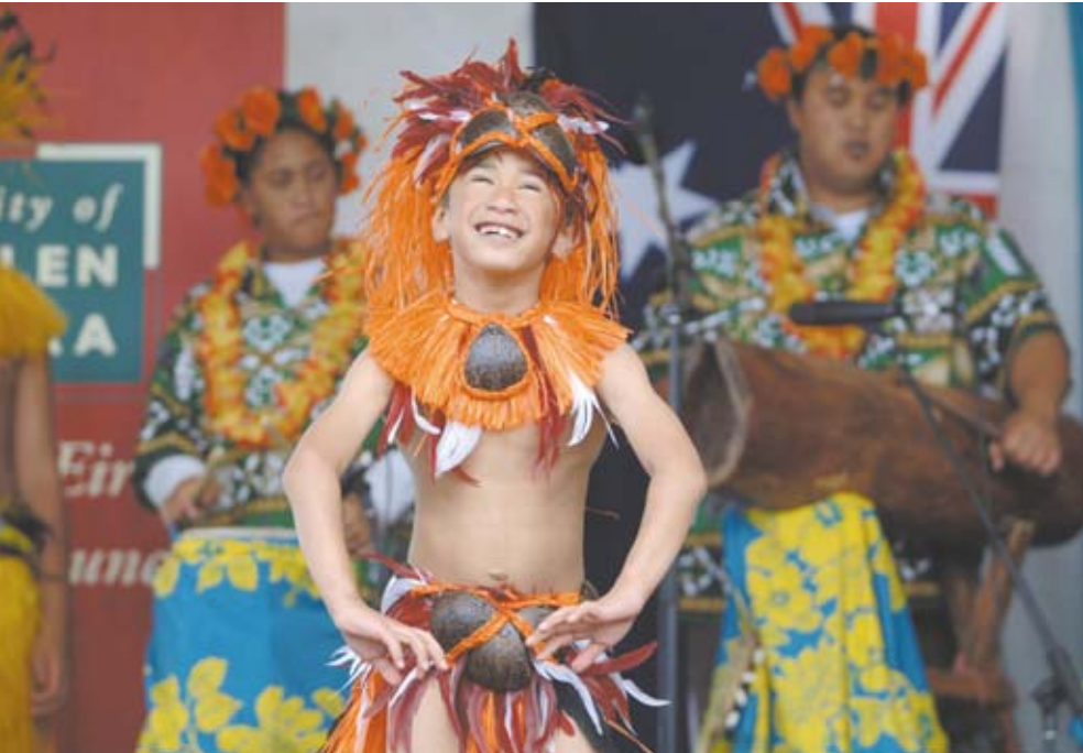
Western Creations wowed the crowds with a lively performance

The Bahamas, located in the Caribbean, comprise 700 islands, only 30 of which are regularly inhabited. The population is concentrated on 10 major islands, including New Providence, Grand Bahama, Andros, Cat Island and Long Island.