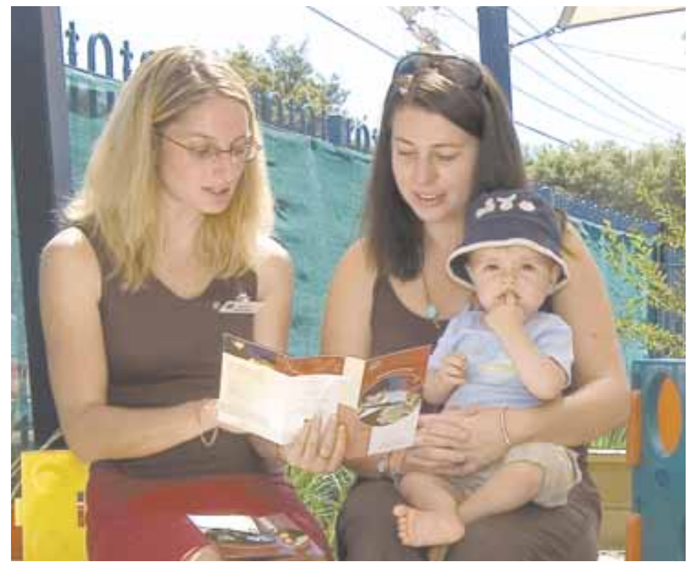
Parents enjoyed the opportunity to learn more about Council's services.