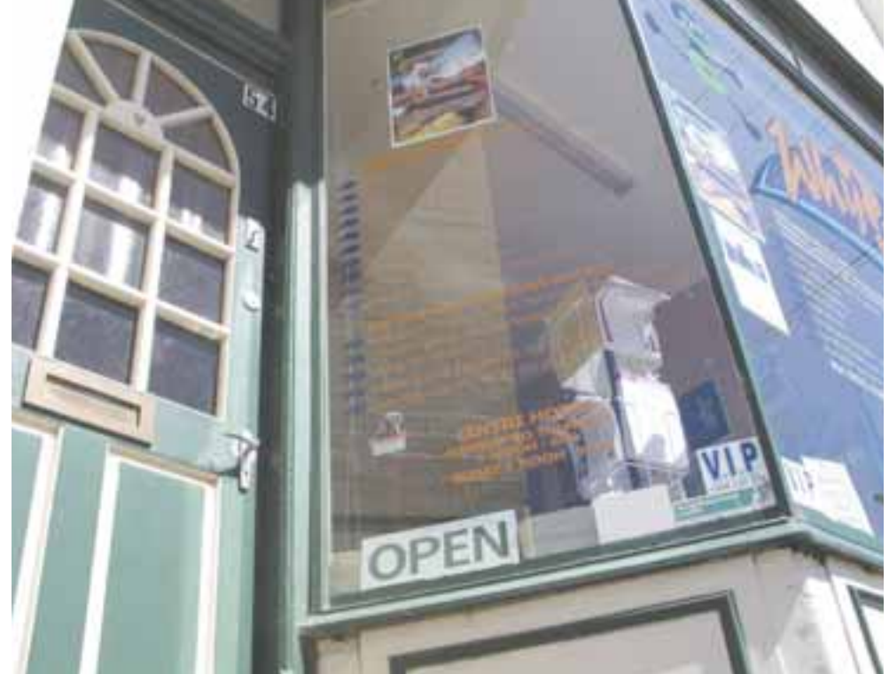
Council's Why? Stop will move to upgraded facilities in Bentleigh East.

"Not only does it help young people deal with critical issues, it also helps young people connect with each other and forge