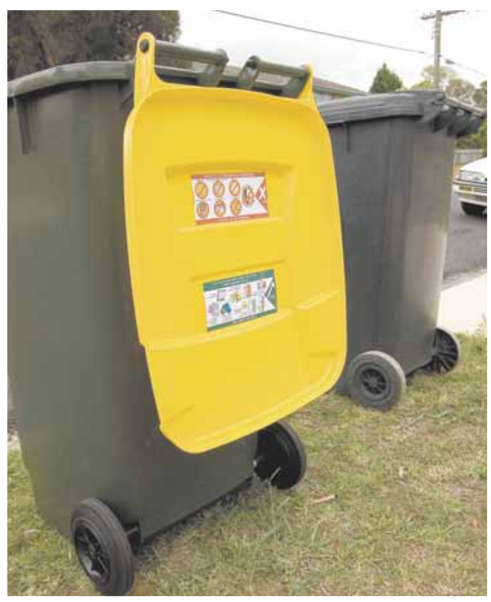
Place the bins on the kerb the night before collection, leaving a 0.5 metre gap between them.

larger, 240 litre general waste bin, taking up the space of two crates side by side. Residents in blocks of units can share a bin.