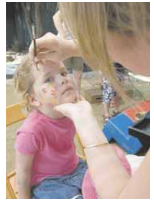
Face painting proved a popular pit-stop.

ouncil's Carnegie Children's ✓ Centre opened its doors last month to families to view the revamped centre - complete with new playground.