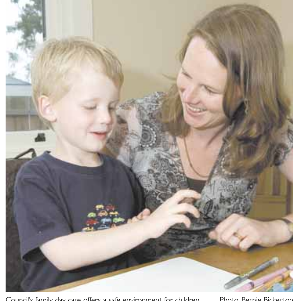
Council's family day care offers a safe environment for children.

The child care benefit is available to eligible families using family day care.