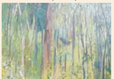
Beechworth 'Winterlude' Exhibition 2006

Opening Tuesday 2 May at 6.30pm Continues to Sunday 14 May