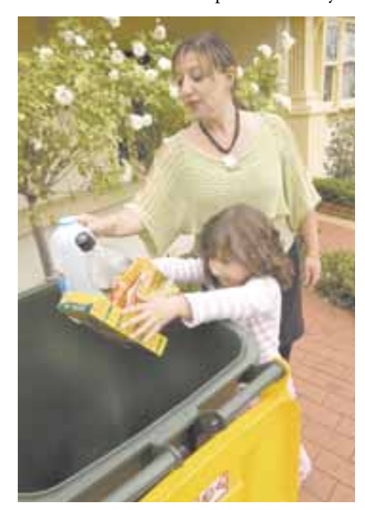
The recycling system is highly automated — all recycled waste is later separated at the depot.

Council's decision to change the way we collect materials for recycling was based on the results of an independent survey