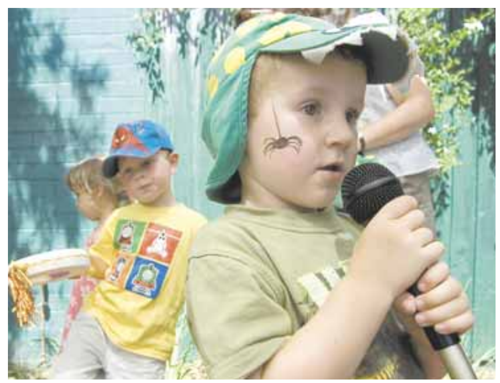
Karaoke struck the right chord with parents and kids.

Parents and children enjoyed the free open day activities on offer, including face painting and karaoke, which had the children happily dancing around the centre. Parents enjoyed the opportunity to meet other families from the centre and the open day also allowed many fathers to visit the centre for the first time.