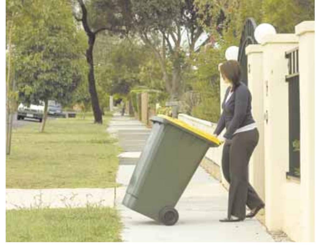
Do your bit for the environment. The new service will make recycling even easier.

Having a bin with a lid also means that there will be less paper litter blowing about the place, and much less risk of cuts from broken glass or sharp tin lids. The waste won't get wet if it rains and