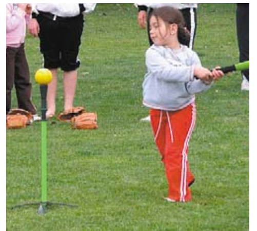
Softball — a sport for all ages