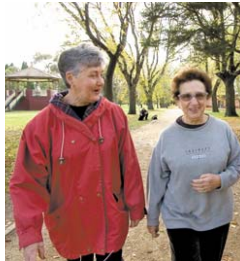
Go for your life at the Victorian Seniors' Festival

two weeks of enjoyment for senior residents."