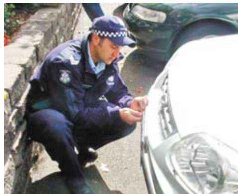
One-way security screws make number plates harder to steal.

On the day, bicycles were marked with a security identification number and motorists were given a set of number