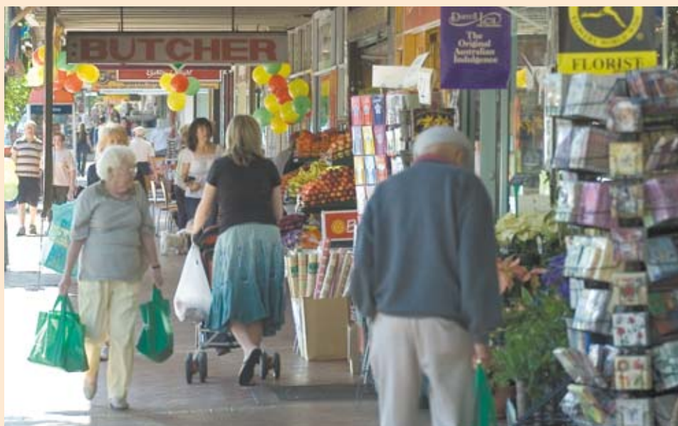
New trading policies will ensure footpaths are accessible to all.

A draft policy is now available for public comment. Copies are available at all Council libraries, Council’s Service Centre and on the website at www.gleneira.vic.gov.au .