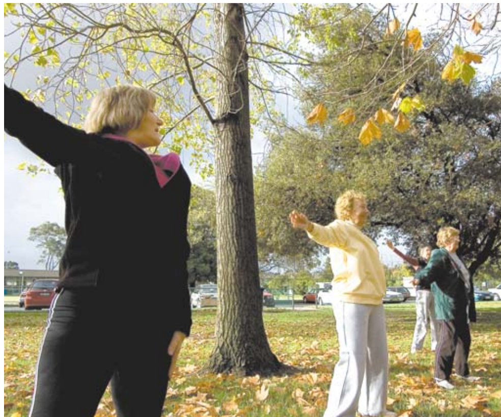
Residents can enjoy morning walks and fitness classes.

"The community events are put together by various local groups and are a great cultural experience. Alongside Council's events, they are guaranteed to provide