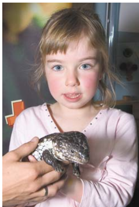
Hold a lizard.