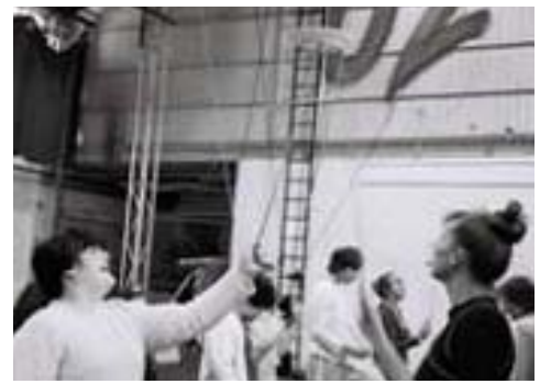
Some of Australia's top circus performers will run the workshops

The workshops will be run on Sunday mornings during school terms and are available to families who live in the cities of Glen Eira, Bayside, Port Phillip and Stonnington.