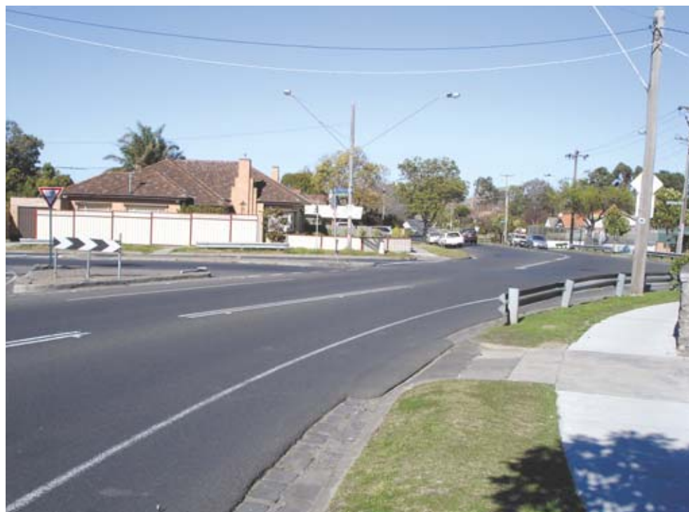
A roundabout could make the McKinnon-Thomas Street intersection safer.

Several alternative intersection treatments have been considered. Traffic signals and turn bans have been examined, but it is likely traffic signals at this intersection will result in run-off road crashes at the bend.