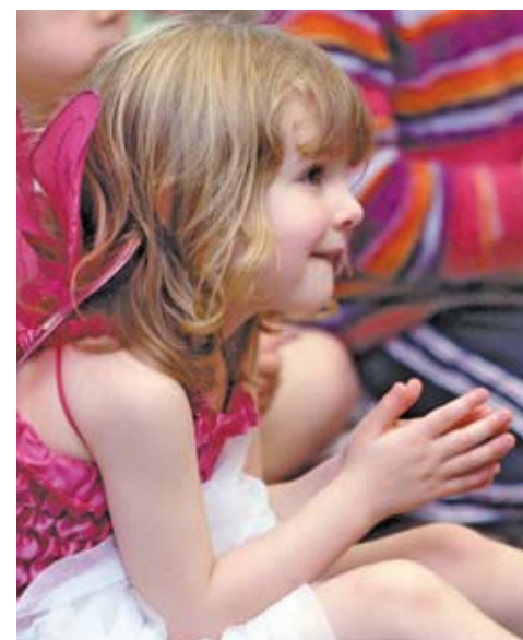
Wave a magic wand and you can be a fairy.