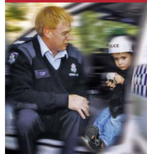
Community Safety Month — pages 6-7