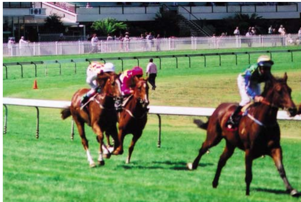
Council is seeking a balance between race events and community activities.

The first of these goals is well established however, as there are only a limited number of race days per year and horse training takes place in the early morning, Cr Feldman said there