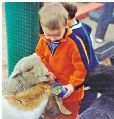
Children will enjoy talking to the animals.

Families are invited to celebrate Children's Week together and enjoy the animal farm that will be visiting on the day.