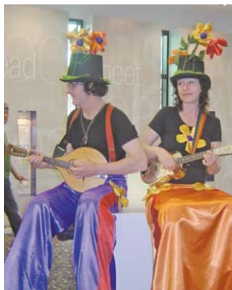
See the Tall Poppies and many other fantastic performers

In the Children's Multipurpose Centre, children can enjoy fun play experiences