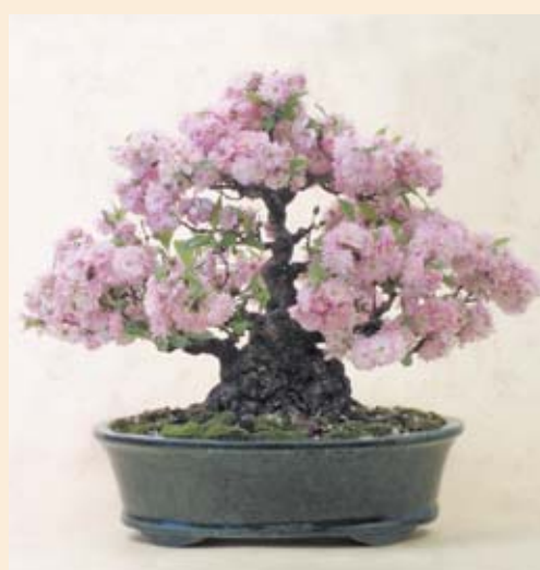
See Australia's premier bonsai exhibition.

The Bonsai Society's admission fee is $5. Children accompanied by an adult will be admitted free. Light refreshments will be available.