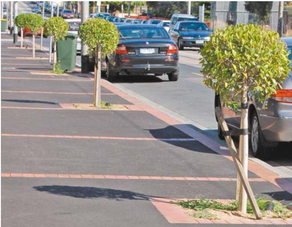
New paving and planting has revitalised Caulfield Park Shopping Centre.

Glen Eira City Council has given Caulfield Park Shopping Centre a fresh new look, with an upgrade to paving and new foliage.