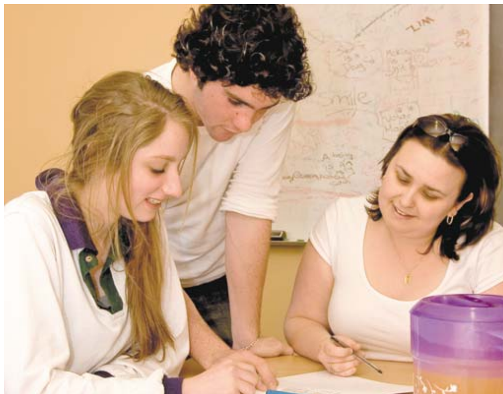
The Youth Consultative Group at work.