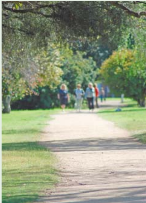
Walking is a popular way to stay fit.

Self-guided walks: If you want to move at your own pace, Council provides a range of brochures about self-guided walks in the area. The walks incorporate some of Glen Eira's most popular parks, reserves and heritage sites. For more information, visit Council's Service Centre and pick up a Walking in Glen Eira brochure series kit.