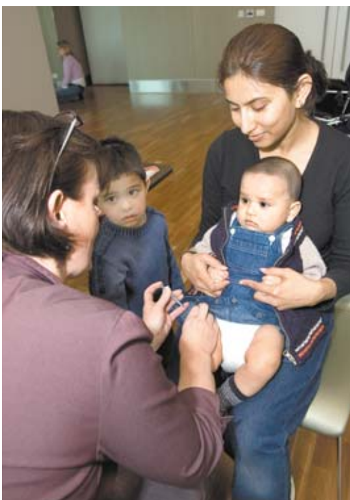
Families can now visit Carnegie Library and Community Centre for immunisation sessions.