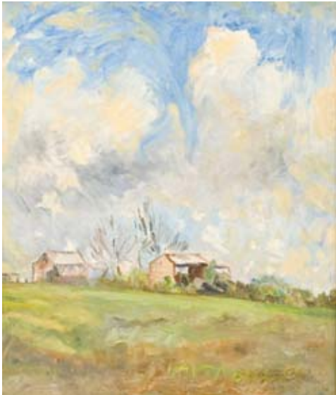
Arthur Boyd, Farm Murrumbeena Road , 1935.

G len Eira City Council Gallery is proud to present a celebration of the lives and works of Glen Eira's renowned Boyd family, The Murrumbeena Boyds; Just like us — but different .