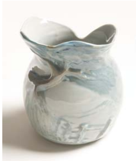
Merric Boyd, Vase , 1933.

G len Eira City Council Gallery is proud to present a celebration of the lives and works of Glen Eira's renowned Boyd family, The Murrumbeena Boyds; Just like us — but different .