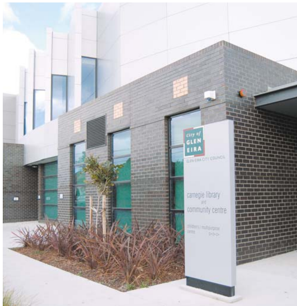
Carnegie Library and Community Centre sets a benchmark for future developments in Glen Eira.

Carnegie Library and Community Centre is a resounding success and provides a benchmark for future developments within Glen Eira.