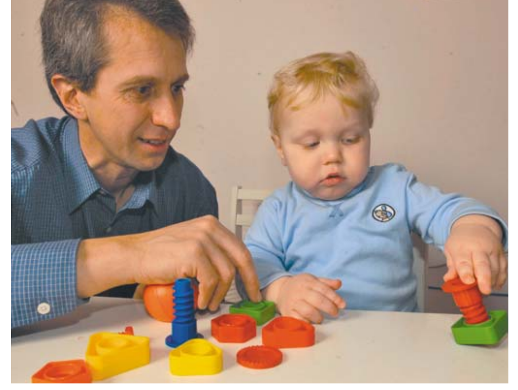
Council's Maternal and Child Health team provides a free confidential services for families with children from birth to six years.

Australian Breastfeeding Association used the grant to purchase up-to-date breast pumps to hire out to breastfeeding mums within the municipality.