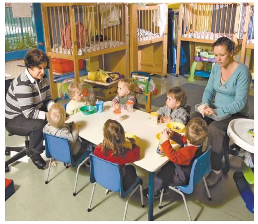
Council's four children's centres provide long day care for children between six months and school age.

"By parents sharing with careproviders information about their child, such as their interests, skills and ability, not only will this enhance the overall program, but it will allow the careprovider to better understand each child."