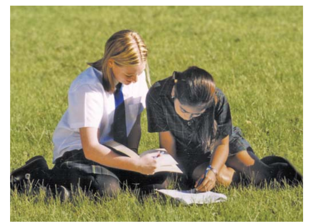
In 2007, Council will visit all secondary schools and vaccinate all female students.

As part of the National Immunisation Program, Council will visit all secondary schools and vaccinate all female students this year. This means more than 3,700 females aged 12-18 will be vaccinated by Council's Immunisation Team with the Gardasil®.