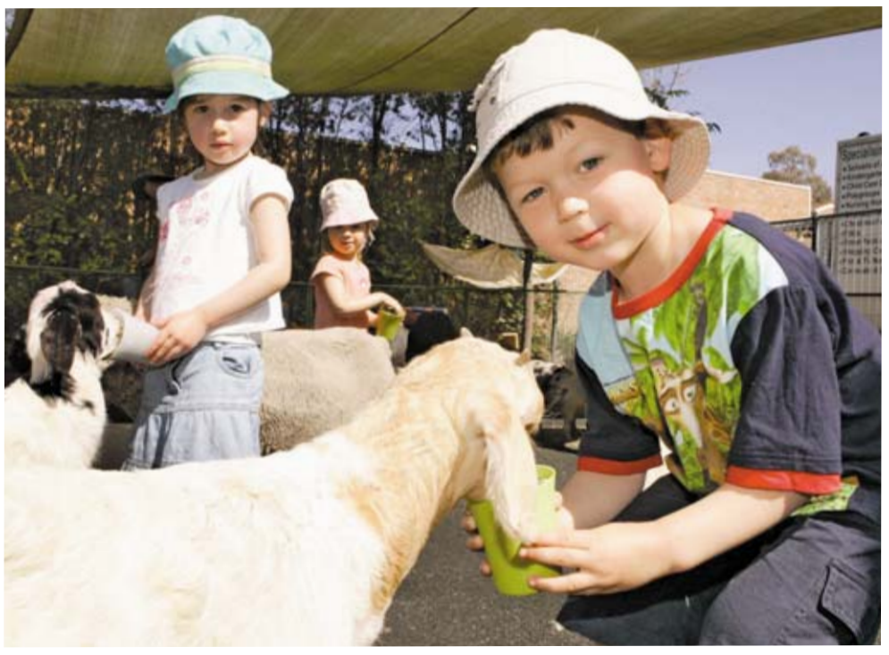
A travelling farm visited Murrumbeena Children's Centre in December.

Council's libraries provide special events throughout the year such as activities for schools in Children's Book Week and a summer reading program.