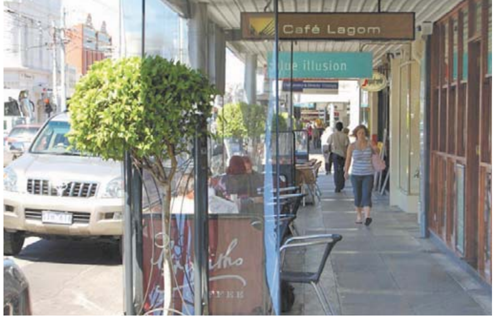
The key to an effective accessible pedestrian system throughout shopping precincts is the development and maintenance of a continuous path of travel.

such as tables and chairs, windbreaks and heaters, where they should be located. In all cases applicants must submit details as to the colour, and design of the furniture for approval; and