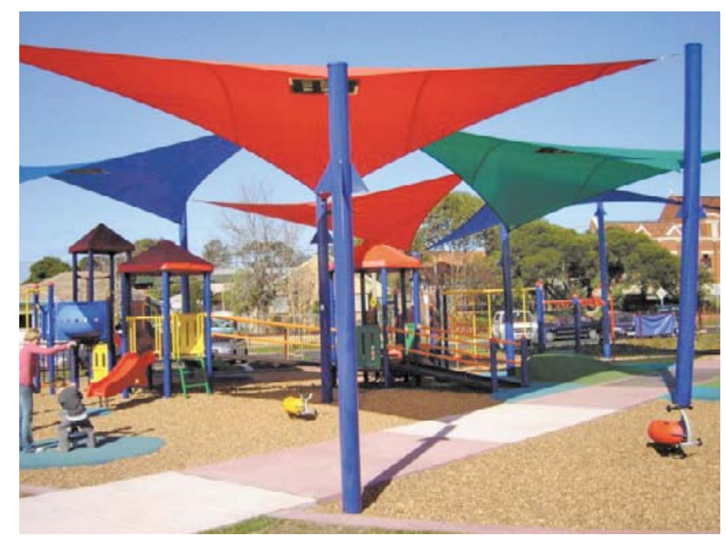
Bentleigh/Hodgson Reserve is home to one of the many playgrounds in the City of Glen Eira.

Shade sails were also installed at Allnut and Victory Parks in Bentleigh, Bentleigh Hodgson Reserve, Bentleigh and Joyce Park, Ormond.