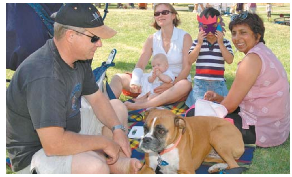
There will be something for the whole family at Party in the Park.

For further information, watch out for the March edition of the Glen Eira News or contact the Council's Service Centre on 9524 3333.