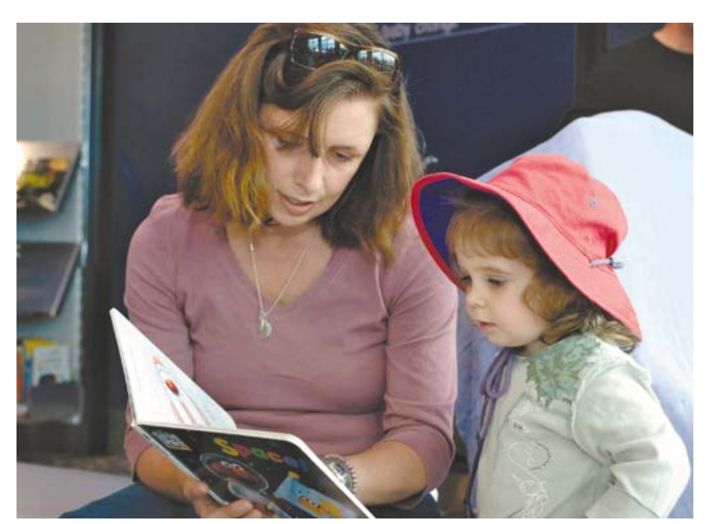
Storytime provides parents with a wonderful opportunity to introduce young children to the joys of reading and selecting books.

In 2007, Glen Eira City Council will once again provide a diverse range of high quality family and children's services to meet the needs of families with children from birth to 12 years.