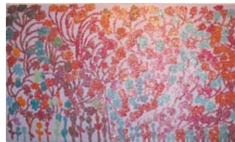
Georgia Szmerling — Flowers with gold , 2006, Acrylic on canvas.

Georgia Szmerling's painting and works on paper are alive with surfaces recalling shimmering fields of flowers. Metallic paints and detailed dot patterns combine with abstract flower patterning to create paintings full of movement, colour and sensuality.