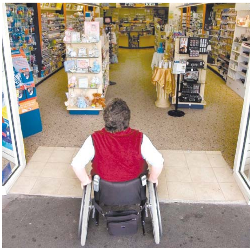
Good access makes good business sense.

"However, one of the simplest and cheapest solutions is to change the way businesses think about customer