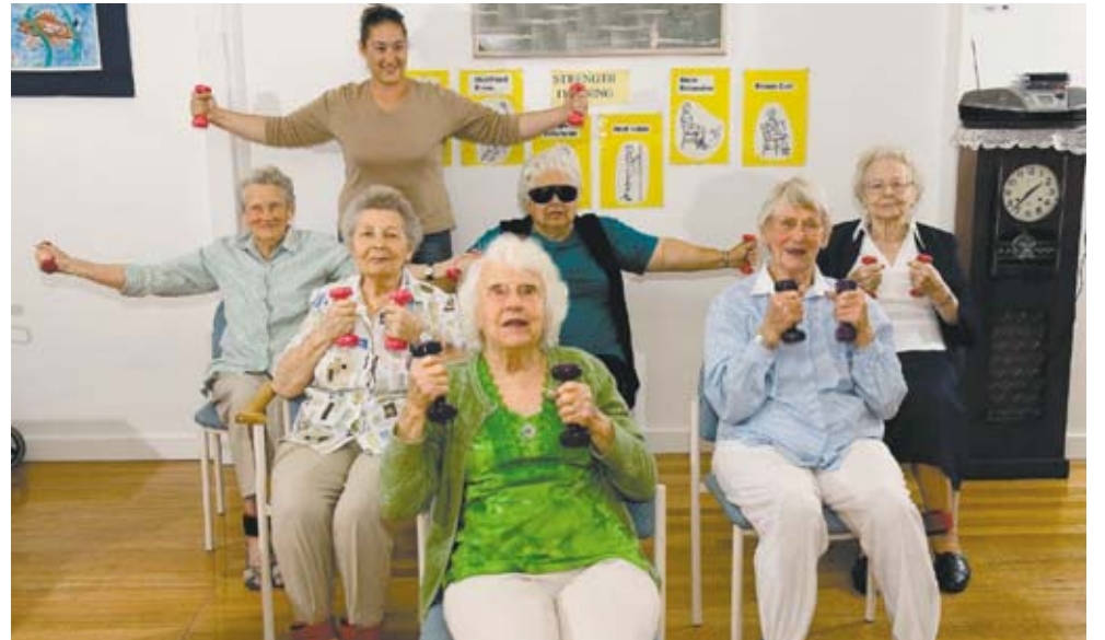
Exercise classes are just some of the many activities offered to participants of Council's Social Support Program.