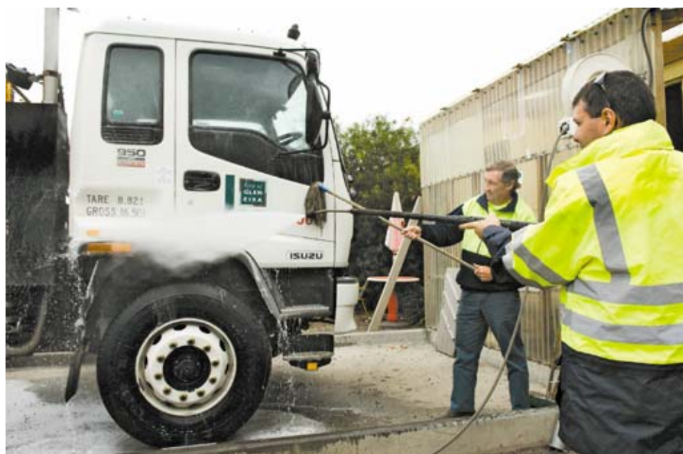
Since October 2003 the use of townwater to wash down the maintenance trucks and to fill up the hotmix and asphalt rollers has been replaced with rainwater.