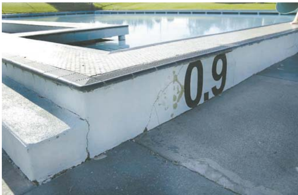
Repairs to the cracks at the East Boundary Road pool have a limited lifespan.