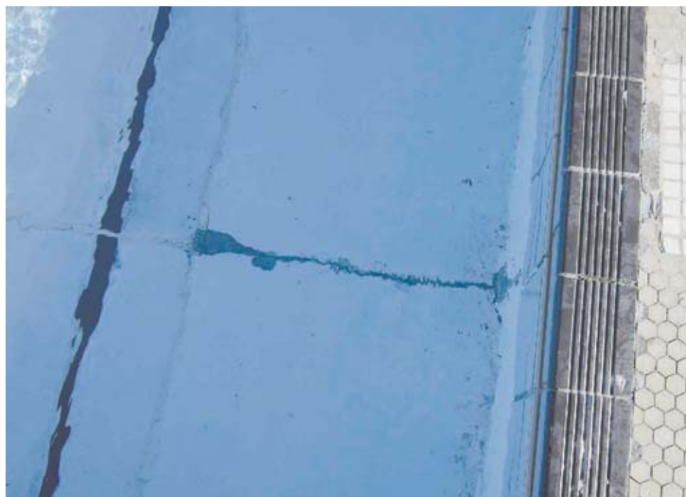
Cracks in the East Boundary Road pool leak 45,000 litres of drinking-quality water per day.

The emerging needs ought to be provided for, in addition to outdoor swimming.