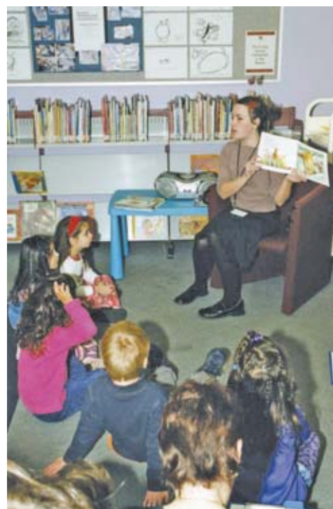
Storytime sessions will include songs and stories.

Friday 25 May at 11am Elsternwick Library — 4 Staniland Grove, Elsternwick Phone — 9532 9321