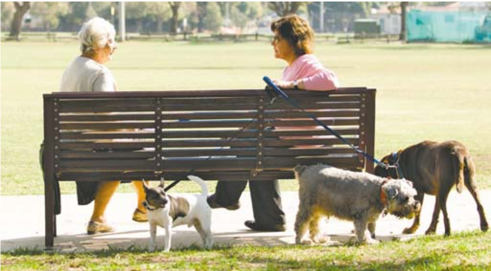
Council's Civic Compliance Unit has received some well deserved praise for the service it provides to the community.