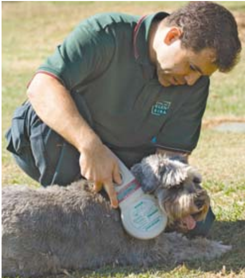
To identify the animal, a scanner that reads microchip numbers is passed over the skin. are available from Council's Service Centre or can be downloaded from www.gleneira.vic.gov.au