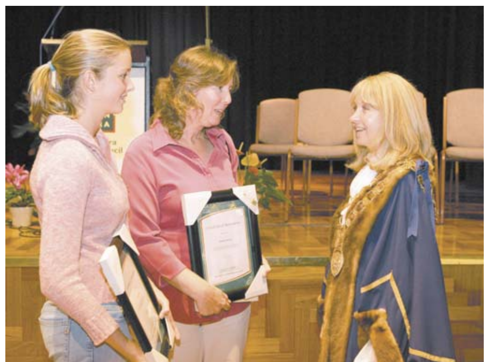
Awards will be given to volunteers who have contributed 500, 1,000 or 2,000 hours of service or have achieved 10 or more continuous years of service for an organisation.

"Council is delighted to have this opportunity, in front of family and friends, to publicly recognise our local volunteers contribution, who have enriched the lives of the people right across the community."