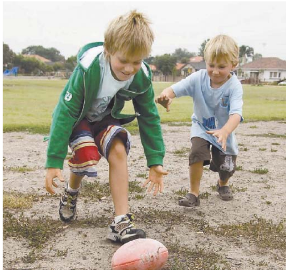
The start of the winter sport season has been delayed.

Park Services has undertaken a major program to oversow sportsgrounds with a specialised blend of rye grass designed to germinate quickly and cope well under the wear and tear of the winter sports season.