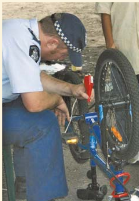
A free bike engraving service is offered to Glen Eira residents.

Victoria Police is targeting bicycle thieves following a 25.5 per cent increase in the number of bikes stolen in the City of Glen Eira in the past year.