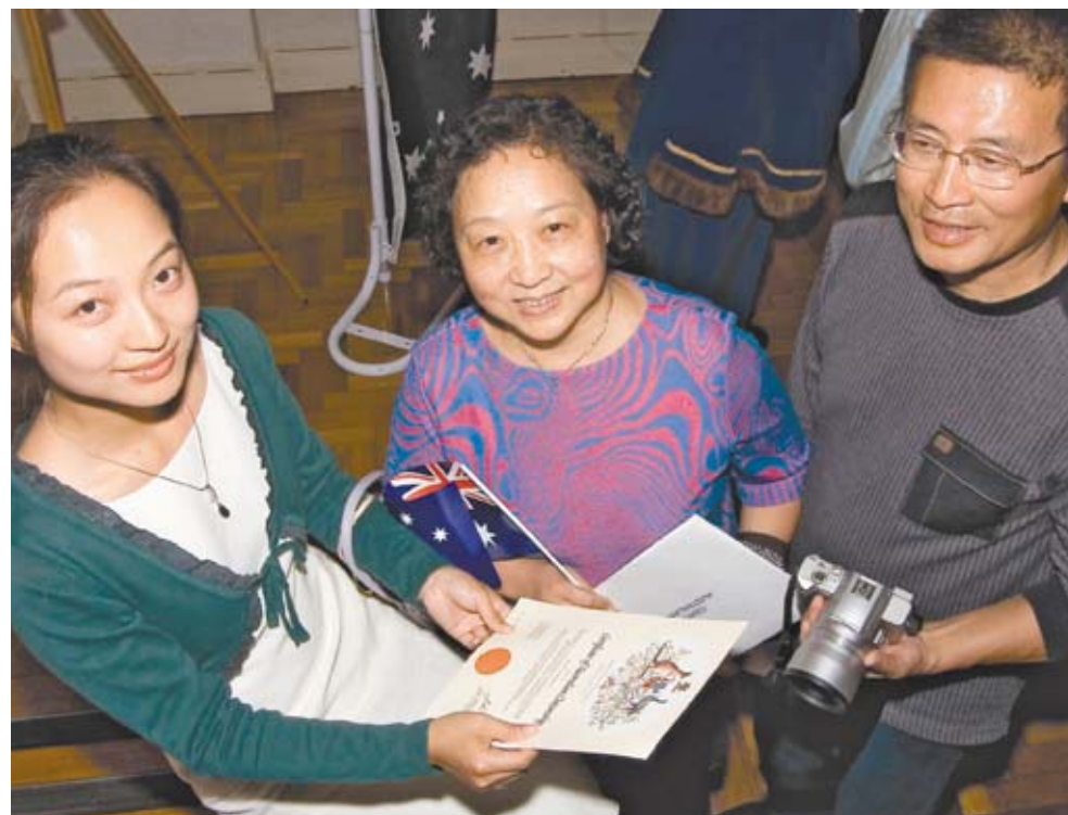
Three hundred and seventy men, women and children can now call Australia home after making their Australian citizenship pledge.

The Mayor of Glen Eira hosts the ceremonies, leads migrants through their pledges and then presents them with a Certificate of Citizenship — the final step to becoming an Australian citizen.