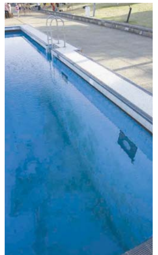
Dive pool algae at the Koornang Road Centre.

detailed design. (The Local Government Act requires a public tender process);