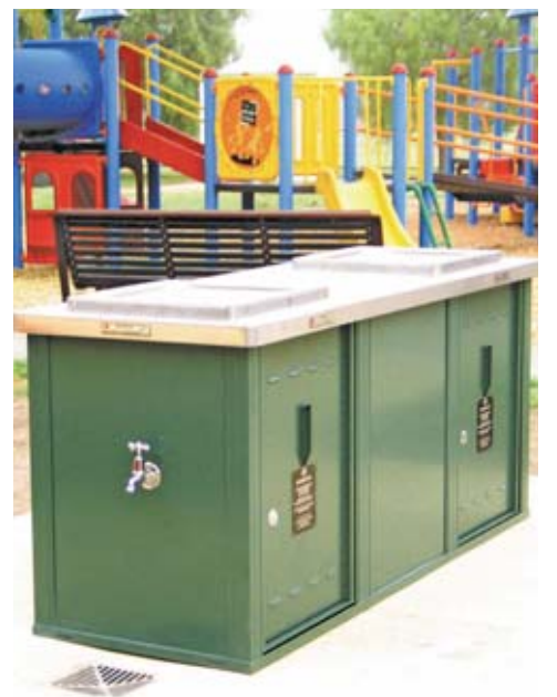
Koornang Park is just one of three parks to have a new barbecue installed.

All barbecues in Glen Eira are free to use.