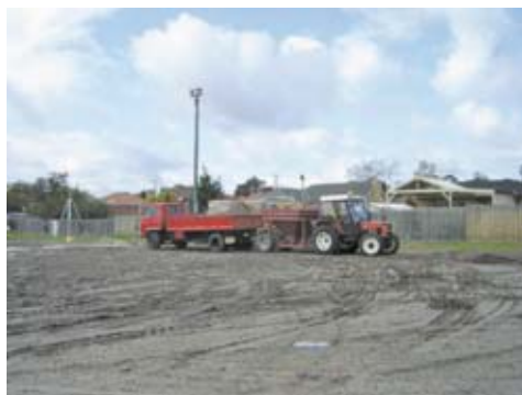
Marlborough Reserve in Bentleigh East has been the site of much recent activity.

Earthmoving equipment was brought in to reshape the surface, drip irrigation has been installed and drought tolerant, warm season grasses have been resown. Glen Eira City Council apologises for any inconvenience these works have caused. It is expected that the fences to the sportsground will be removed in June, but this will be weather dependant.