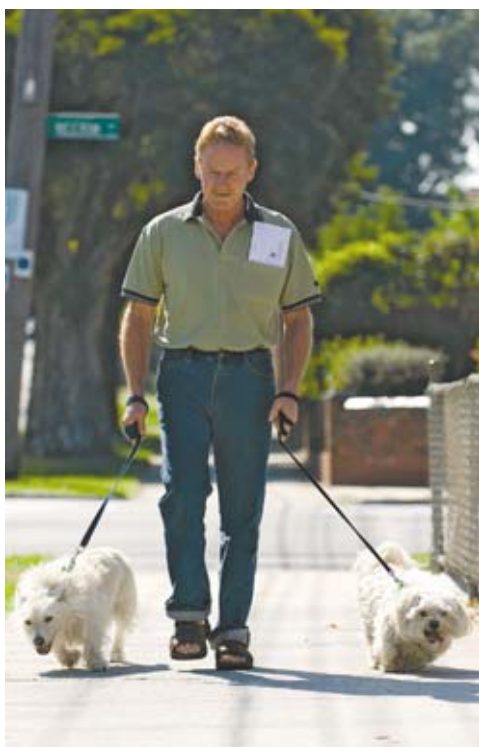
The State Government's Responsible Pet Ownership Program informs potential pet owners on choosing the right pet.

The Program , which was developed by the Victorian Canine Association on behalf