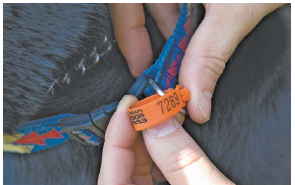
A $40 voucher booklet will be given to residents who register their pets for the first time with Council.

This Scheme is not available to owners who are renewing current or lapsed registration. ■