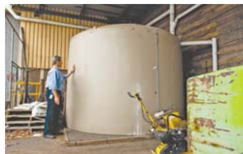
The 5,000 gallon tank holds 22,700 litres of rainwater.

"We would have just a little bit of rain over a weekend, barely enough to water