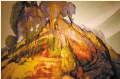
Maureen Slatter — Magic Mountain, 2006, Acrylic.

Glen Eira City Council's Gallery is proud to host the 98th annual exhibition of the Melbourne Society of Women Painters and Sculptors.