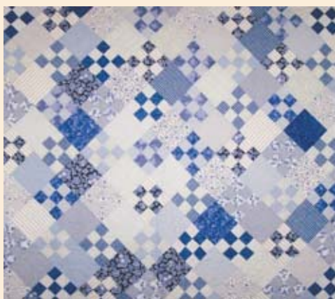
Toni Moore — Untitled (detail), 2006, 9 Patch Pattern on Point.

Fabric Obsessions will be officially opened on Wednesday 16 May at 7pm.