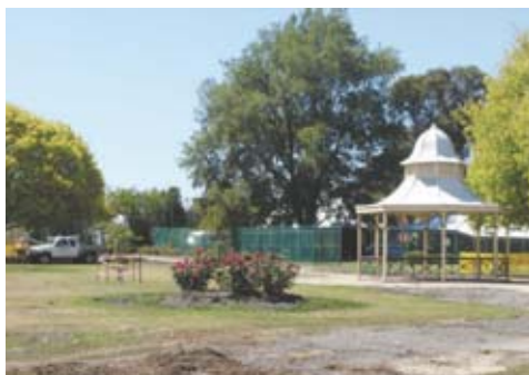
Redevelopment works are expected to be completed by the end of June.

The redevelopment works at Joyce Park in Ormond are continuing at pace. Works to the Jasper Road frontage have been completed, with new pathways, landscaping and lighting being installed. Works on the roadway, automated toilet and landscaping to the western section of the park are expected to be completed by the end of June.