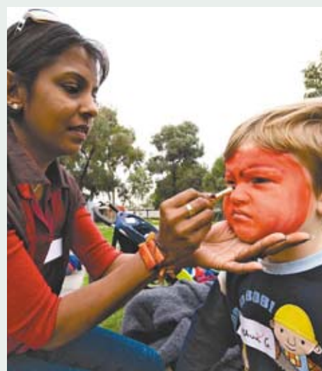
Face painting was just one of the activities enjoyed by children at the breakfast.

Held in DC Bricker Pavilion, Princes Park, the breakfast was held as part of National Families Week .