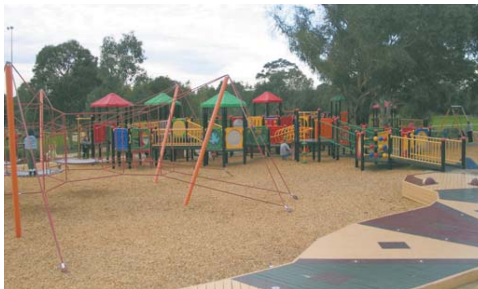
All damaged equipment has been replaced and repaired.

Anyone who has information about this incident or notices suspicious behaviour around any of Glen Eira's parks should contact Caulfield Police on 9524 9500.