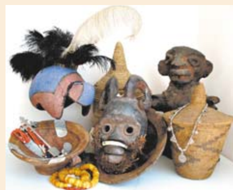
A composite group of traditional pieces from different cultures in Ethiopia, Sudan, Rwanda, Dem Rep of Congo, Liberia and Sierra Leone.

Since 1989 the Sidewalk Tribal Gallery collection has become internationally recognised for its quality and variety of African Tribal Arts. The gallery has built a reputation for its honest and fair dealings with the villagers and traders across Africa and is also acknowledged and respected for this practice among international collectors.