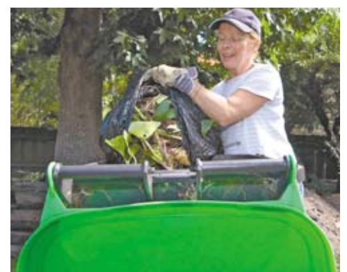
The Guide will tell you all you need to know about Council's green waste collection.

For further information, contact Council's Service Centre on 9524 3333. ■