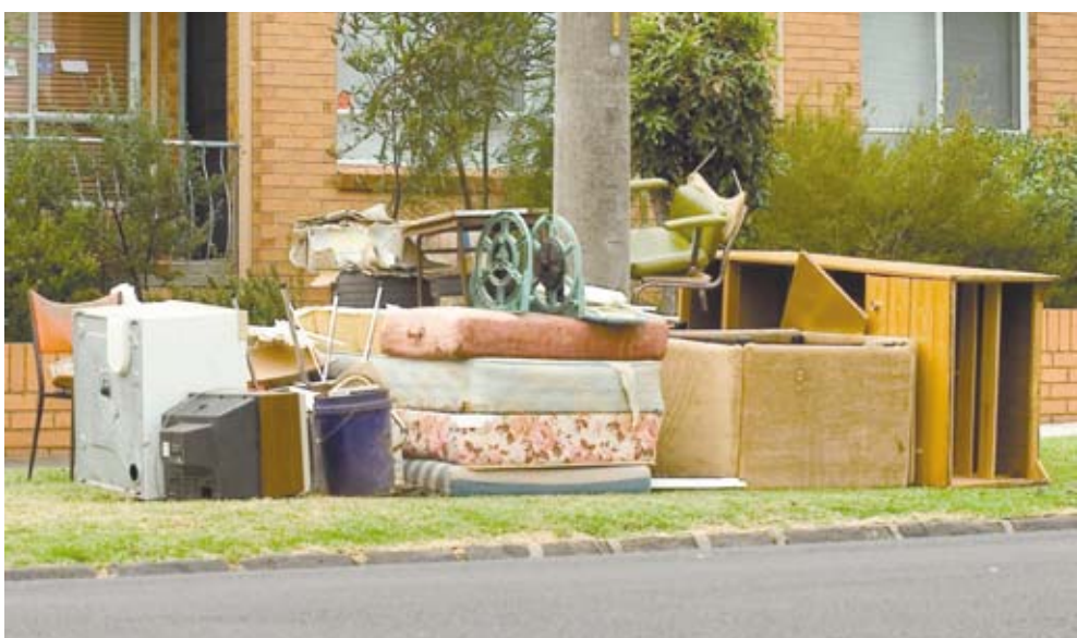
Residents should ring and book a collection and place their hard rubbish out on the Sunday before the collection week.

For further information, contact Council's Service Centre 9524 3333. ■