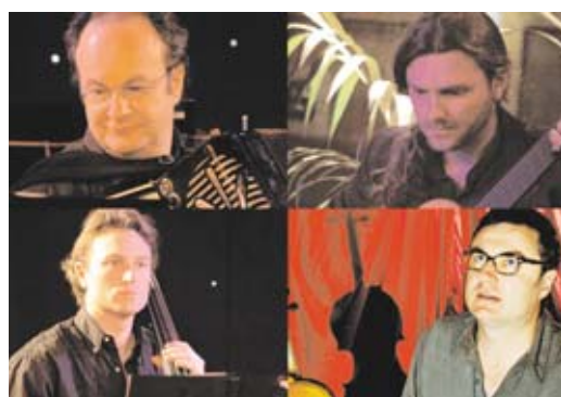
The Raga Dolls Quartet.