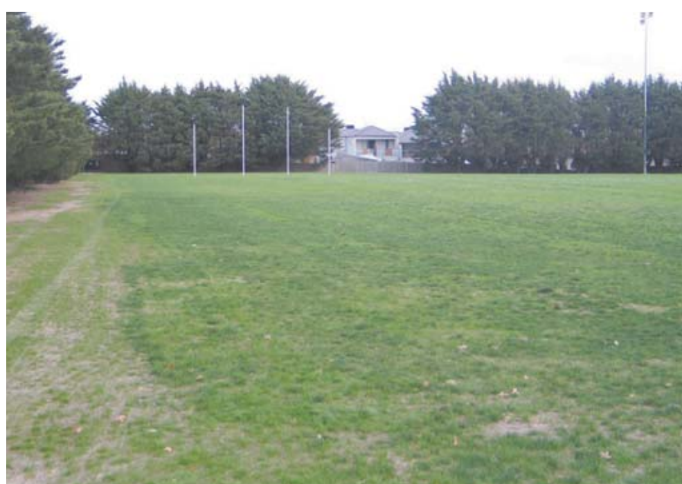
McKinnon Reserve Oval Two will receive a much needed facelift.

As reported in the May edition of the Glen Eira News , Council has also applied