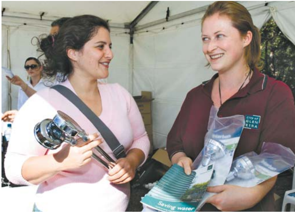
Residents will be able to visit Council's Service Centre in Caulfield South or South East Water's Head Office and pick up a new, three-star rated showerhead.

Residents can pick up a new showerhead from Council's Service Centre, Monday–Friday between 8am and 5.30pm. Alternatively, you can visit South East Water at 20 Corporate Drive Heatherton, Monday–Friday between 8am and 5.30pm.