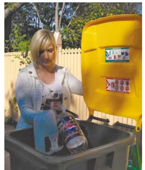
Since the rollout of Council's recycling bins in July 2006, recycling within the municipality has increased by six per cent.

For further information, contact Council's Service Centre 9524 3333. ■