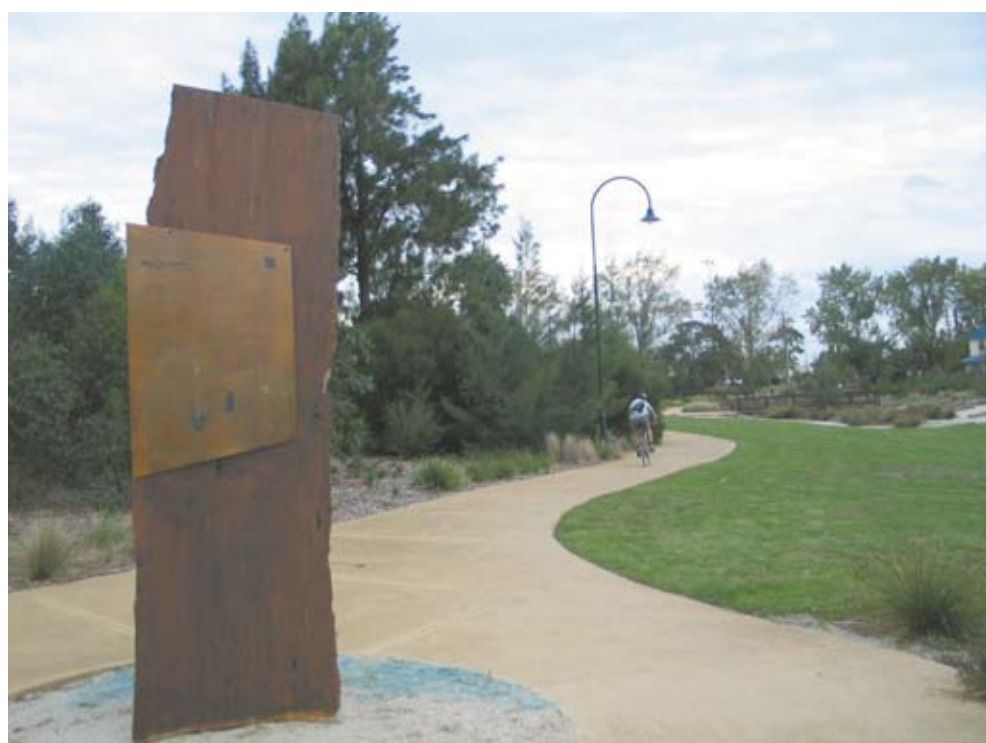
The interpretive trail allows visitors to learn about the Kulin (Aboriginal) people, who were the original inhabitants of the area.

The Walking in Glen Eira brochure kit provides residents with nine self-guided walks, which incorporate some of Glen Eira's most popular parks, reserves and heritage site.