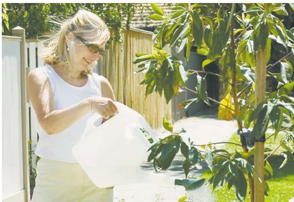
Council is inviting community views on its draft Street Tree Strategy.

Council is inviting community views on three options for the design of the pavilion which will replace the obsolete hex pavilion and old storage facility in Caulfield Park.