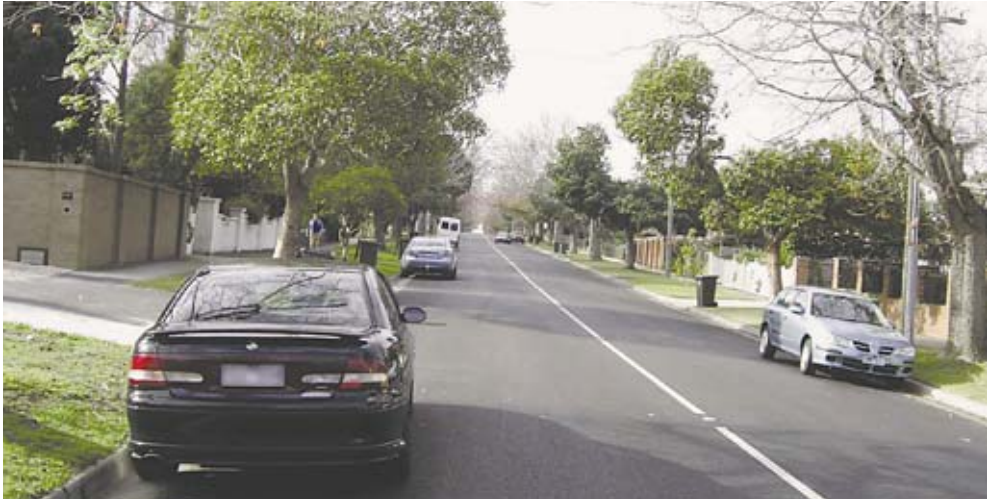
Local road resurfacing: More than $600,000 was spent of resurfacing roads in 2006-07, including McKinnon Road, McKinnon.