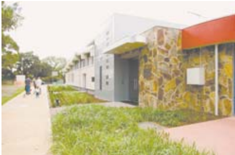
The redesign and refurbishment of DC Bricker Pavilion was completed in March 2007