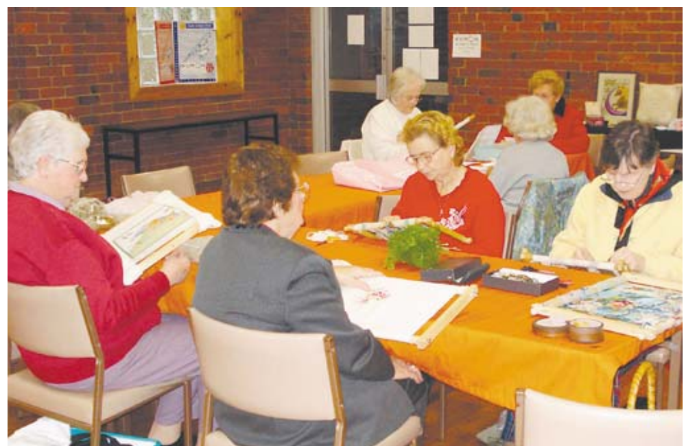
McKinnon Needlepointers in action.