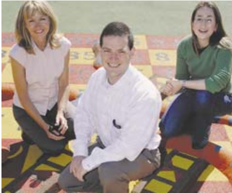
A new snakes and ladders activity area has been built as part of the $3 million redevelopment of Bentleigh Hodgson Reserve.