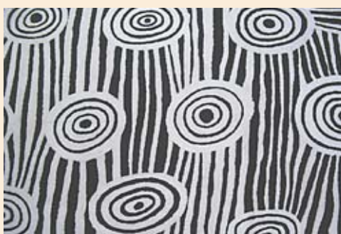
A unique handmade rug combining Aboriginal designs and traditional Kashmiri rug-making techniques.