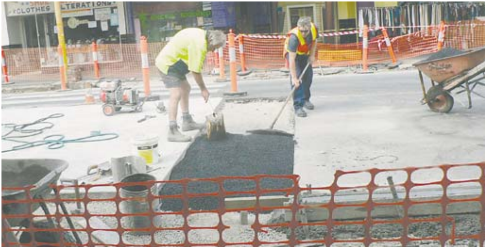
Traffic engineering: $85,000 was allocated towards the construction of the Neerim Road/Murrumbeena Road bus hump in Murrumbeena.