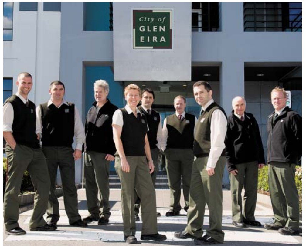
The new uniform will make it clear when Council workers are out and about in the community.

"The uniform is versatile — with caps, gloves, trousers, short and long sleeved shirts, a vest, jumper and jacket — enabling staff to protect themselves