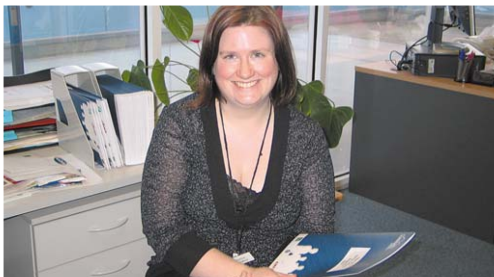
Catherine's role ensures that residents take a proactive approach to safety.

" Community Safety Month creates the opportunity for residents of all ages to participate in various information sessions that cover public space and public health safety," Catherine said.