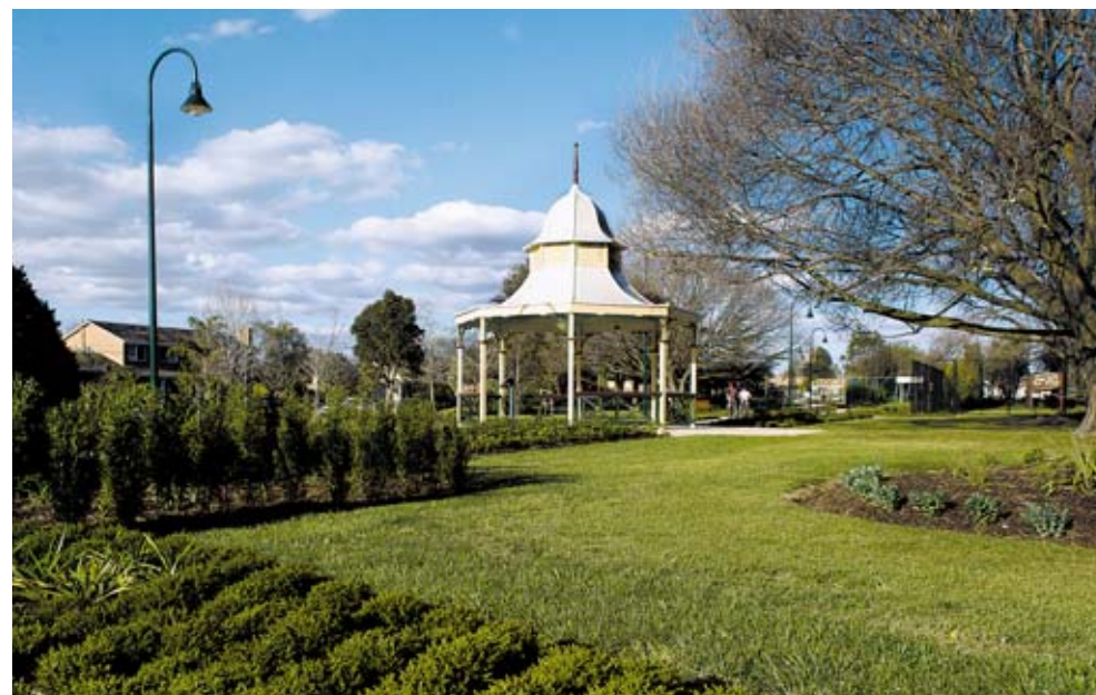
Joyce Park will meet the needs of both current and future park users.

For further information on the Joyce Park celebration events contact Council's Service Centre on 9524 3333