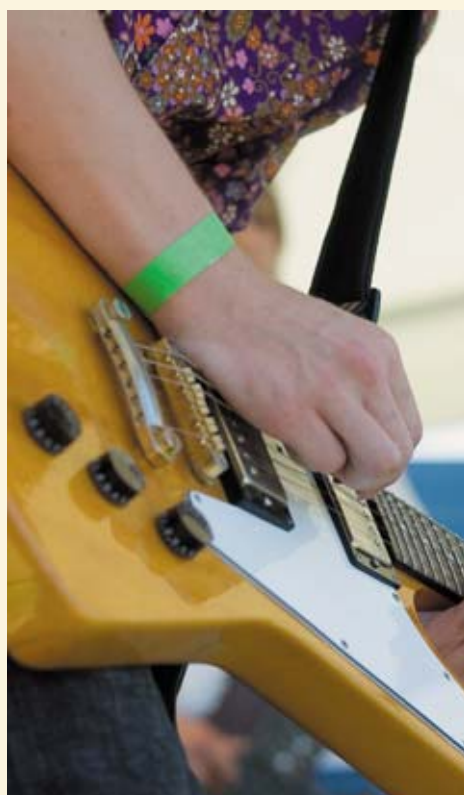
Council is currently in search of budding superstars for the Big Splash Out 08.

For further information on the Big Splash Out 08 music festival contact Council's Youth Information Centre on 9579 7963.