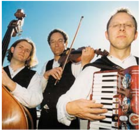
Three-piece group, Klezmeritis .

Klezmeritis will offer a range of Eastern European traditional music including fast, joyous dance tunes with pseudo-Balkan rhythms to slow, melancholic pieces.