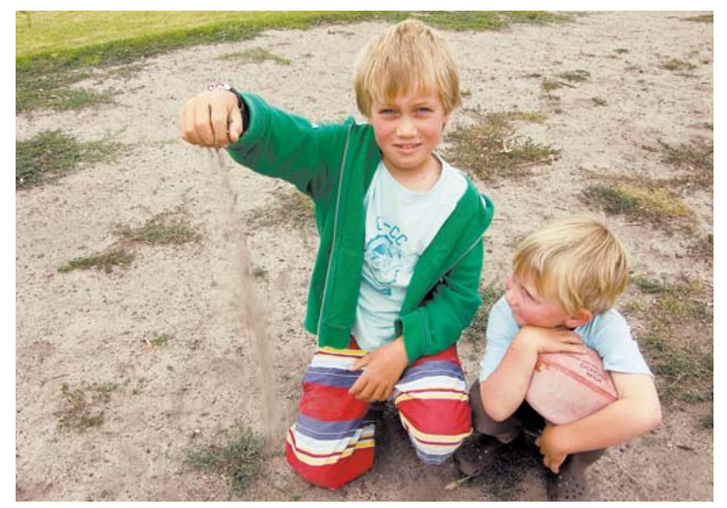
The ongoing effects of the drought and water restrictions are having a significant impact on Council's parks and multi-oval complexes.