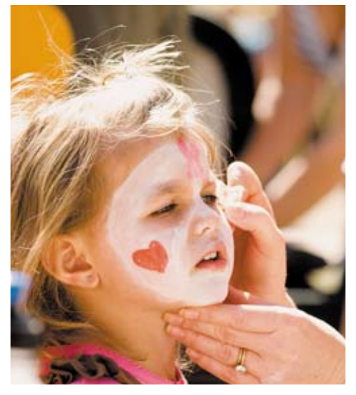
Party in the Park at Allnutt Park will host a range of all-ages activities.

*Local performers will be announced in the February edition of the Glen Eira News.