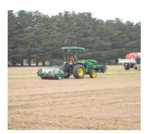
McKinnon Reserve Oval Two has been resurfaced and is temporarily closed.

For further information on the McKinnon Outer Oval resurfacing, contact Council's Service Centre on 9524 3333.