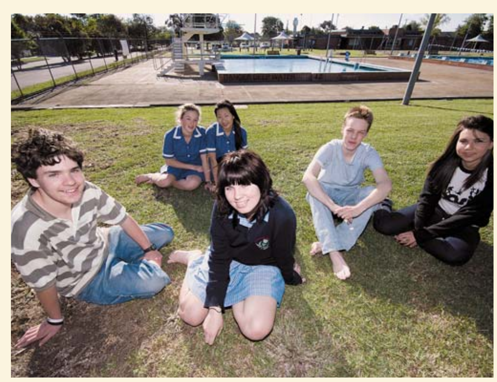
YCG is working hard to ensure the Big Splash Out is a not to be missed event.

The Big Splash Out is not just about having fun, the festival will also provide information about the services available to young people in the City of Glen Eira.