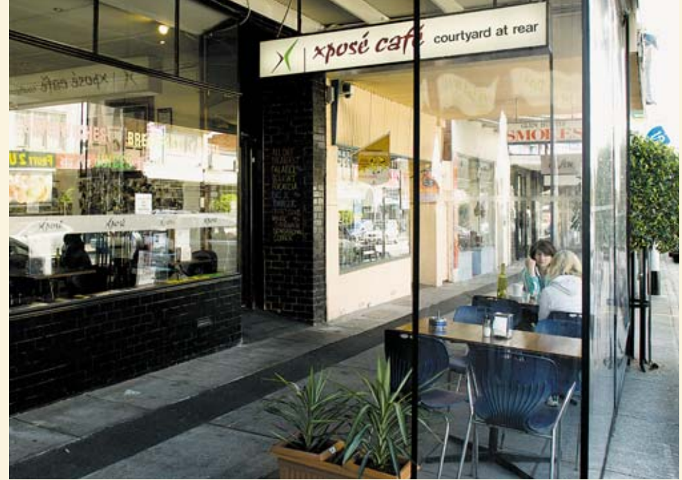
Council's Footpath Activities Guidelines provide a fair and equitable balance for pedestrians and traders.

Council staff will monitor and evaluate all footpath trading on a regular basis. If a permit has not been granted, an infringement of the Footpath Activities Guidelines has been observed or permit conditions are detected, they will be looked into and enforcement action will be taken.