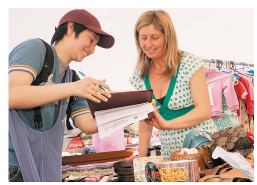
Marketing students from Holmesglen Institute of TAFE conducted interviews at Bentleigh Market to gain a better understanding of the customer base.

To register your interest in participating in Council's BusEd program contact Council's Business Development Unit on 9524 3333.