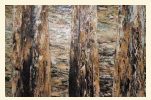
John Brock Fallon Trees, 1986, Oil on canvas.

John's paintings are a contemporary vision of the Australian landscape and focus on the tree and its relationship to persons. His remarkable and unique handlings of his chosen medium of oil paint also explore the ever changing colours and light of the Australian landscape.