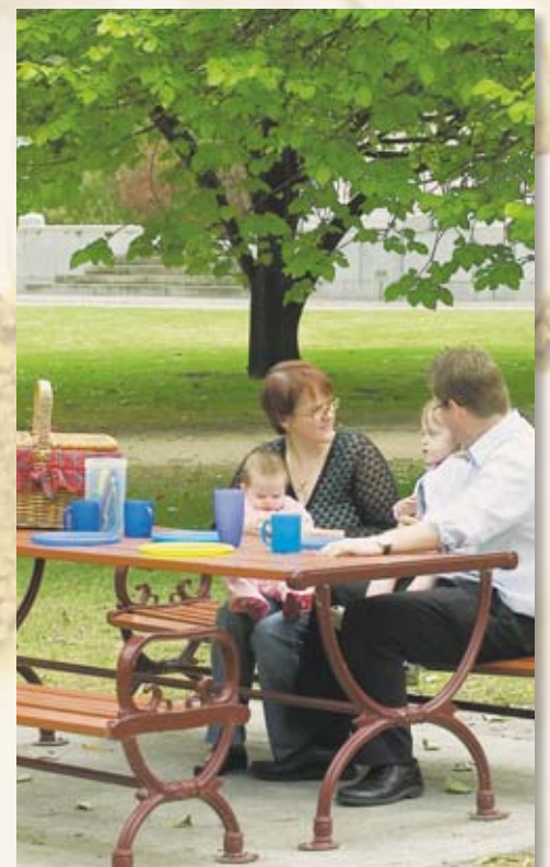
A picnic in the park can be the ideal way to spend your Saturday or Sunday afternoon.

For further information about food safety, contact Council's Service Centre on 9524 3333.