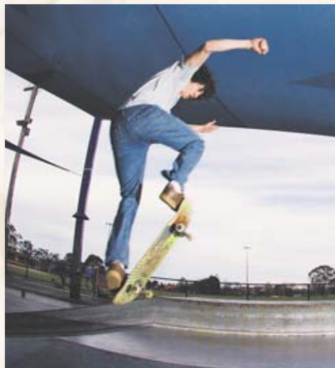
The skate facility at Bailey Reserve is a great venue for the young people of Glen Eira.

Conditions of use: Displayed at the skate facility.