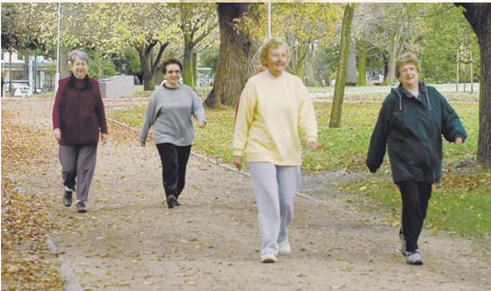
Being part of a walking group is a great way to meet new people, get some exercise and stay motivated.