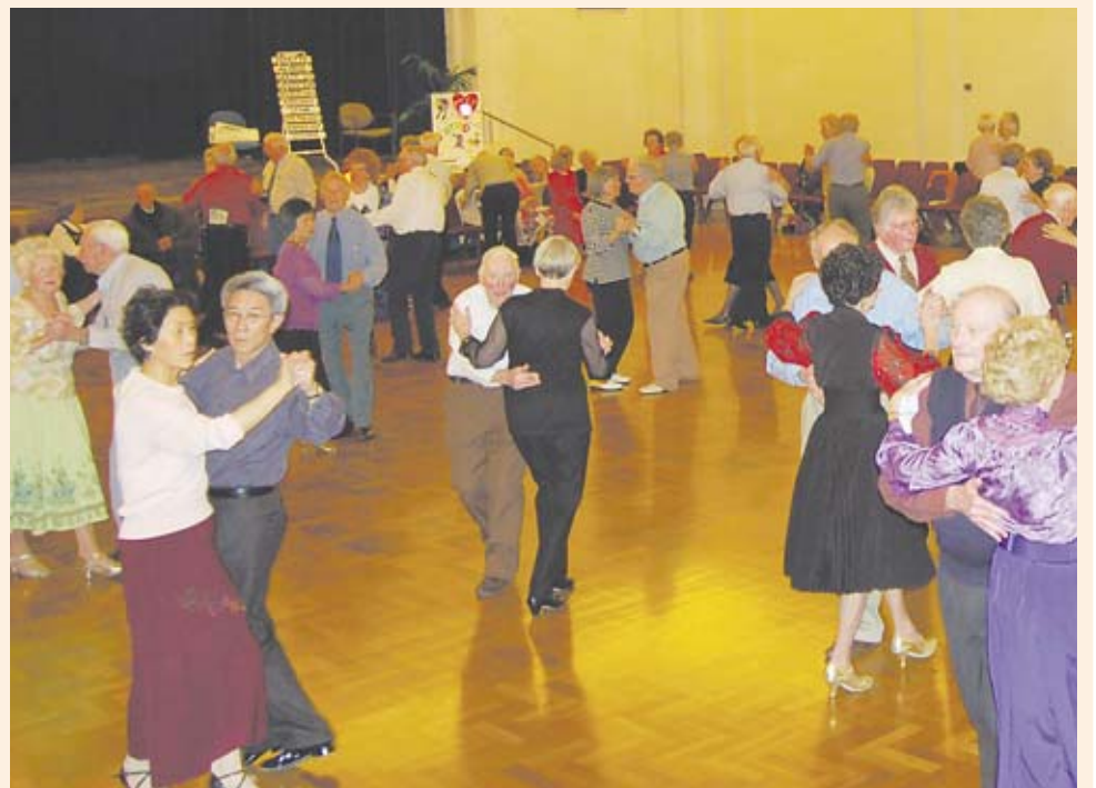
Residents will have the opportunity to enjoy an afternoon of old time, new vogue dancing with the Caulfield Over 50s Dance Group.

"The community events are put together by various local groups and are a great cultural experience. Alongside Council's events, they are guaranteed to provide two weeks of enjoyment for senior residents."