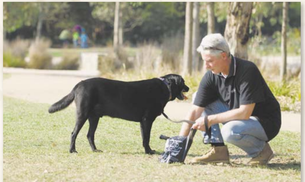
Dogs are welcome in many Glen Eira parks and reserves, provided their owners abide by the orders made by Council.

Visit www.gleneira.vic.gov.au for more detail on specific off-leash areas and requirements or contact Council's Service Centre on 9524 3333.