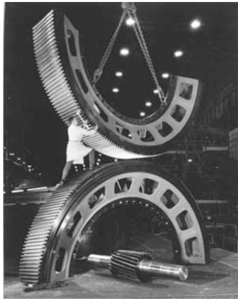
Gears for mining industry, Vickers-Ruwolt, Melbourne — 1967, gelatin silver photograph.