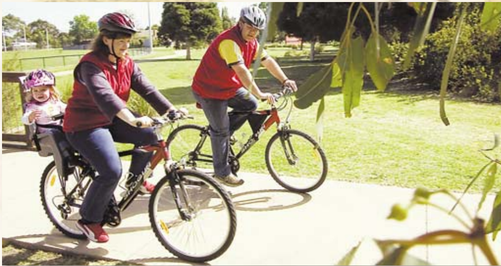
Glen Eira has a great range of bike paths to suit all ages and abilities, from experienced cyclists through to families.

For a full list of parks with bike paths, riding trails and things to see on your travels in Glen Eira, go to www.gleneira.vic.gov.au or visit Council's Service Centre and ask for the On Your Bike cycling guide.