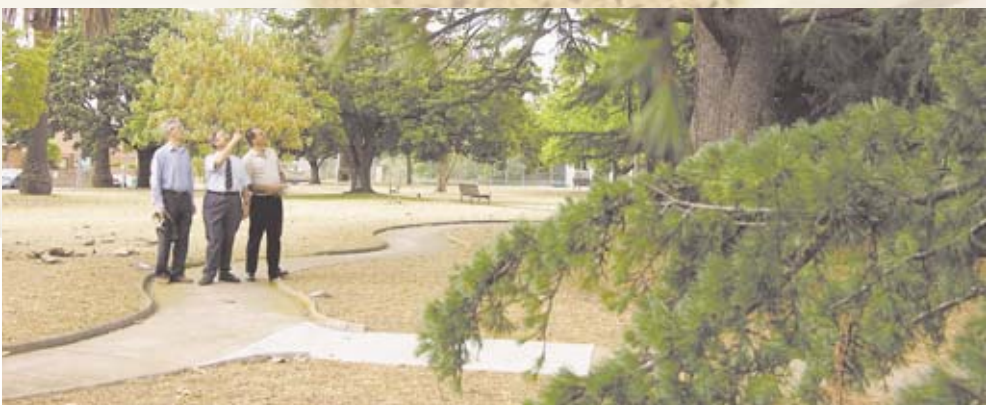
Hopetoun Gardens Interpretive Tree Walk in Elsternwick.

For further information, visit Council's Service Centre and pick up a Walking in Glen Eira brochure series kit.