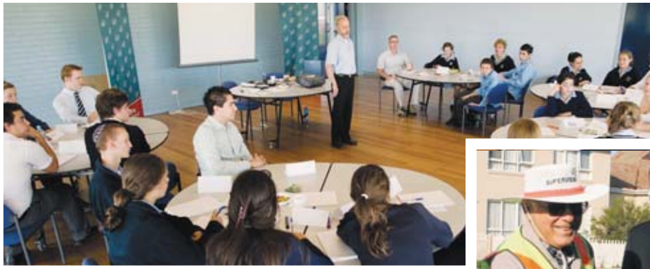
Glen Eira students participated in a youth roundtable in April.