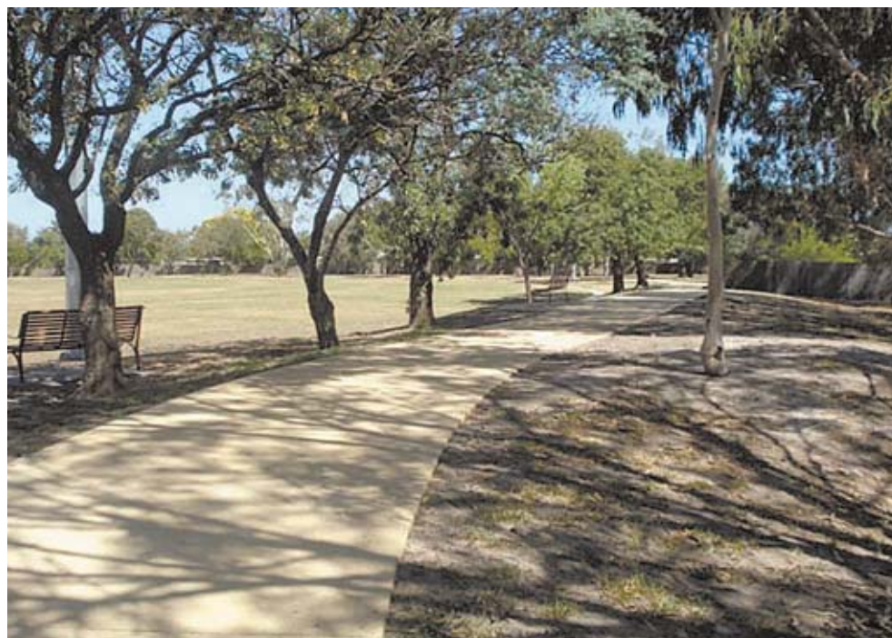
This new shared pathway at King George VI Reserve can be used by both pedestrians and cyclists.

New senior playground equipment is also planned to be installed shortly,