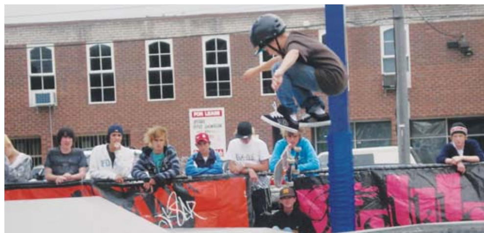
The 2008 Bentleigh East Skate Jam attracted 40 competitors.

To find out how you can be involved, contact Youth Services on 9579 7963.