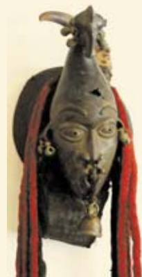
Bamileke Mask, Oku, Cameroon Grasslands.