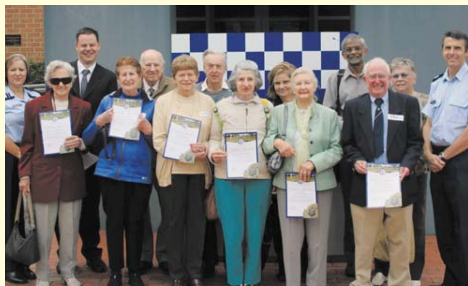
A morning tea was held recently to say thank you to those people within the Glen Eira community who have helped set up the Glen Eira Police Senior Citizens Register.

"Volunteers will not only process any new applications that have come in, but they will make regular phone