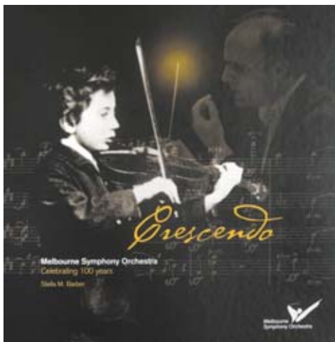
Crescendo — 100 years of the Melbourne Symphony Orchestra.