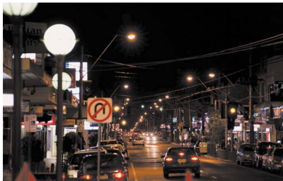
Council pays the entire cost of lighting the local road network.