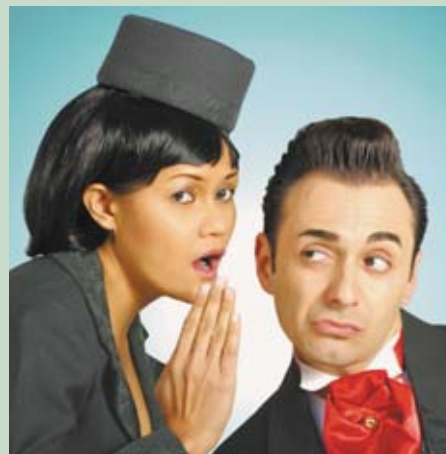
Marvels of Magic.

No bookings are required for this event. ■