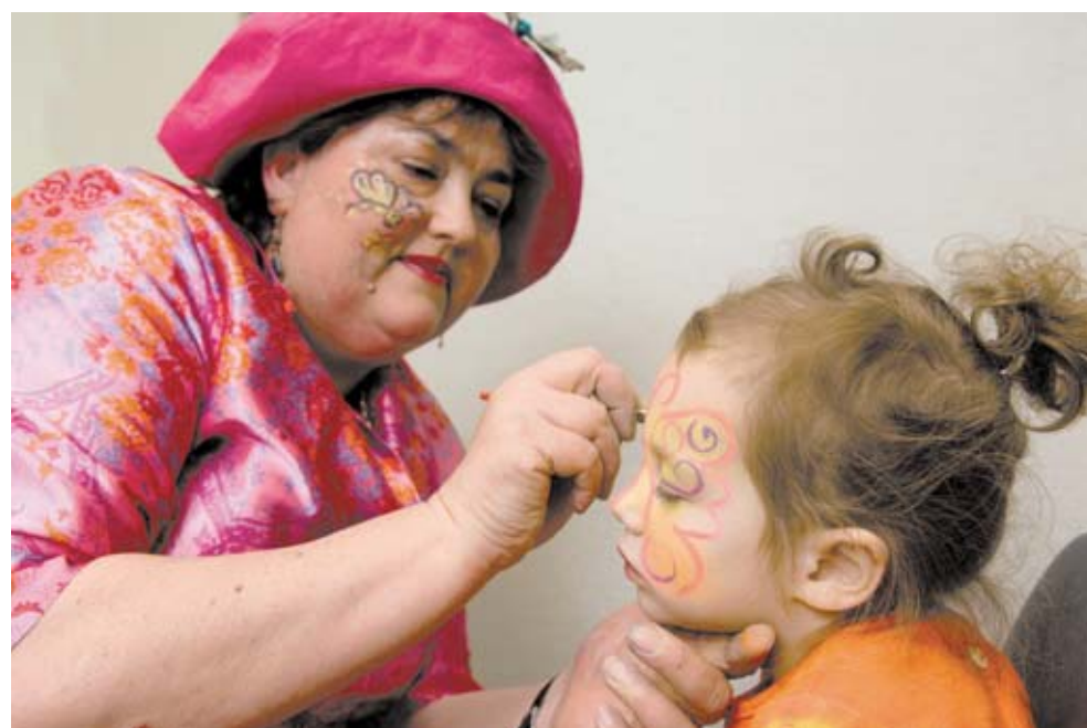
Face painting is just one of the many activities offered as part of Council's special four-year-old immunisation session.

"I think the session is a fantastic idea and would recommend it to anyone."