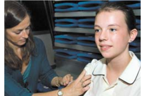
The Gardasil vaccine helps protect against cervical cancer.

Council's immunisation team visits all secondary schools to administer the Hepatitis B and Chicken Pox vaccines to Year Seven students and Diphtheria, Tetanus and Whooping Cough vaccine to Year 10 students.