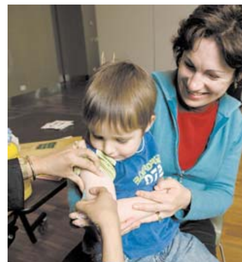
Immunisation protects children and adults from harmful infections.

"We are very lucky to have this service as it helps in protecting our children against sickness," Nicky said.