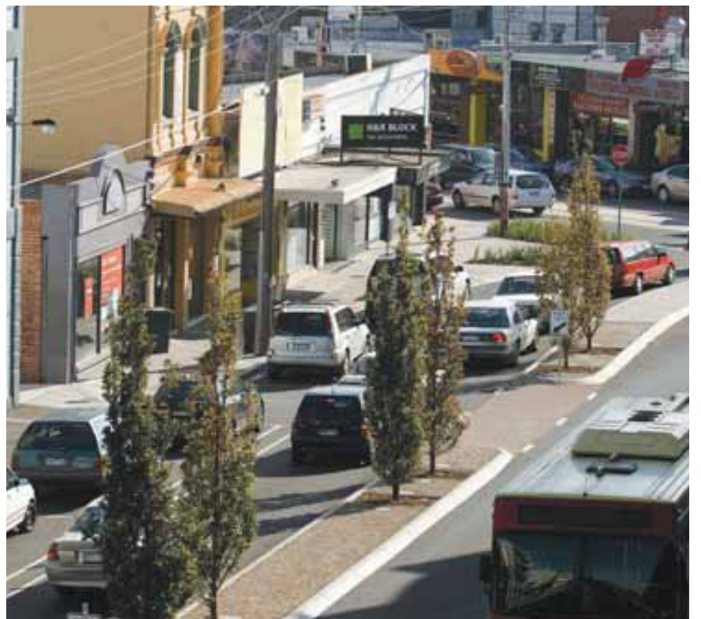
View in Horne Street toward Glenhuntly Road showing a bus zone and central median planting.

The Interchange project was constructed in stages and involved the provision of bus bays, traffic slowing and pedestrian crossing points, a central median, street trees, up-lighting, landscaping, seating, paving and bicycle parking.