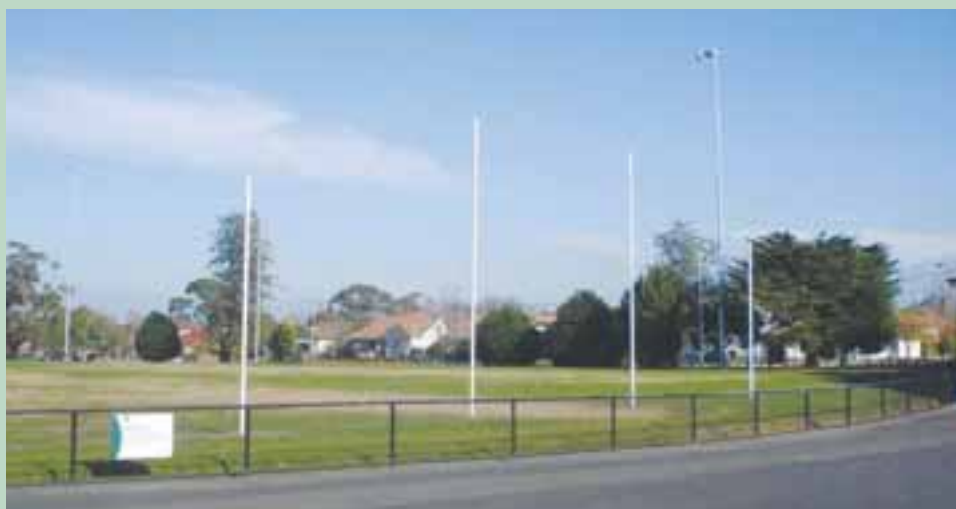
New lighting has been installed at EE Gunn Reserve, Ormond.

Sportsground lighting has been installed at the Caulfield Park main ground (two poles), Murrumbeena main ground (two poles), EE Gunn Reserve, Ormond (two poles) and Moorleigh Community Village Reserve, Bentleigh East (three poles).