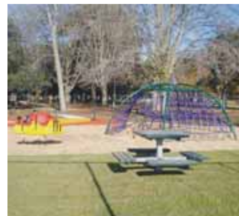
The new playground features a unique design worthy of a visit.

It is certainly worth a visit so rug up and enjoy all that this park has to offer.