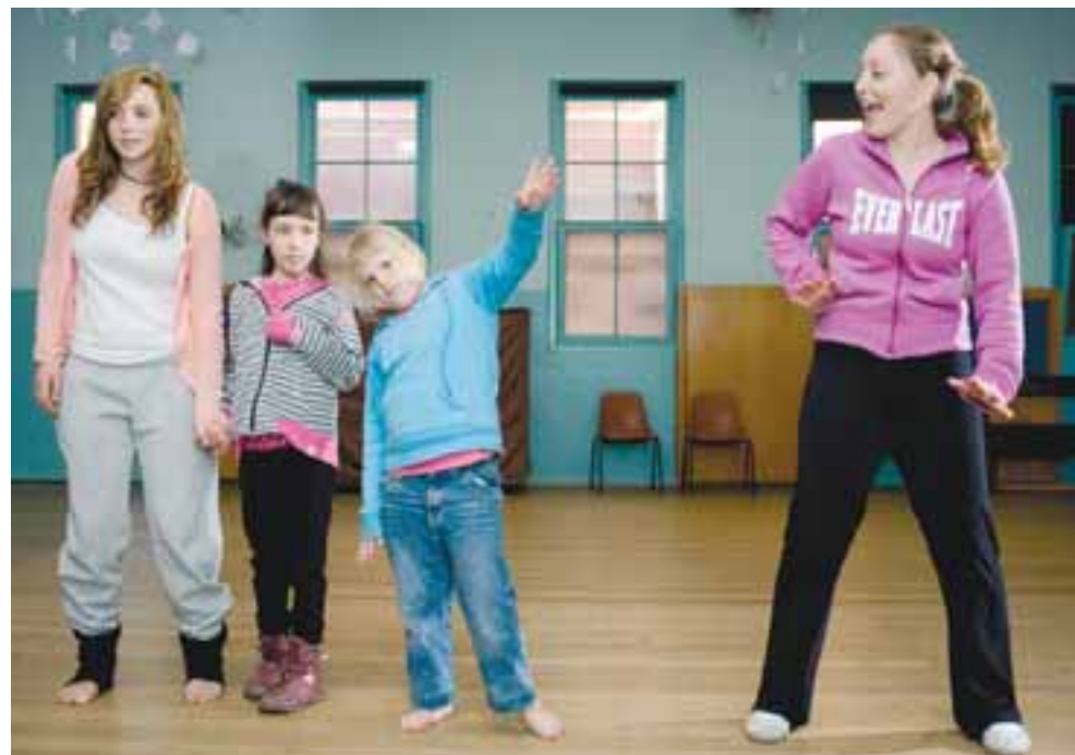
The Dance Funk program provides children with a disability the opportunity to socialise and make new friends.