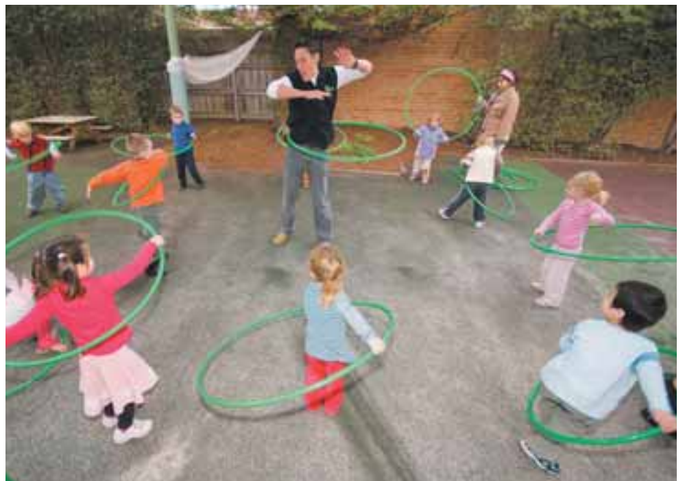
In the effort to further promote the Kids — Go for you Life program, a mobile education centre visited Murrumbeena Children's Centre in June.

For further information on the Kids — Go for Your Life program visit www.goforyourlife.vic.gov.au