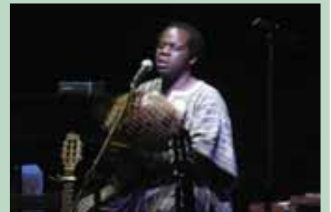
Valanga will perform at the Carnegie Library and Community Centre.

This free event is suitable for children three years and over. No bookings are require. ■