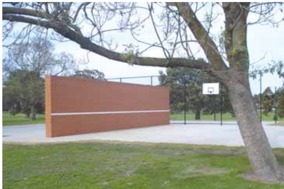
A new tennis rebound wall and basketball and netball facilities have been constructed at Caulfield Park.

A free golf practice cage is also located next to the new facility at Caulfield Park and is open to the public during daylight hours.