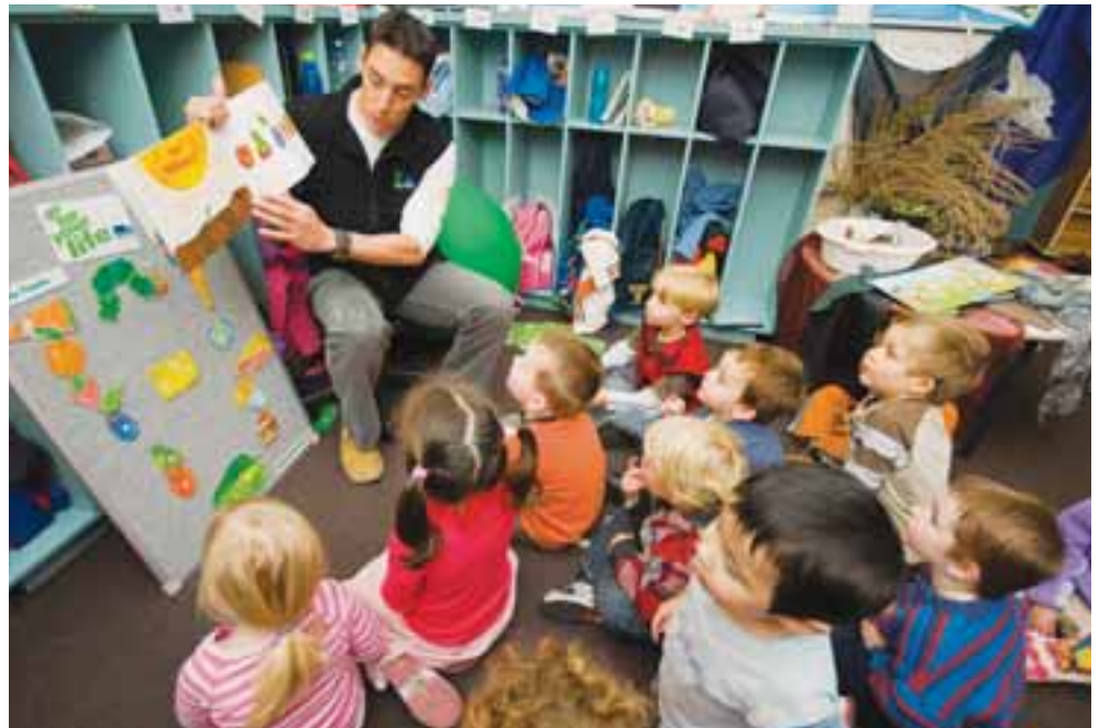
Child care settings play a role in promoting healthy bodies.