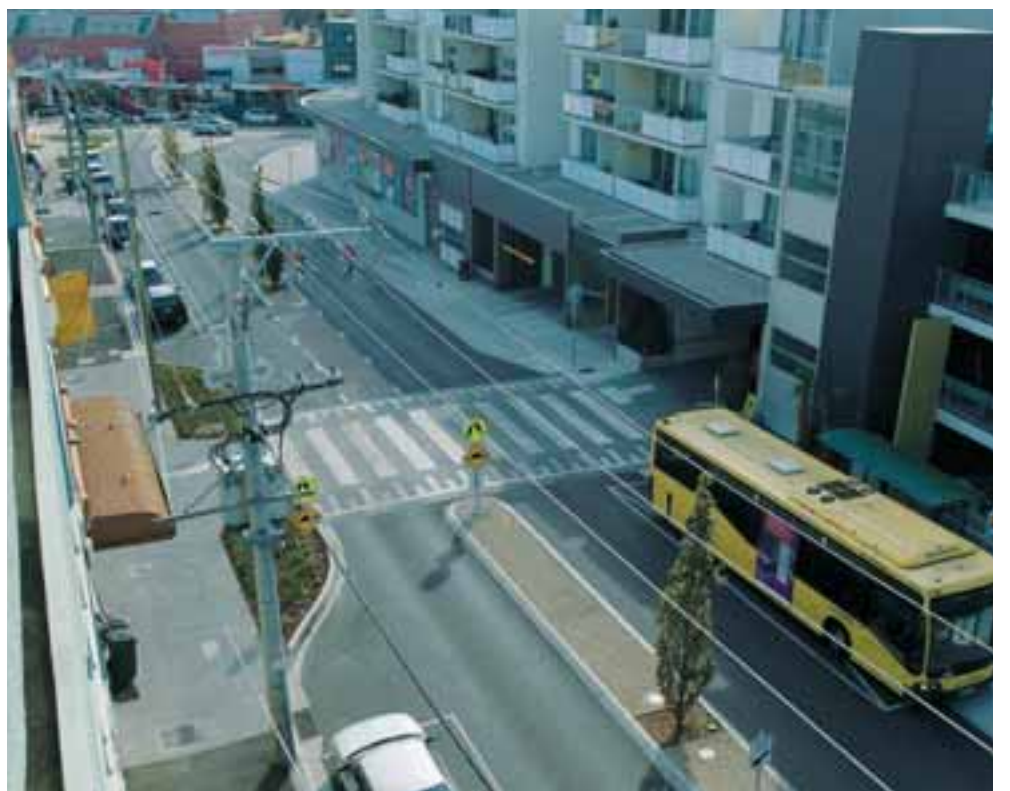
View in Horne Street showing a bus stop, and the new pedestrian crossing which links with Glenhuntly Road via an arcade within the existing hub development.