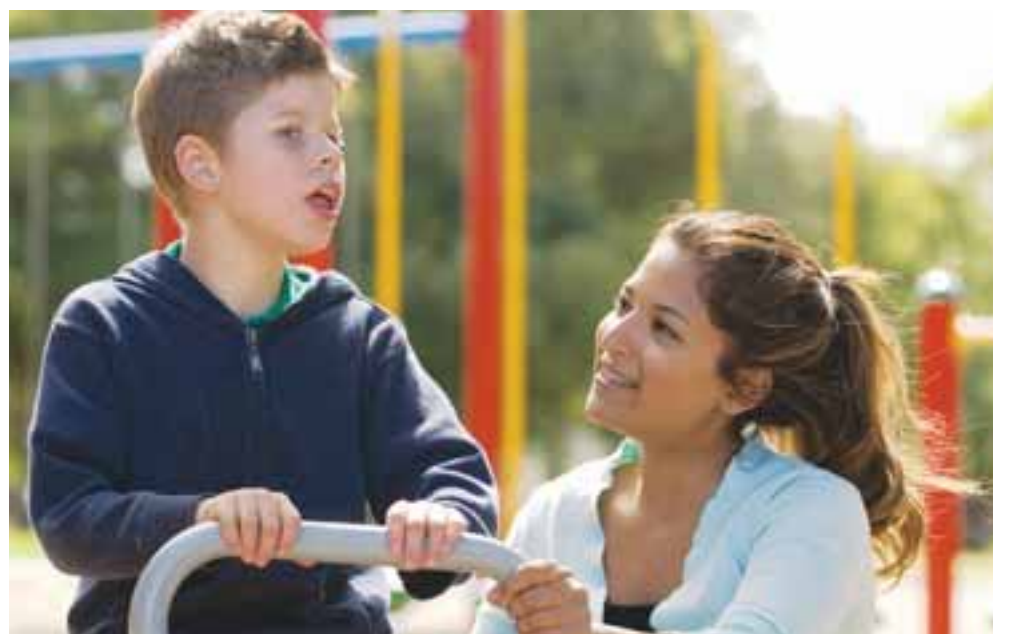
Council's respite care program provides support for 200 families across the municipality.