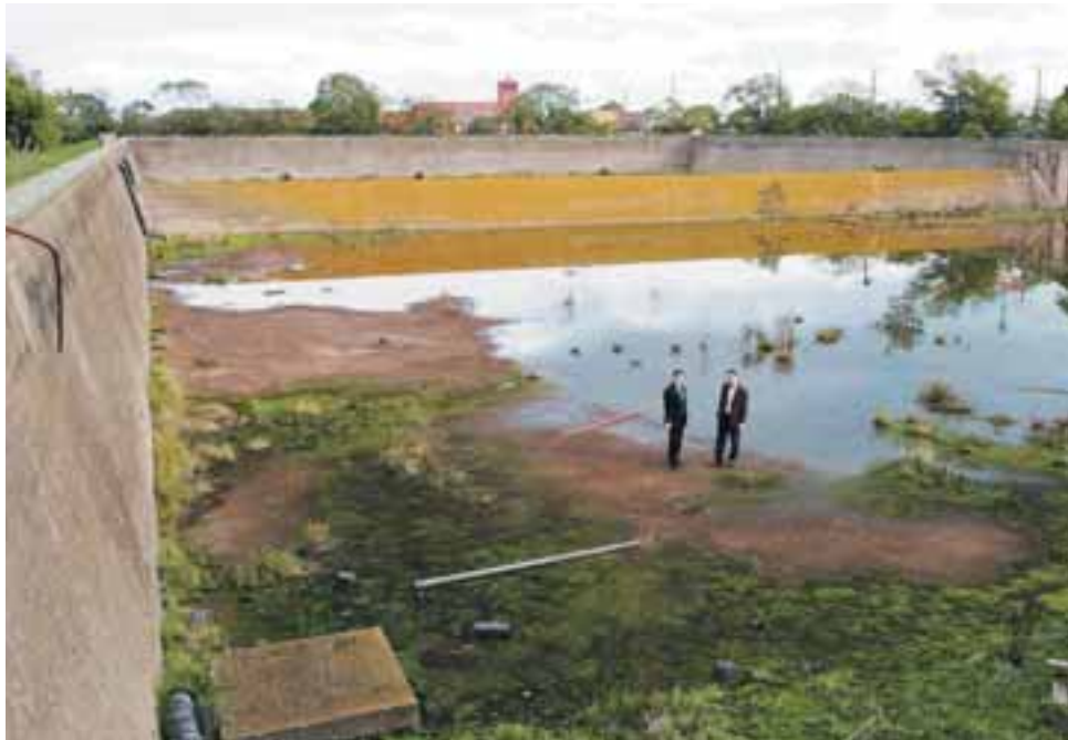
The former reservoir site will be an excellent addition to Council's open space network.