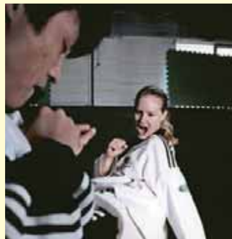
Karate is just one of the many activities young women will participate in as part of the Get Into It program.

Youth Services is taking names of interested young women and spaces are filling up quickly. To register or for further information contact 9579 7963. ■