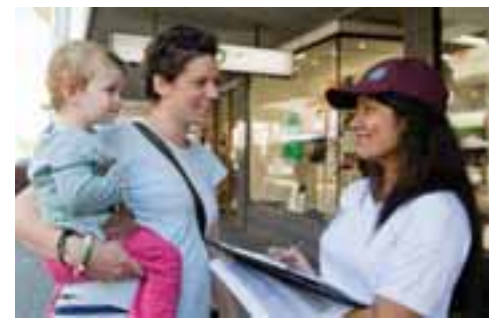
Holmesglen TAFE post-graduate marketing students surveyed local shoppers in Elsternwick about their buying preferences.

To register your interest in participating in Council's BusEd program contact Council's Business Development Unit on 9524 3333 or email businessdevelopment@gleneira.vic.gov.au with a brief description of what you wish to achieve.