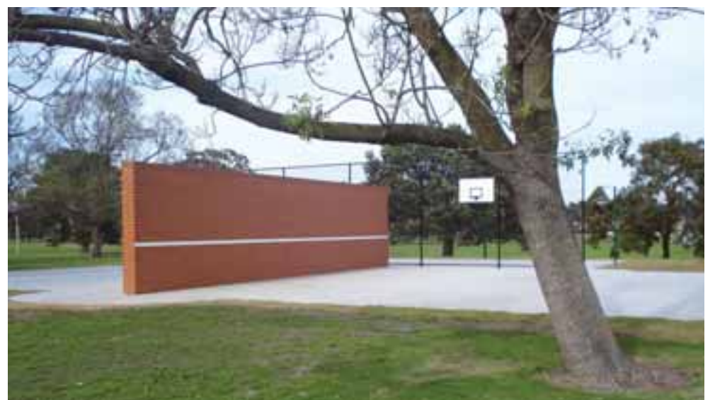
Tennis rebound wall at Caulfield Park.