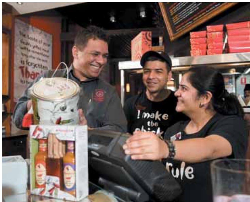
Staff at Nando's in Carnegie are friendly and helpful to all customers.

One such business is Nando's in Carnegie. Staff are friendly and helpful to all customers and the entrance has a sliding door with no steps so it is easy for