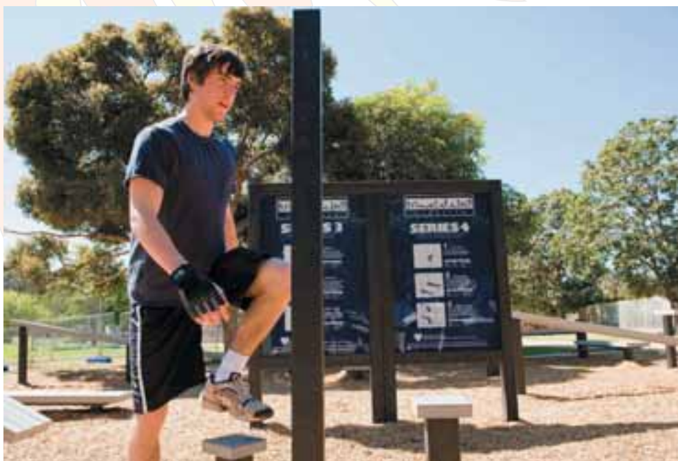
Halley Park, Bentleigh, is just one of seven locations where residents can use fitness pods.