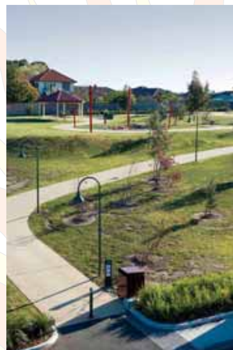
Bentleigh Hodgson Reserve.