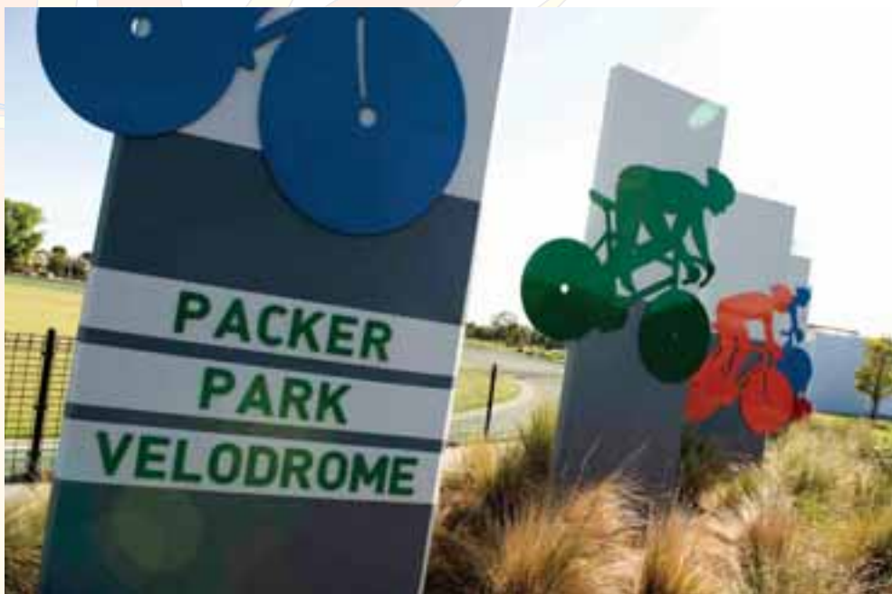
The velodrome at Packer Park, Carnegie, is one of the few velodromes located in the metropolitan area.

For a full list of parks with bike paths, riding trails and things to see on your travels in Glen Eira, go to www.gleneira.vic.gov.au