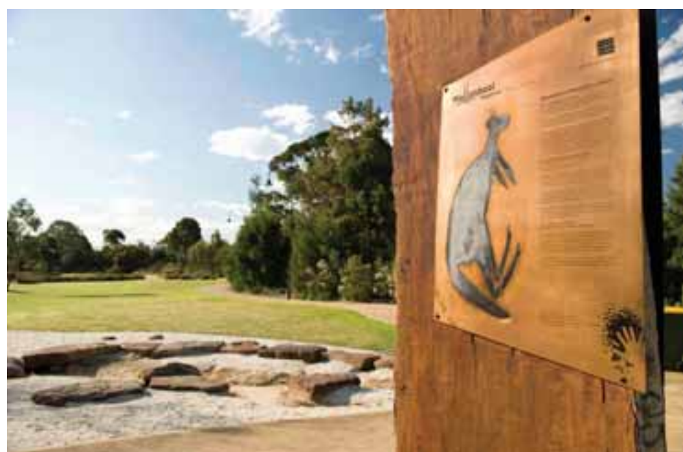
Mallanbool Reserve, Carnegie.