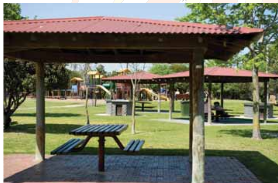
A picnic or a barbecue in the park can be the ideal way to spend a summer afternoon.