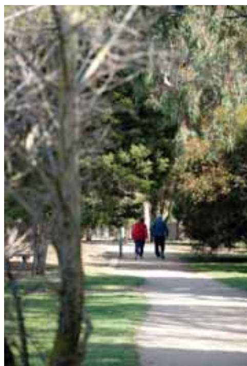
Centenary Park, Bentleigh East.

For further information, visit Council's Service Centre and pick up a Walking in Glen Eira brochure series kit.