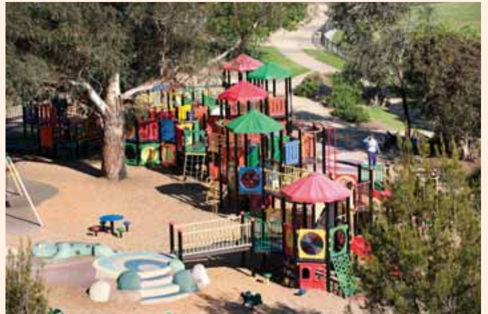
Playground at Packer Park, Carnegie.