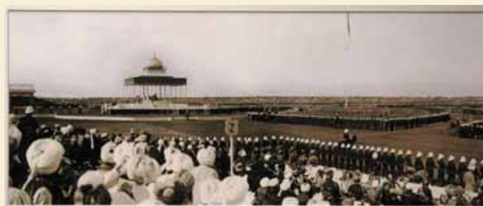
G.W. Lawrie — The Great Coronation Durbar, Delhi. January 1911, gelatin silver panoramic print.

The importance of this period from the middle of the 18th century to the early 20th century is highlighted in the exhibition, including the disintegration