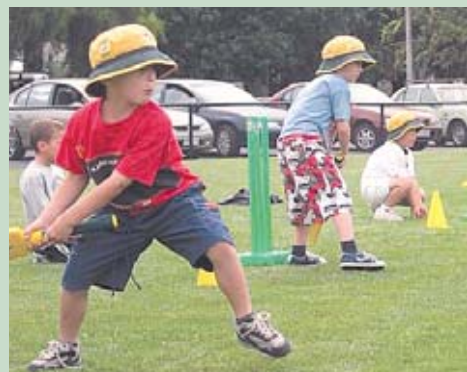
The Milo have a go program is just one of the many junior development programs held in Glen Eira.