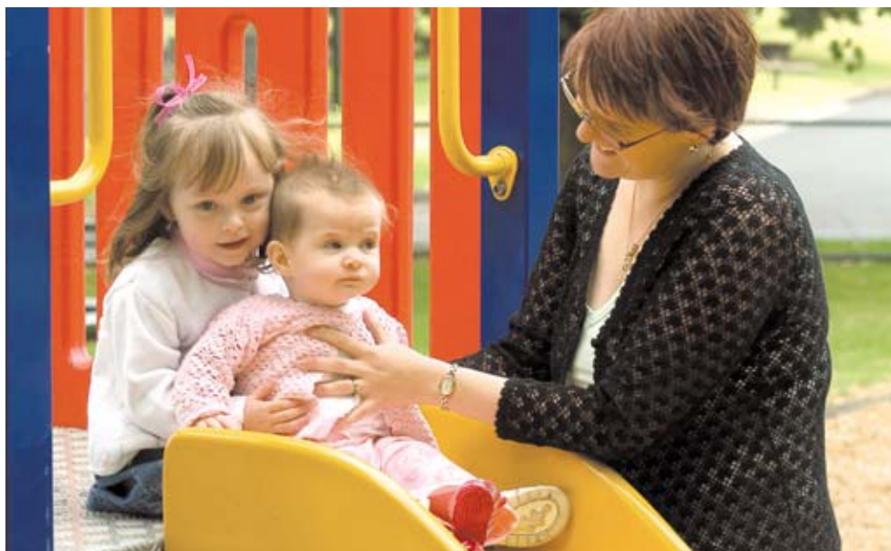
Playtime for children in Glen Eira has never been so much fun.