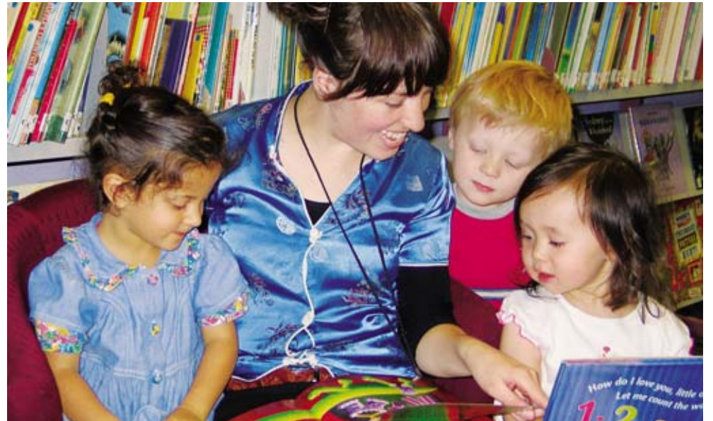
Storytime provides parents with a wonderful opportunity to introduce children to the joys of reading and choosing books.