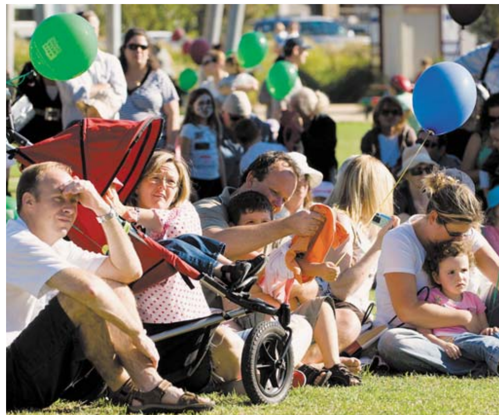
Party in the Park will celebrate Glen Eira's cultural diversity and artistic vibrancy through music and dance.

For further information contact Council's Service Centre on 9524 3333.