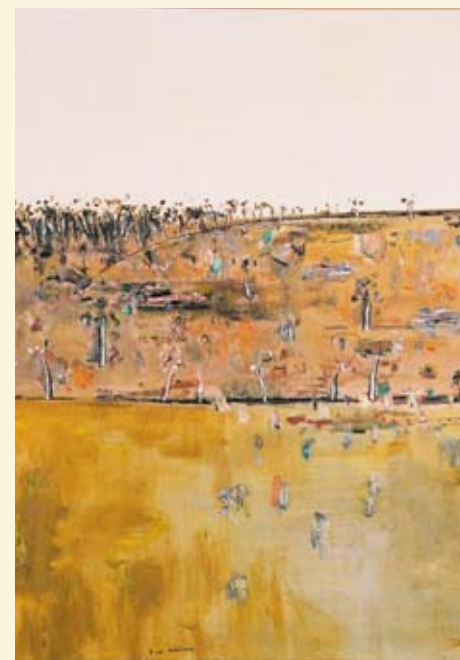
Fred Williams, Lysterfield Landscape , 1973, oil on canvas.

Galil — Golan will be officially opened on Thursday 14 February.