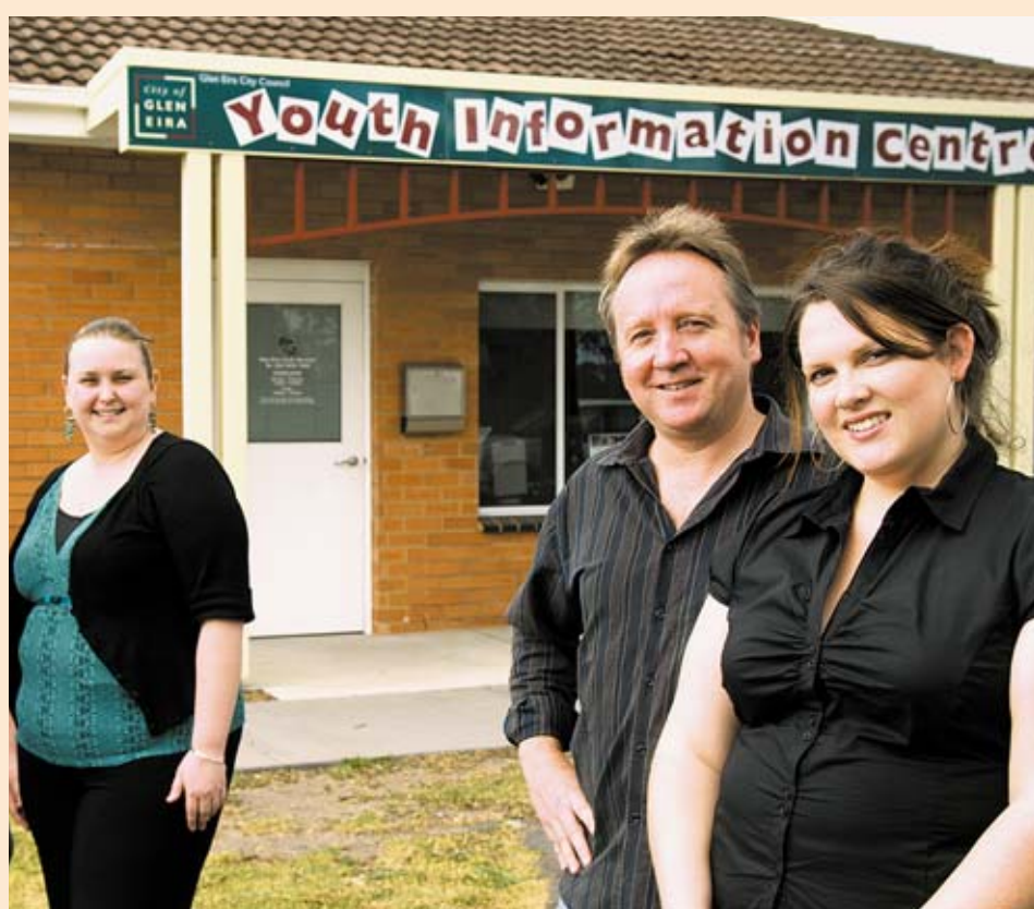
Come and speak to one of Glen Eira’s youth workers about setting goals in 2008.

The Centre is open Monday to Thursday from 1pm–6pm and Friday’s 1pm–5pm.