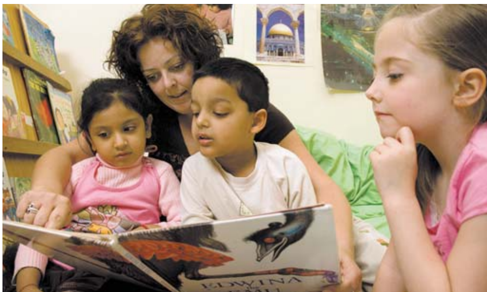
Council operates four centres in Carnegie, Caulfield, Elsternwick and Murrumbeena.

So how can you ensure that your child feels welcome and secure within their new environment?