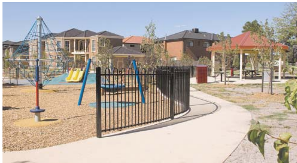
The redevelopment of the Annie and Arthur Abrahams Reserve is part of Council's commitment to upgrading the City's parks.

Glen Eira City Council would like to thank residents for their patience during the reconstruction process and encourages everyone to take the time to visit the new park (Melway Reference 69 B10). ■