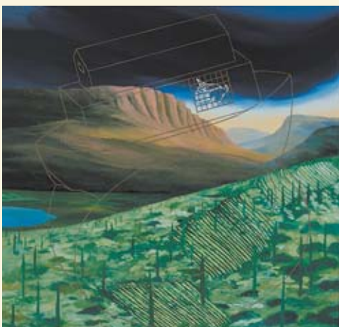
Victor Majzner, Trapped , 2007, acrylic on canvas.

The first component of Majzner's Israel project, completed between 1997 and 1999, dealt specifically with the Negev in southern Israel. Whereas the Negev is a desert, full of Biblical portent yet sparsely populated, Galilee and the Golan Heights by contrast are the fertile bread basket of Israel.