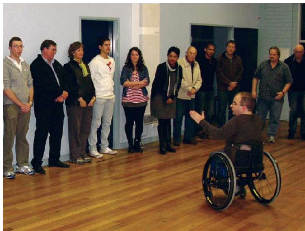
Coaches from 10 local sporting clubs attended the workshop.

So why not take the opportunity to walk along one of Council's many and varied pathways this August and maintain a healthy and active lifestyle.