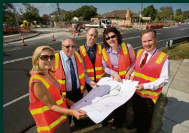
$961,000 will be spent on intersection safety and traffic signals.

Photo: David Grant — John Brown Photography Services.