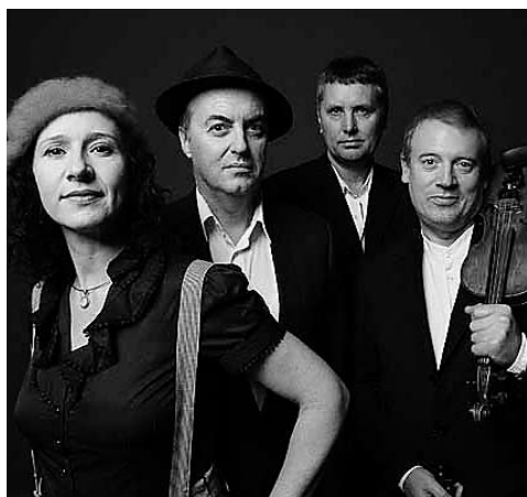
The Great Chefs of Europe.

Klezmania is regarded as Australia's leading klezmer band and performs dynamic instrumentals and songs in Yiddish and English. With energy and passion, Klezmania play everything from romantic ballads and whirling frenetic traditional dance tunes to foot tapping jazzy songs from the diverse cultures of old world of Rumania, the Balkans, Turkey and the Ukraine to the USA and Australia with their own spirited original music.