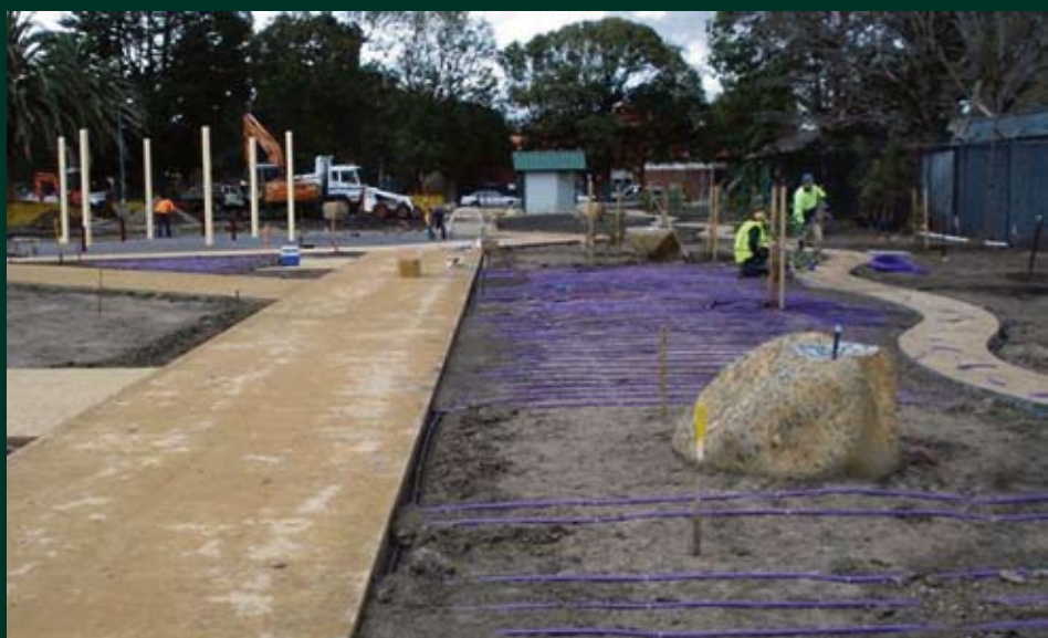
Drip irrigation and bird baths being installed prior to planting bird attracting plants at the new aviary garden.