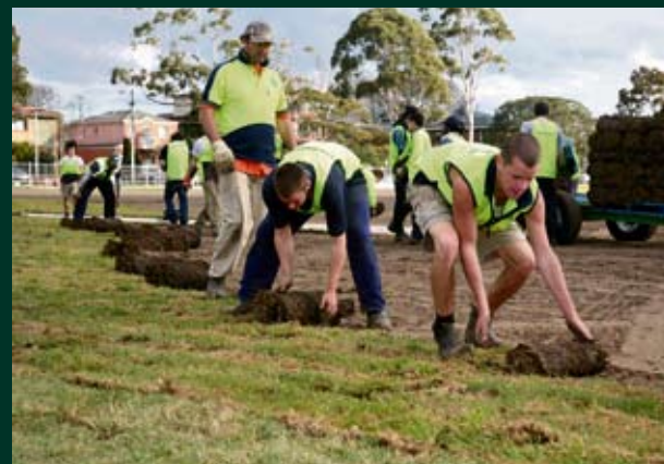
$1.78 million will be spent on planting drought-tolerant grass on sportsgrounds.

Funding has also been allocated for the City's drains ($3 million), shopping centre upgrades ($500,000) and library books and materials ($689,000).