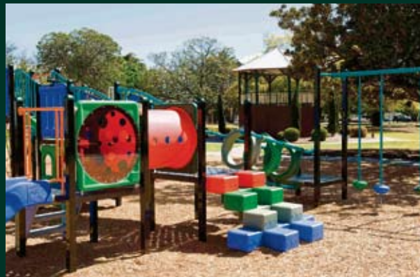
$80,000 will be spent on minor playground upgrades.