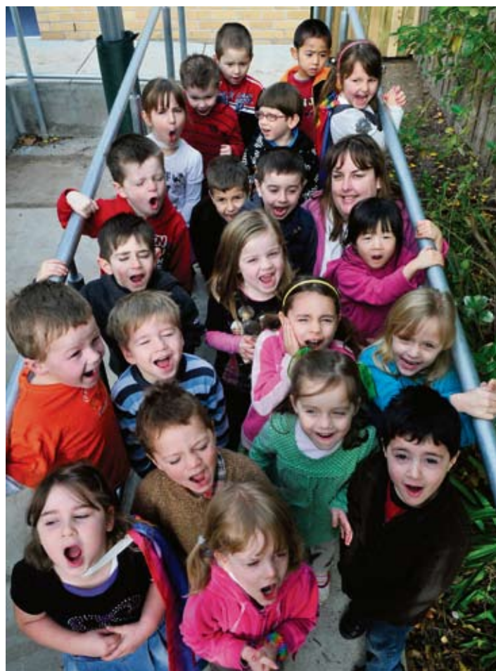
Children from the Centre Road Kindergarten Seahorses Group check out the new concrete ramp.