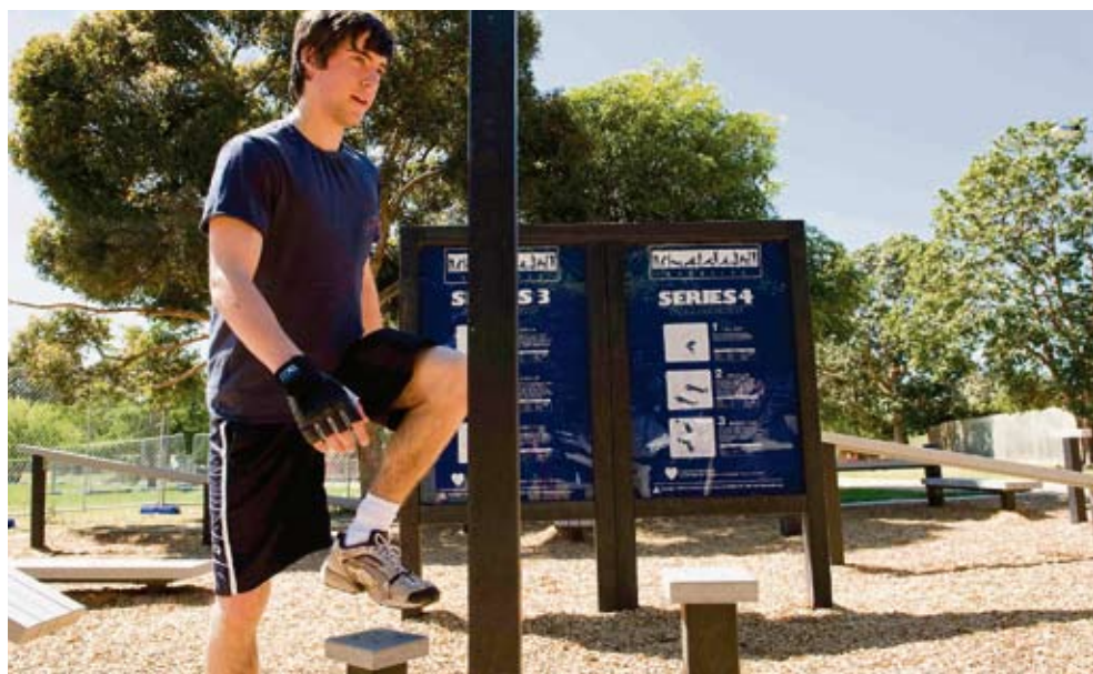
Halley Park in Bentleigh is just one of eight locations where residents can use fitness pods.

The Caulfield Lacrosse Club is always looking for male and female players for both their junior and senior divisions. To register your interest or for further information about the Caulfield Lacrosse Club, visit www.caulfieldlacrosse.com.au