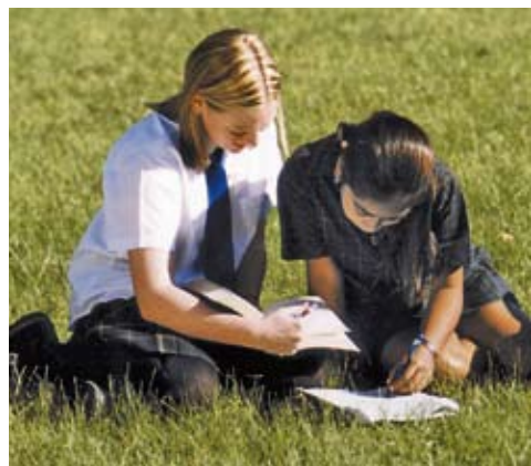
The transition from primary to secondary school is a significant milestone.

The transition from Grade Six into high school is a significant milestone in the