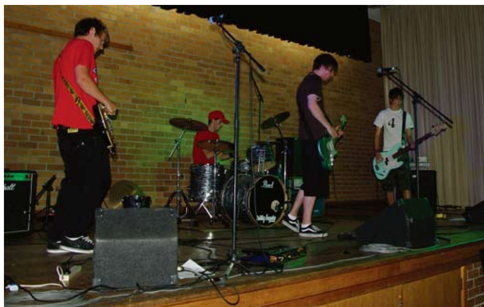
Admit One performing at Battle of the Bands 2008.

For further information on how to submit your demo CD, contact Youth Services on 9579 7963.