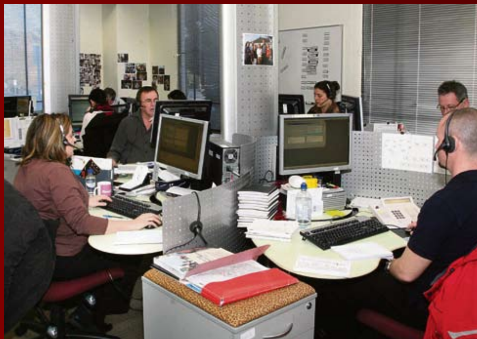
Council's Service Centre: With so many services to provide, it is not surprising that there are a large number of career opportunities at Council.

With so many services to provide, it is not surprising that there are a large number of career opportunities on offer within Local Government, including Glen Eira City Council's