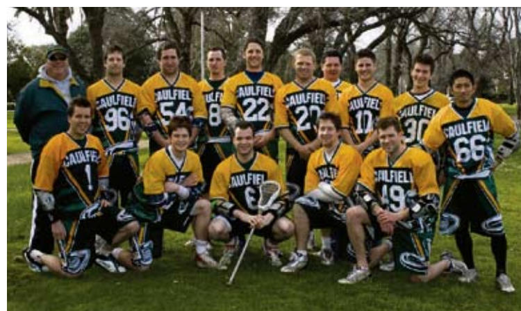
Caulfield Lacrosse Club: State League Men's team.

To this day, the Club is still based in the picturesque Caulfield Park and continues to launch many young sporting careers, while fostering senior ones.