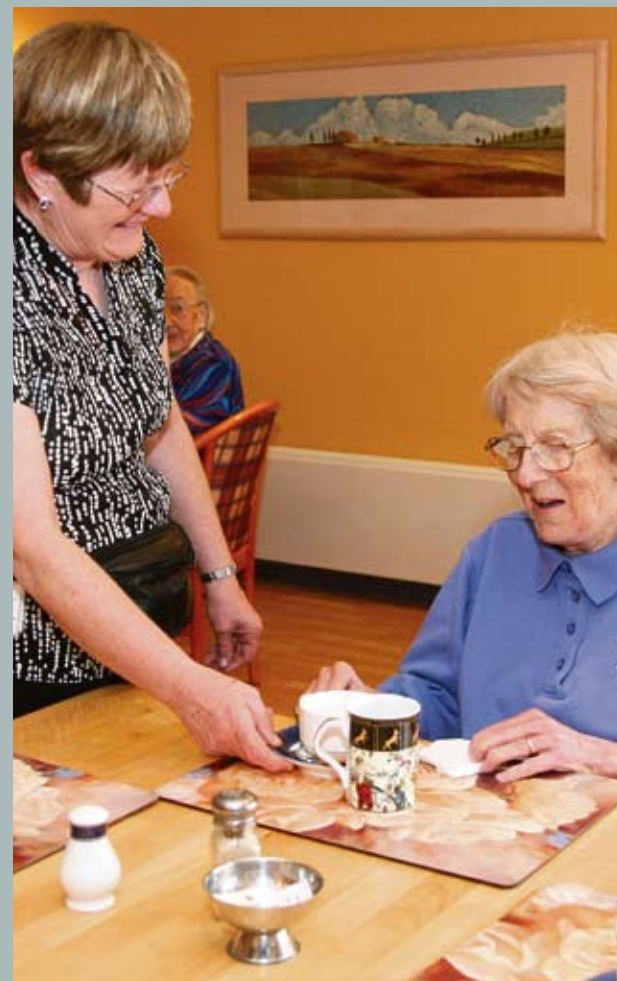
Council is always looking for committed staff with a passion for providing the best possible care and support for our residents.

If you would like to join Council's aged care service, visit www.gleneira.vic.gov.au and follow the links to current vacancies in the careers section.