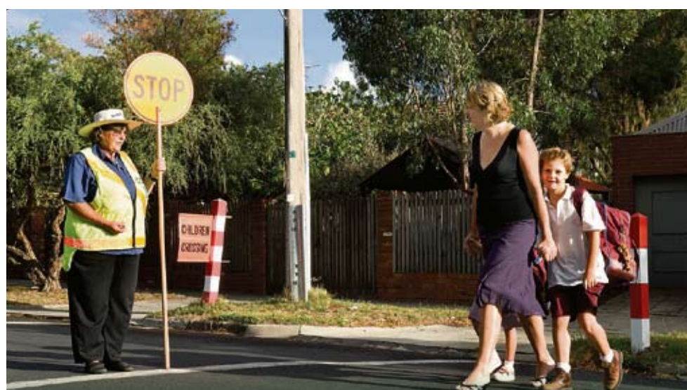
School crossing supervisors provide a vital service to Glen Eira's community.