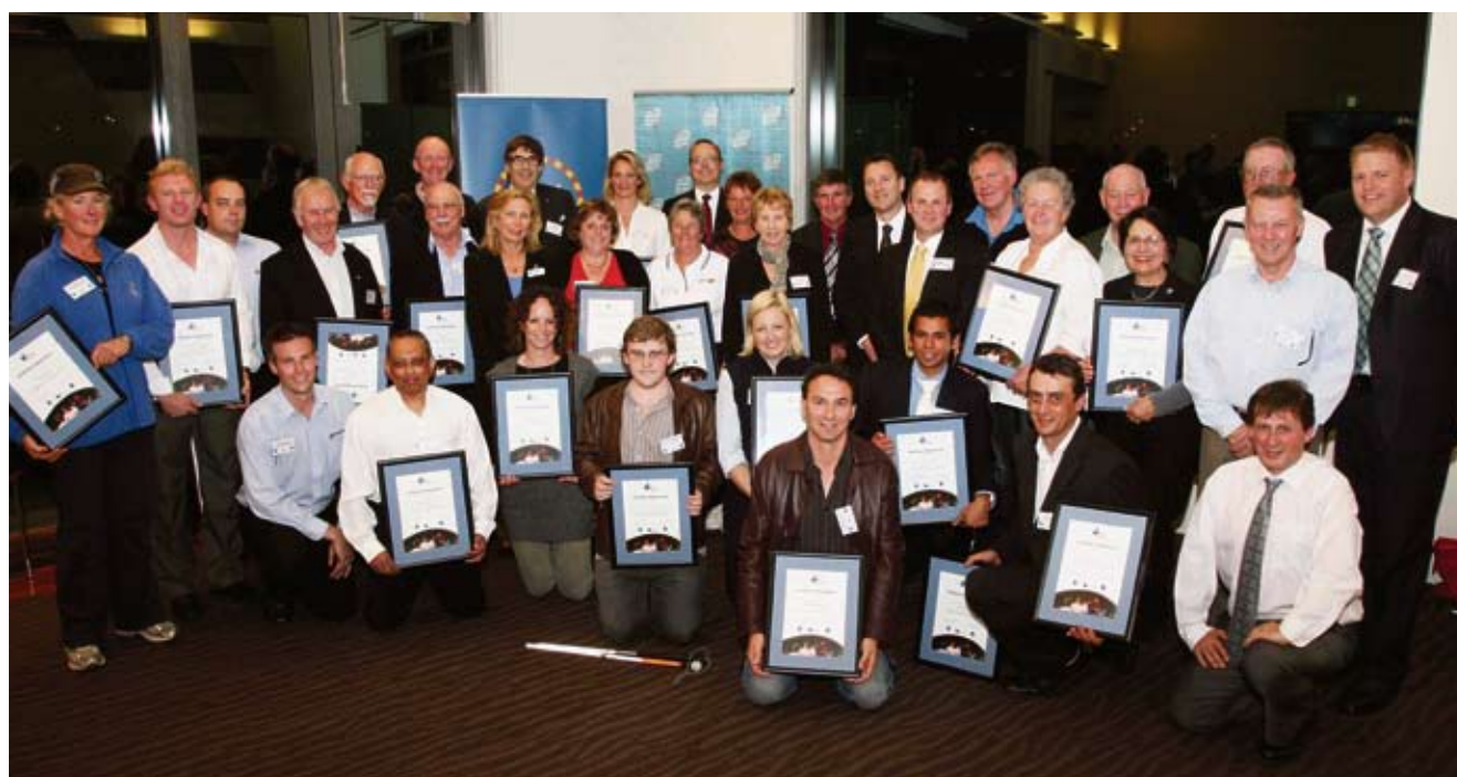
Certificates of Appreciation were presented to local sports clubs, sporting associations and community organisations.

Since its inception, Access Unlimited has aimed