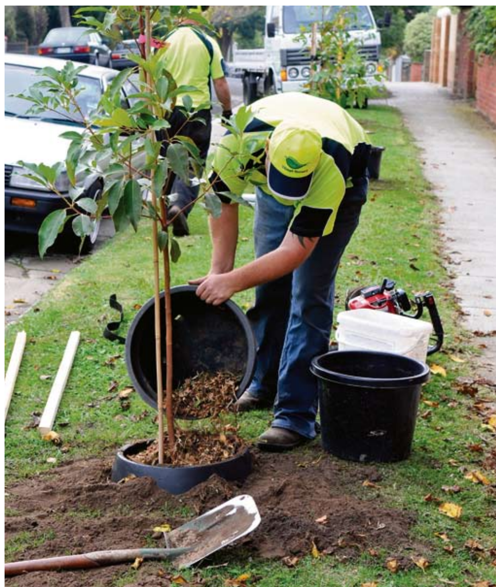
Placing mulch around trees and plants helps keep the roots cool and moist.

For further information, contact Council's Service Centre on 9524 3333.