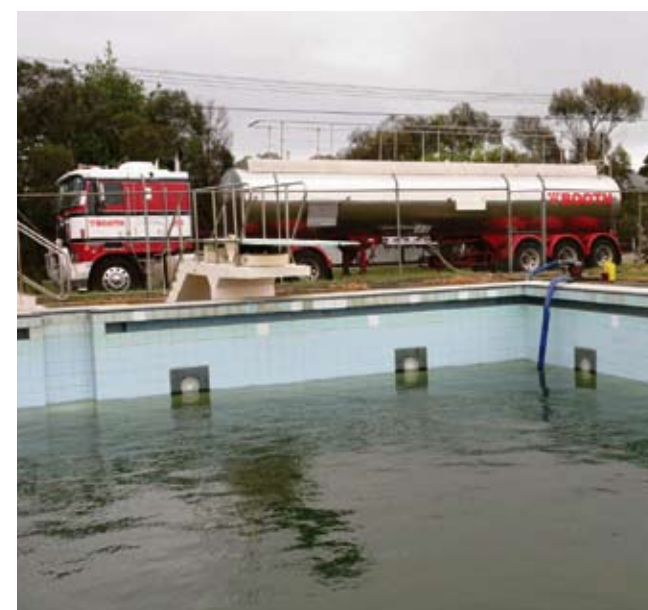
Recycled water was used to refill the dive pool.

For further information, contact Carnegie Swim Centre on 9571 8143.