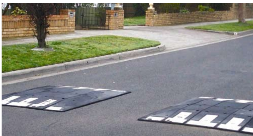
Recycled rubber has been used for speed cushions.