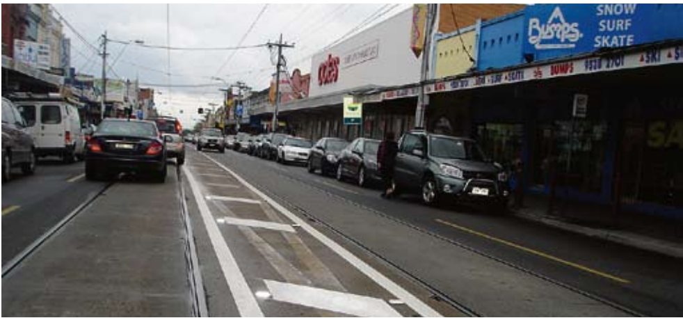
To improve pedestrian safety, a painted median has been installed.