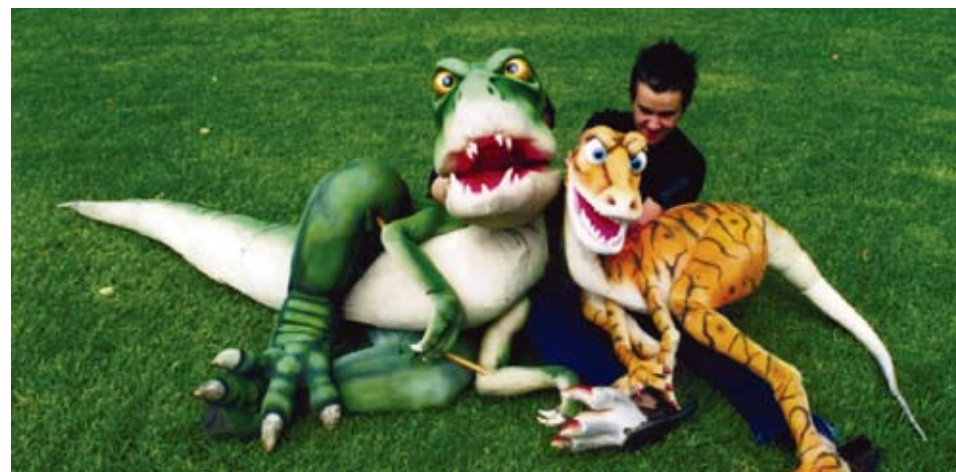
Tooth and Claw.

For further information, contact Glen Eira City Council on 9524 3333 or visit: www.gleneira.vic.gov.au