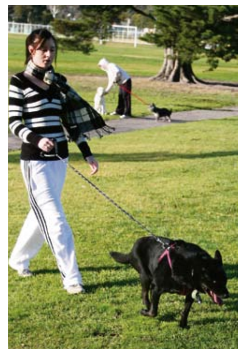
Walk your dog early in the morning.

Residents should also be aware that maintenance of the pool or spa safety barriers is just as important as adhering to regulations for installation in the first place.