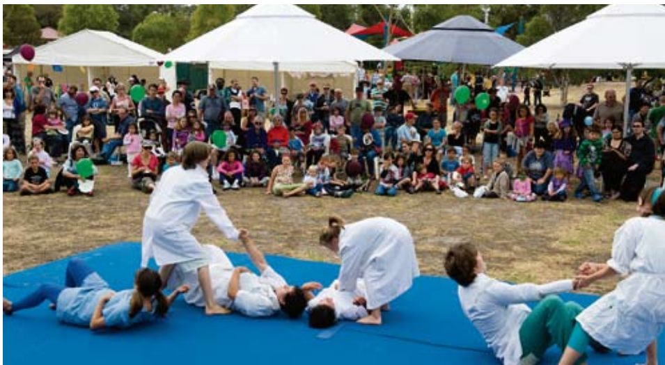
2009 Party in the Park at Allnutt Park, McKinnon.