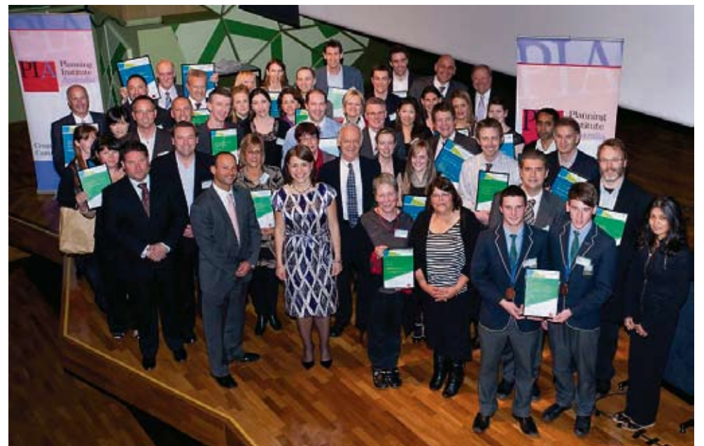
Winners of the 2009 Planning Institute of Australia Awards for Planning Excellence.

The Award's judges commended Council for its innovation and were impressed by the simplicity, ease of application and benefits for both councils and applicants alike.