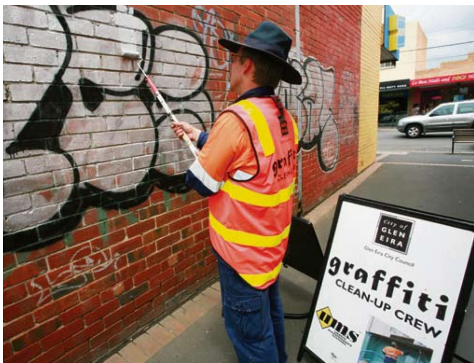
As part of the Council funded Graffiti Clean-Up Program, more than 3,068 square metres of graffiti have been removed.

To complement Council's program to tackle graffiti, Council has partnered with the Department of Justice (DOJ) to implement the State Government's