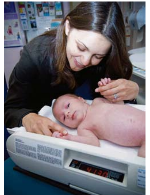
Council's Maternal and Child Health Service completed 15,872 key ages and stages assessments during 2008–09.

For further information, or to make an appointment, contact Council's Maternal Child and Health Service on 9524 3333.