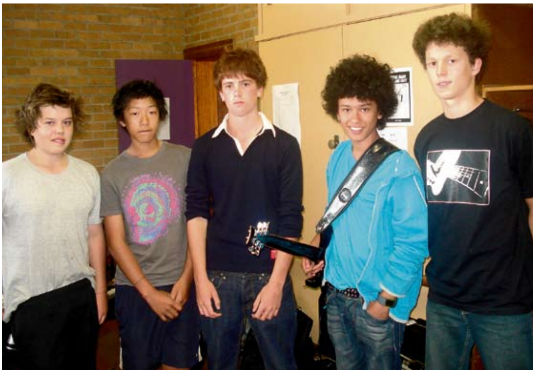
2009 Battle of the Bands runner-up Urban Zoo.