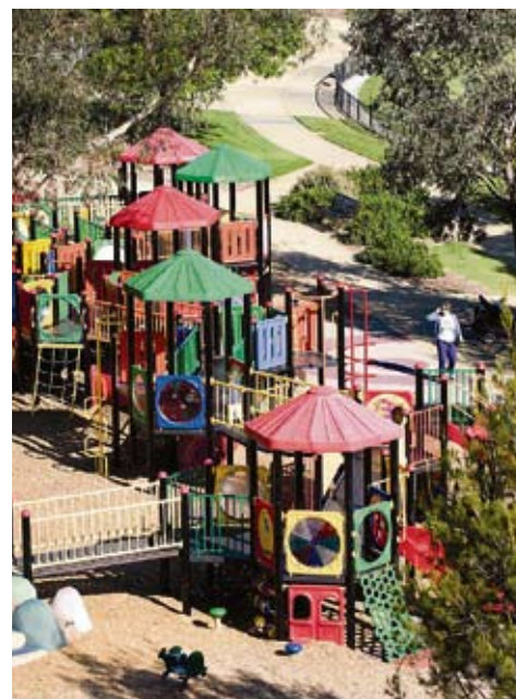
Packer Park, Carnegie.