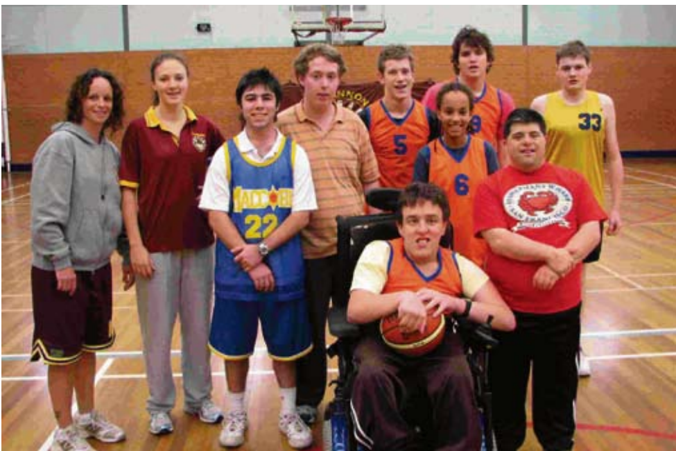
People with a disability participated in the six week McKinnon Super Star Cougars Program in late 2009.

Both courts are available free to the public. Bookings aren't required.