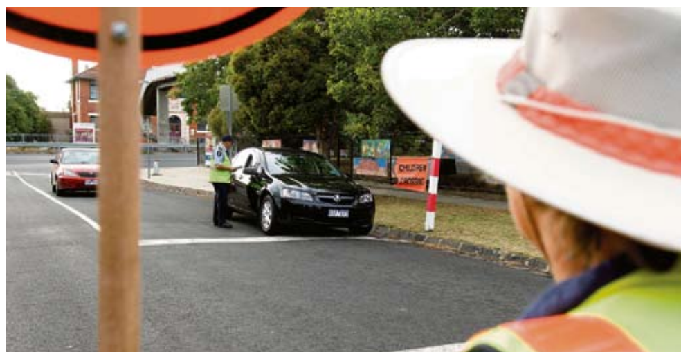
Motorists are reminded to comply with speed limits and parking and stopping laws in the vicinity of schools or risk facing a hefty fine.