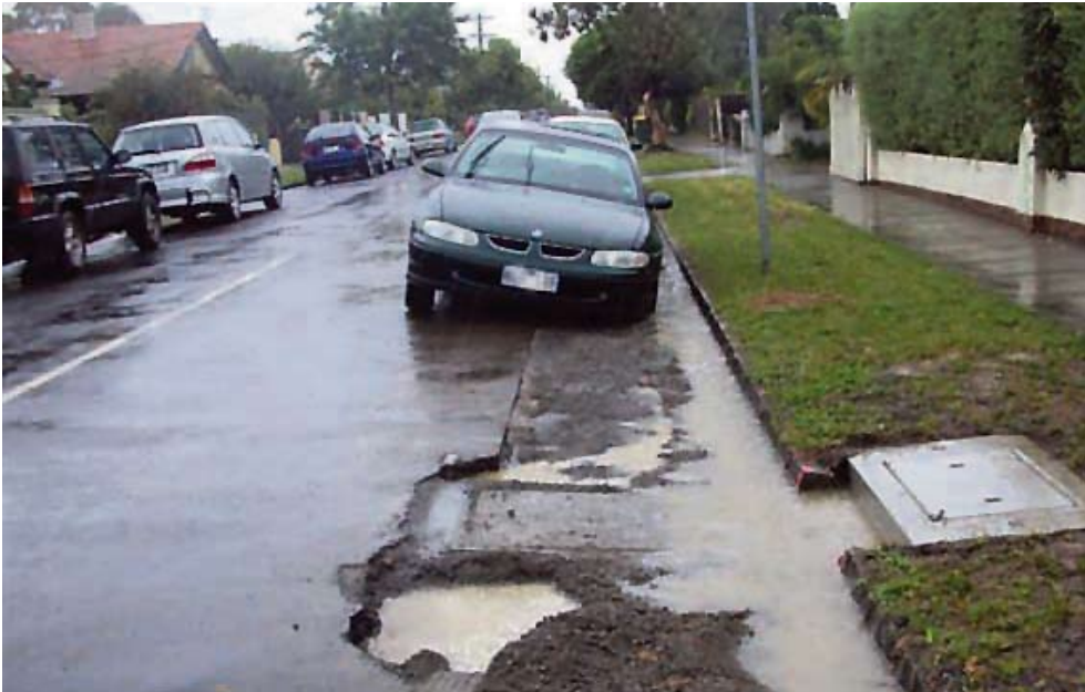
This green Commodore was buried up to its axles in mud.

To ensure public assets and infrastructure are not damaged as a result of building works being carried out — including demolition work —