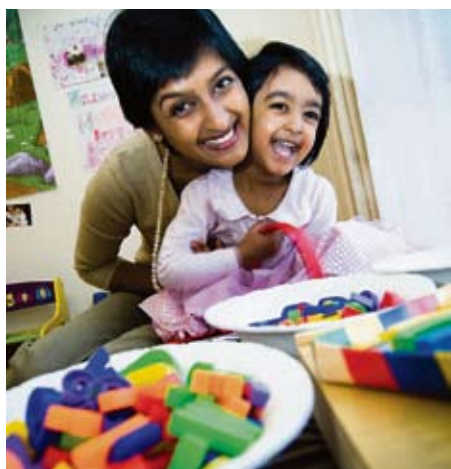
A session about playing at home with your children will be held in 2010.

Council's 2010 Education Calendar is expected to be available in February.