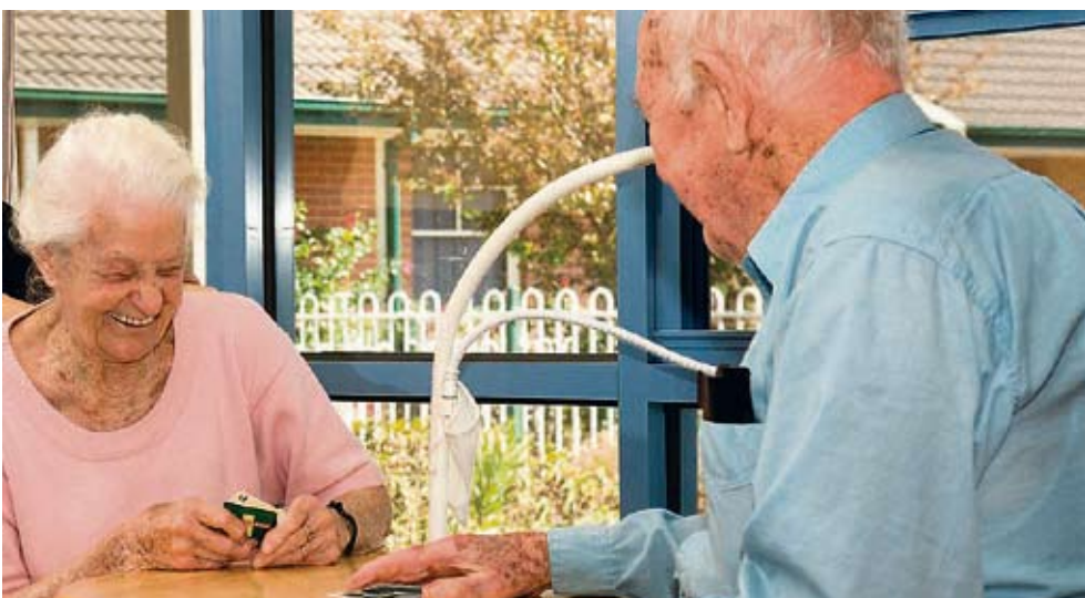
The people usually most affected by a heatwave are the elderly and people living alone, particularly if they are isolated or lack social support.