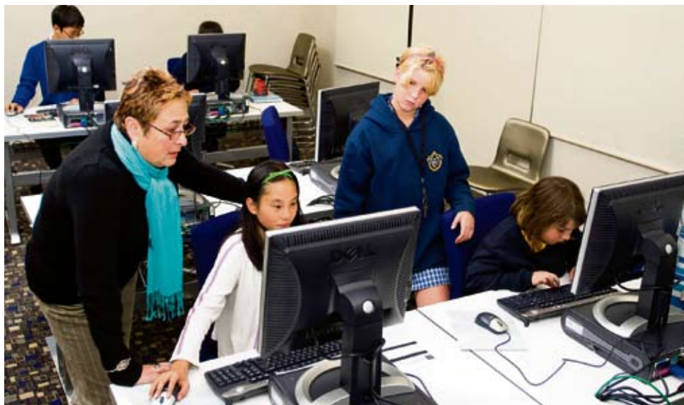
The Homework Centre @ Carnegie Library will be open two days a week in 2010.

A librarian is on hand to help students understand and use information that will assist with homework tasks.