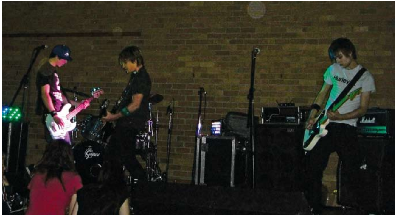
2009 Battle of the Bands winner Admit One.

For further information on how to become involved in youth events in Glen Eira, contact Youth Services on 9576 5872.