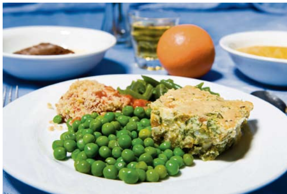
The service offers a wide range of meal choices which cater for all dietary requirements.

Meals can be provided hot for immediate consumption or chilled for refrigeration and later consumption.