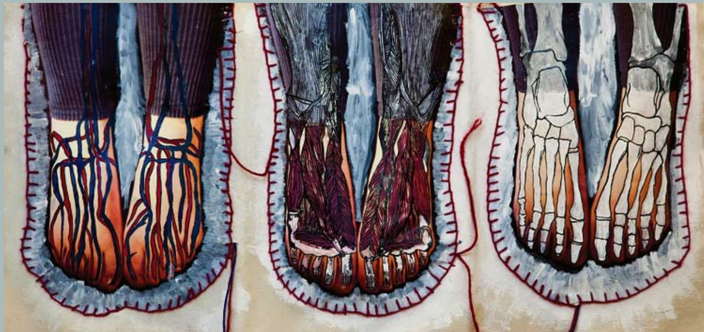
Pia Spreadborough — Untitled. Digital photograph printed on paper, wool, ink and acrylic paint on canvas, 930mm x 470mm.

year study. Contemporary digital media, installations, sculpture, photography, painting, textiles and ceramics will be included.