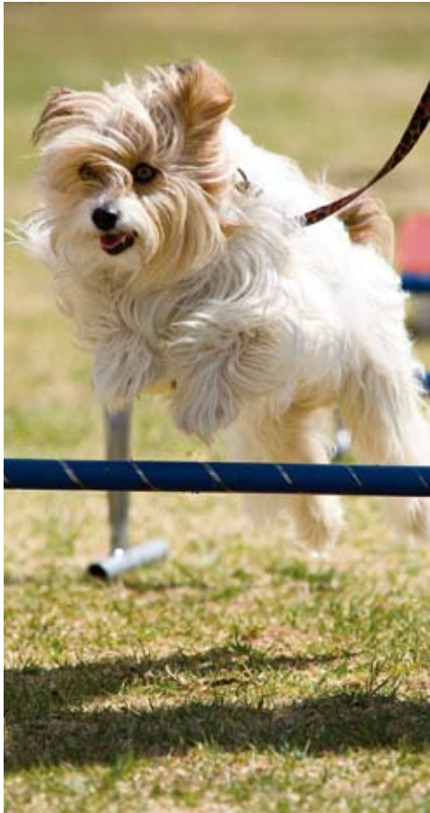
A dog park is just one of the many initiatives proposed in Council's draft 2010–2011 Annual Budget.