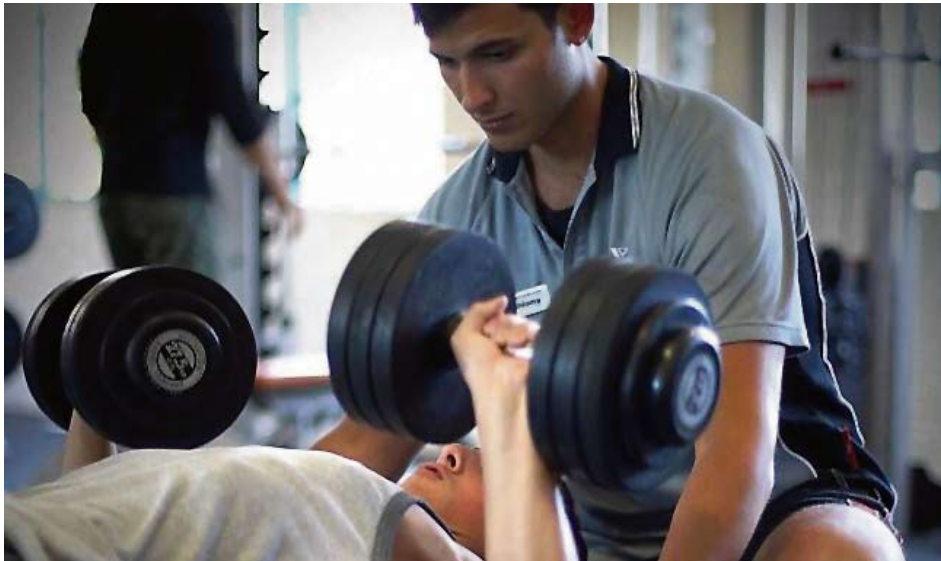
Caulfield Recreation Centre offers something for everyone.

With the temperature dipping, it seems like an ideal time to stay indoors, curl up on the couch and wait for summer.