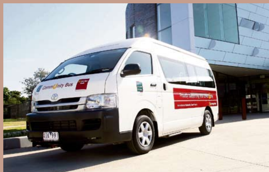
The community bus fleet is available to local community groups, clubs and organisations.

Glen Eira City Council's community bus fleet is available to local community groups, clubs and organisations to transport their members to a range of activities and venues.