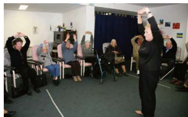
Social support program.