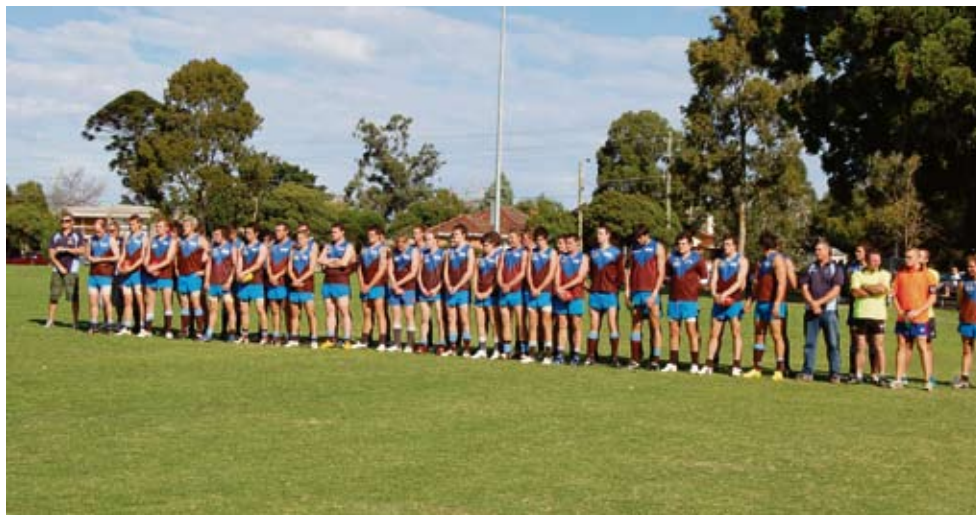
Players pay their respects before the start of the game.

The toss of the coin was performed by Ormond Amateur Football Clubs' number one ticket holder, AFL legend and triple Brownlow Medallist Bob