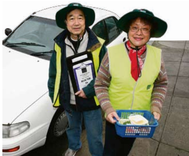
Delivered meals.

Information is also available from Council's Service Centre on 9524 3333 and Council's website: www.gleneira.vic.gov.au