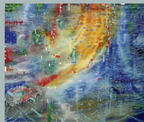
Jon Cattapan — Van Landscape, 2006, oil on linen 190 x 220cm. Image: Courtesy of the artist and Sutton Gallery, Melbourne — Michael Buxton Collection.

Vision will be opened by Centre for Contemporary Photography Director Naomi Cass on Wednesday 9 June at 6.30pm with a welcome by Glen Eira Mayor Cr Steven Tang.