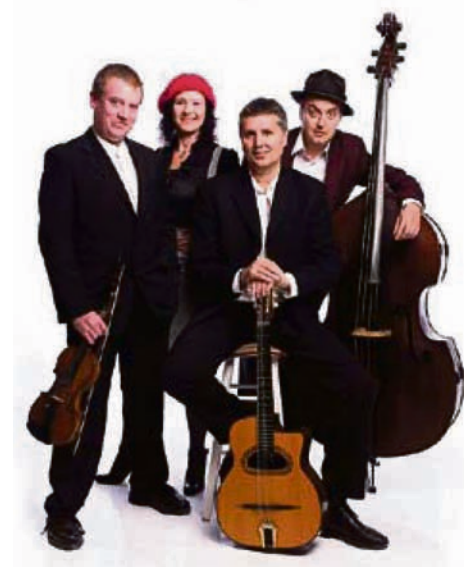
Great Chefs of Europe.

Glen Eira City Council's Winter Music Series is better than ever in 2010 with eight fantastic acts.