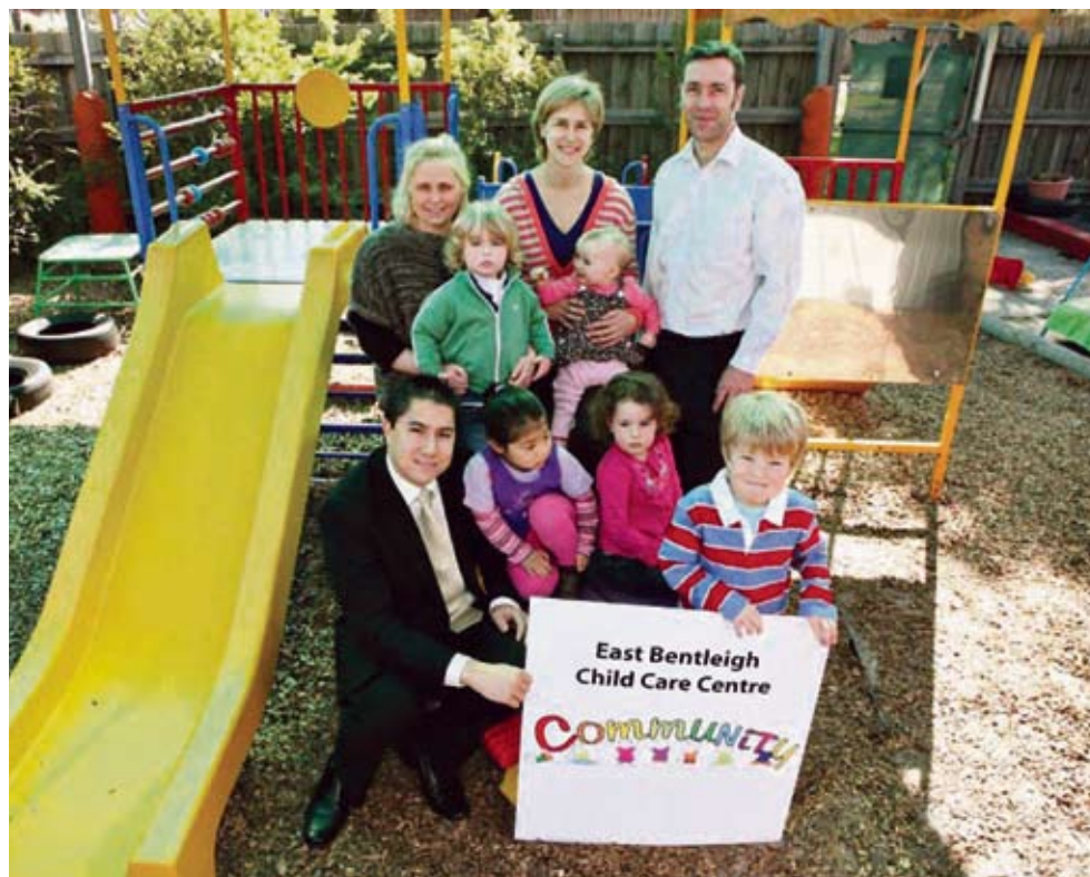
Bentleigh East Childcare Centre received $100,000 to landscape their outdoor play space.

Glen Eira City Council's campaign to have the State Government properly fund early years education is bearing fruit, with eight local childcare centres and kindergartens set to share in more than $628,000.