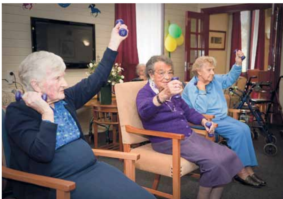
Statistics indicate 24,000 residents in Glen Eira are aged over 60.