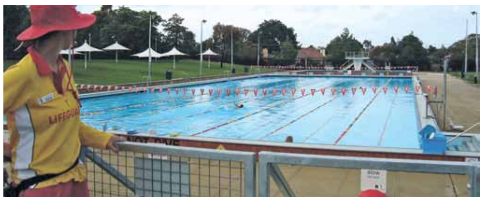
Carnegie Swim Centre will close for the summer season on Thursday 31 March.

Carnegie Swim Centre will close for the summer season on Thursday 31 March. There is still time to have a swim before the pools close for the season, but you better be quick.