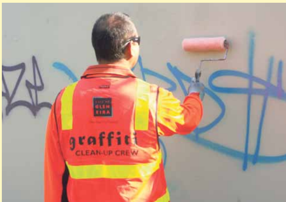
Graffiti represents a huge cost to the community.

Glen Eira residents and traders can obtain personal graffiti removal kits free of charge from Council's Service Centre, corner Glen Eira and Hawthorn Roads, Caulfield.