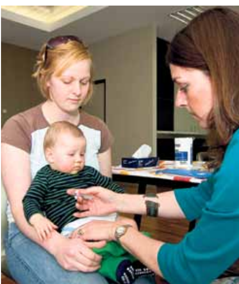
Council encourages all children to be vaccinated on time.

Immunisation protects children and adults from harmful infections.