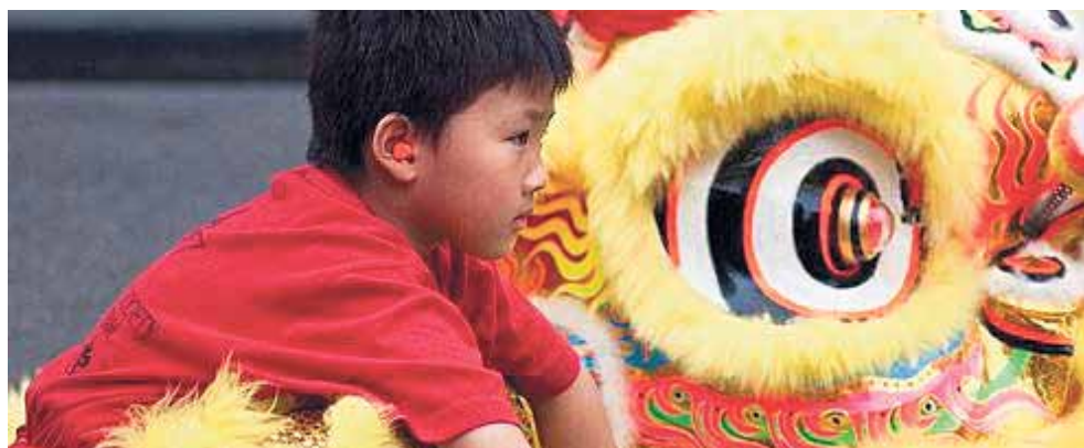
Chinese Masonic Society Lion Dance.