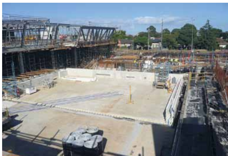
February 2011: On-site at GESAC.