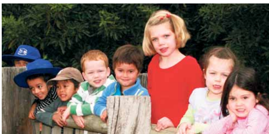
Four-year-old kindergarten enrolments for 2013 open on Monday 2 May.

Please ensure you submit your application early as applications are