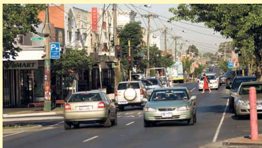
Operations in Centre Road targeted traffic and street offences and anti-social behaviour.

A number of operations on major highways and in the Glenhuntly Road and Centre Road shopping precincts have been conducted by Glen Eira Police.