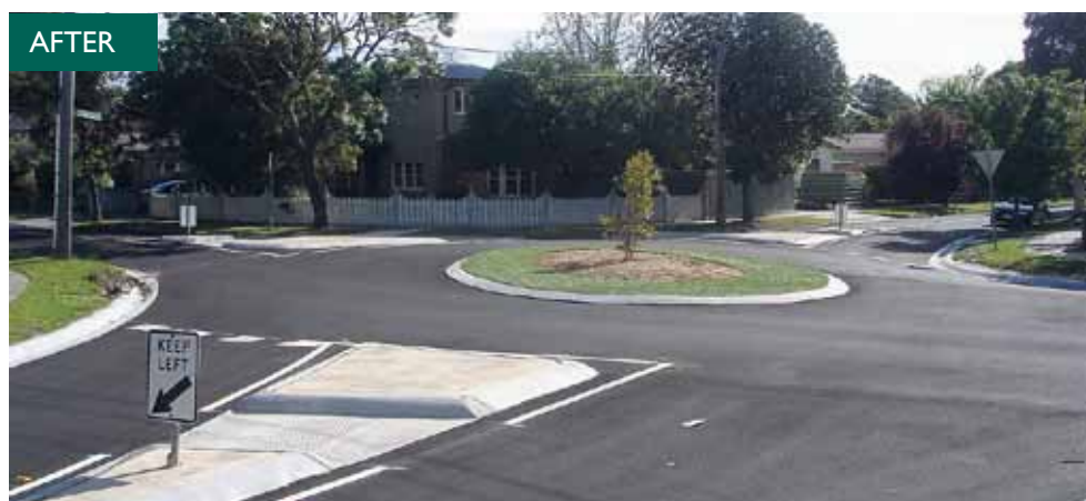
It's important for existing road infrastructure to be reviewed.