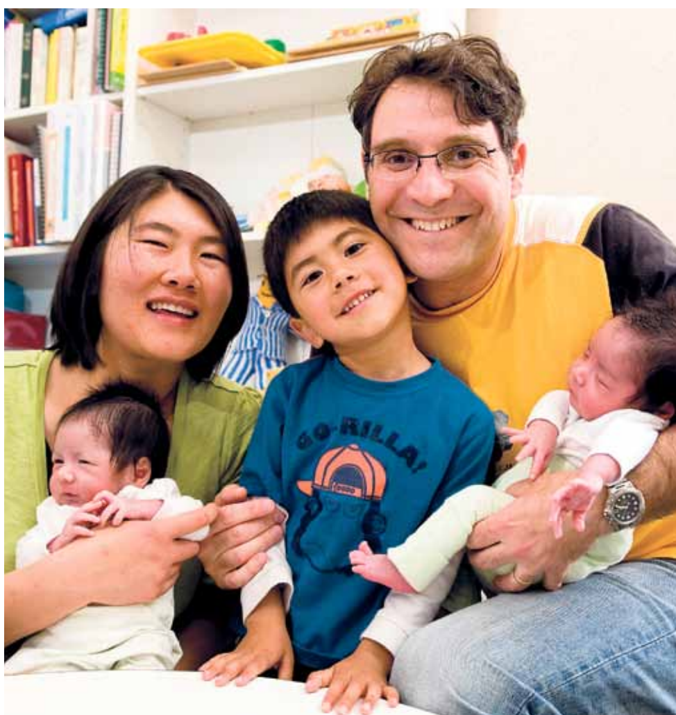
Vaccination protects you from catching and passing on the infection to your baby.

In the first three weeks of 2011, there were 600 notified cases in Victoria. Around one in every 200 babies under six months who catches whooping