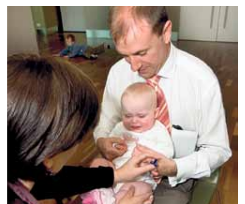
Council conducts 10 free community immunisation sessions each month.

Council's 2011 immunisation schedule is available from Council's Service Centre on 9524 3333 and www.gleneira.vic.gov.au All Council immunisation sessions are advertised monthly in Glen Eira News .