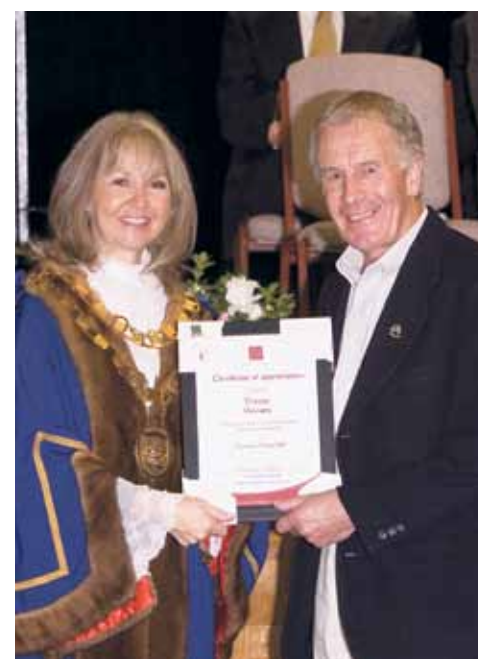
Volunteers are an important part of Glen Eira.

Nominations are now open for Glen Eira City Council's 2011 Volunteer Recognition Scheme.