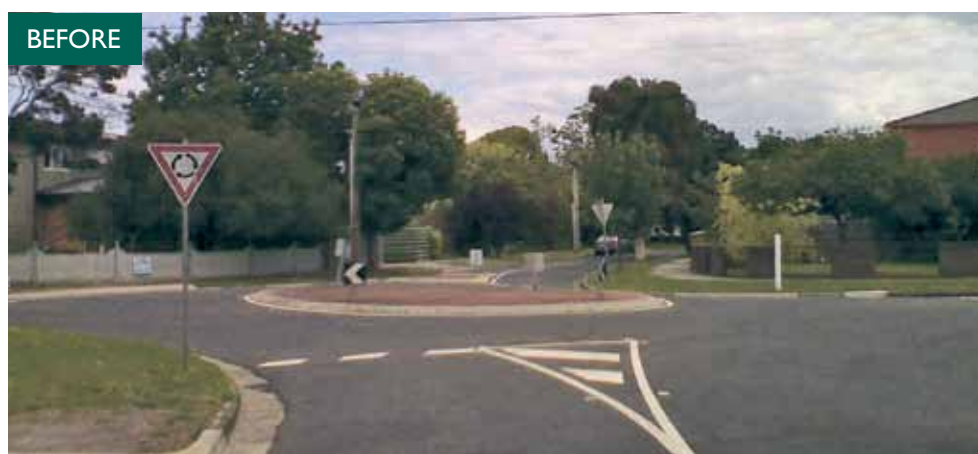
Joy Street, Hemingford Road and Roselyn Crescent, Bentleigh East.

This project involved reconstruction of the existing roundabout to better direct vehicles and control speeds. A new splitter island was also constructed on the eastern approach to improve pedestrian access and safety.