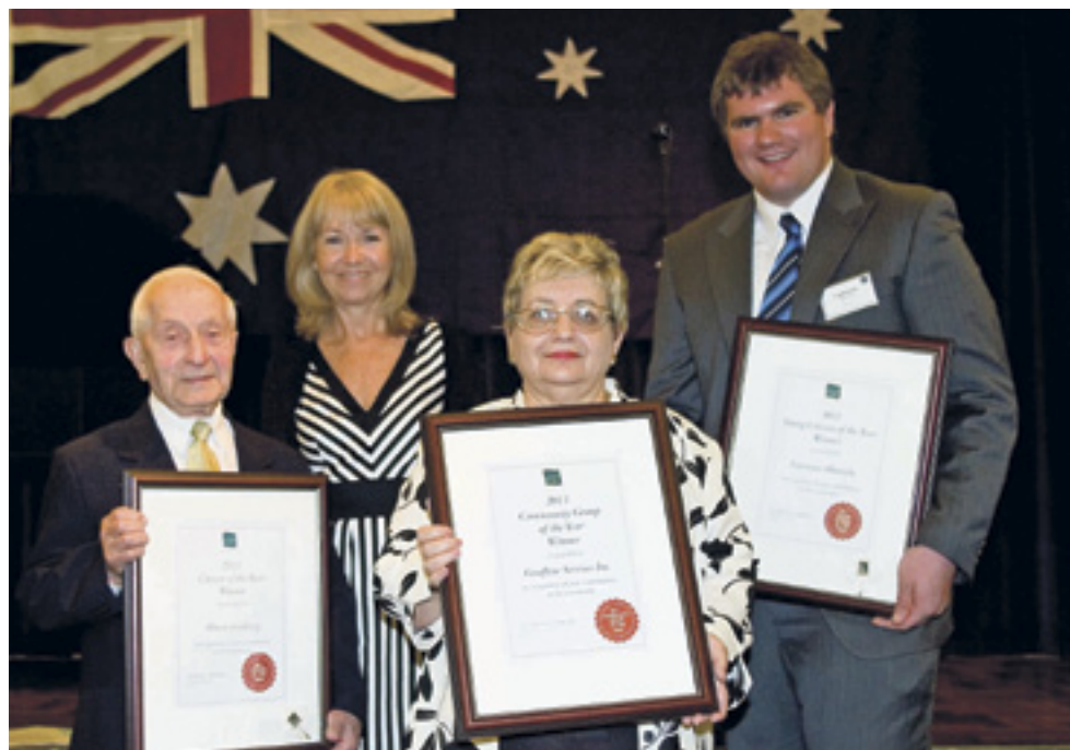
The Awards recognise the contributions of outstanding Glen Eira residents and community groups.

Nominations for Glen Eira City Council's Citizen of the Year , Young Citizen of the Year and Community Group of the Year Awards open on Monday 1 August.