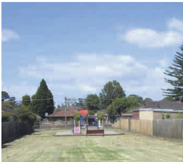
Before redevelopment.

new playground, rotunda, park furniture, all-weather pathways, plinth curbing, as well as a variety of native trees and shrubs.