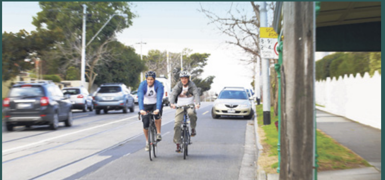
$446,000 will be spent on the implementation of Council's Bicycle Strategy.