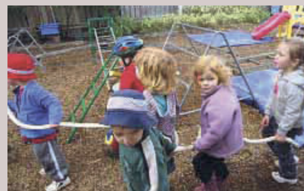
Promoting walking and traffic safety has been incorporated into daily activity at Carnegie Children's Centre.

"Being part of the Kids — Go for your life program has helped us to achieve this."