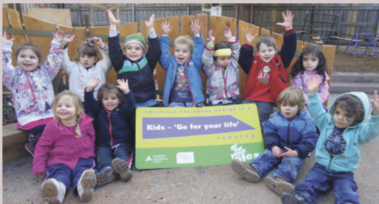
Children at Caulfield Children's Centre proudly display their award sign.

Glen Eira City Council's four children's centres and Family Day Care Scheme have been recognised as Kids — Go for your life award services.