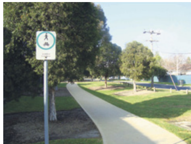
Cyclists should expect to share the space with people of all ages and paces.