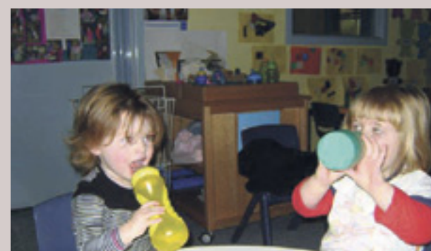
Children are encouraged to have water as their drink of choice by ensuring it is readily available in doors and out.