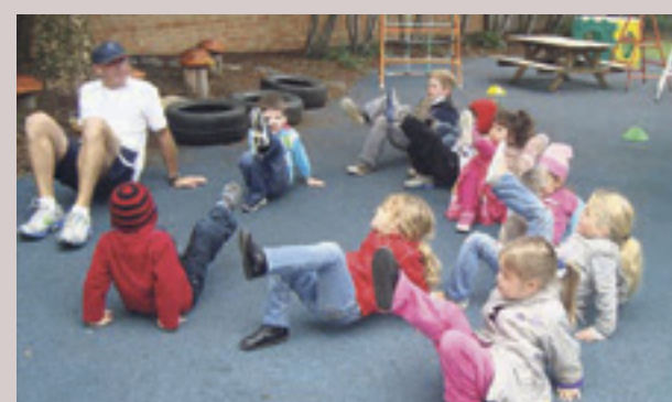
Active play and physical activity has been embedded in the program at Murrumbeena Children's Centre.