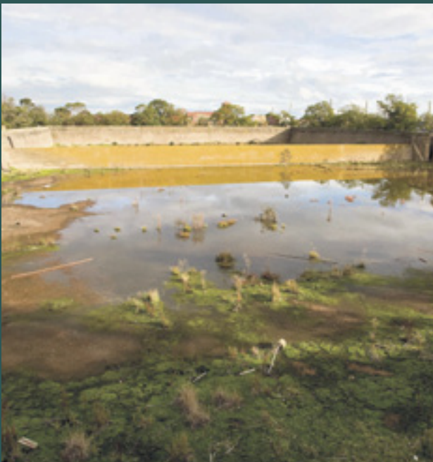
$60,000 will be spent on consultation and master plan development for Booran Road Reservoir.