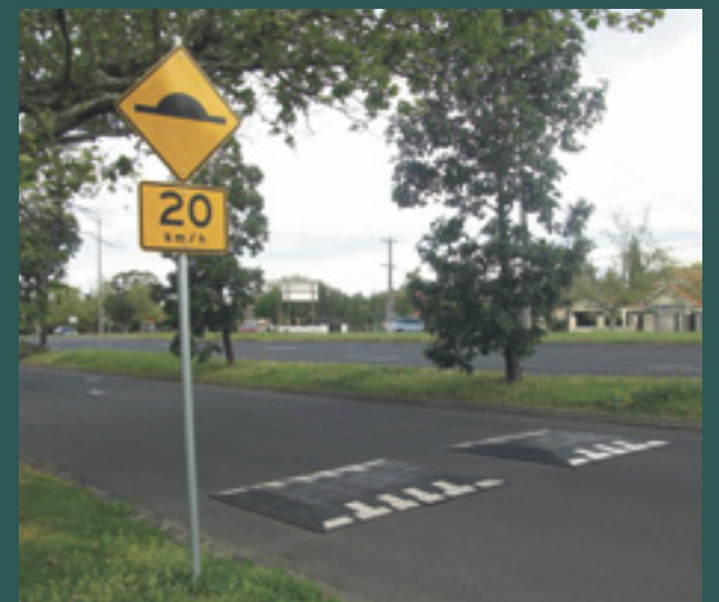
$69,000 will be spent on residential safety, including the installation of speed humps and speed cushions in residential streets.