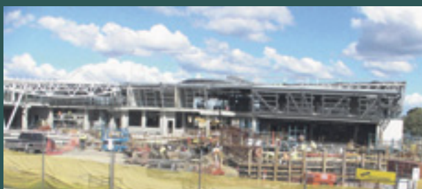
$7.58 million will be spent on construction of Glen Eira Sports and Aquatic Centre.

For the 2011–12 year, $14.7 million will be spent on building projects, including: