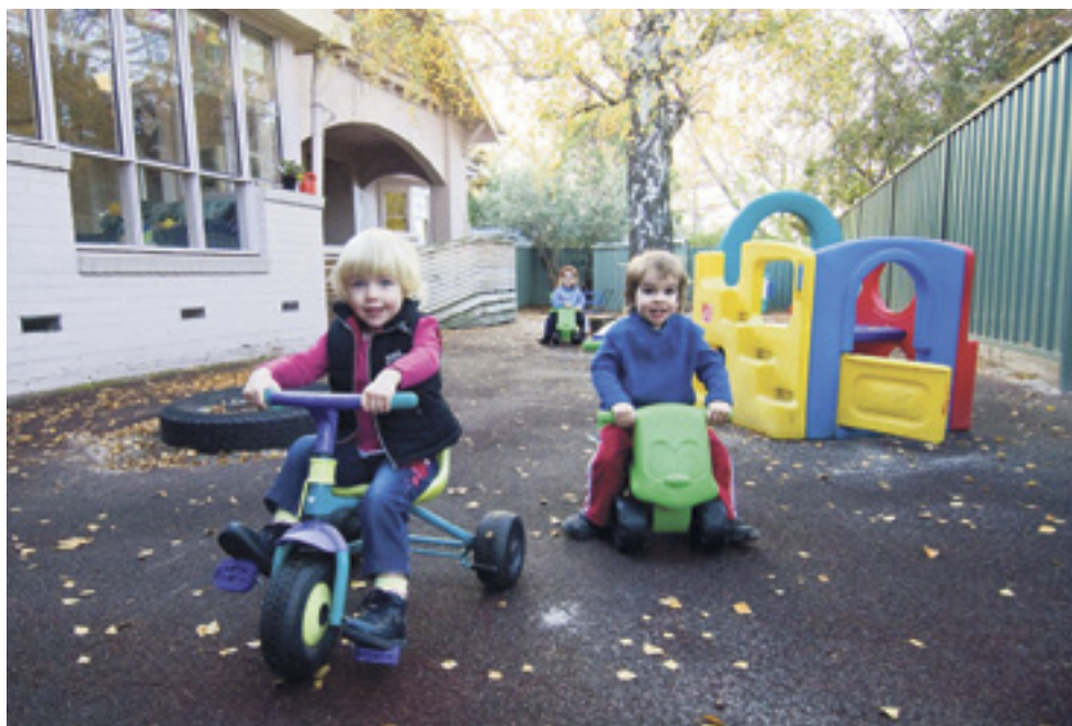
Occasional child care provides respite for parents and guardians of children up to six years.

"TAB funding enables some of the most vulnerable families in our community