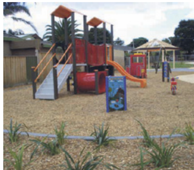
After redevelopment.