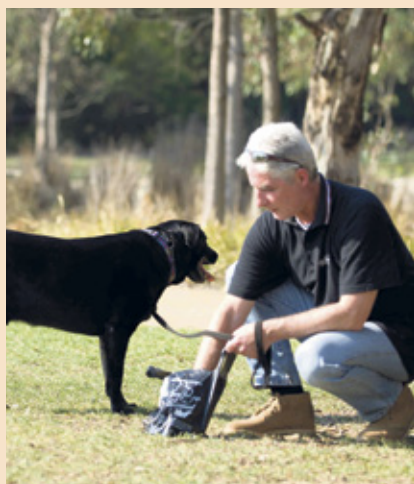
Council is urging dog owners to dispose of dog litter responsibly.

"Dog litter is also harmful to people. Roundworm, which can be found in dog litter, can be passed on to people with children and people with compromised immune systems at most risk of infection," Mr Bordignon said.