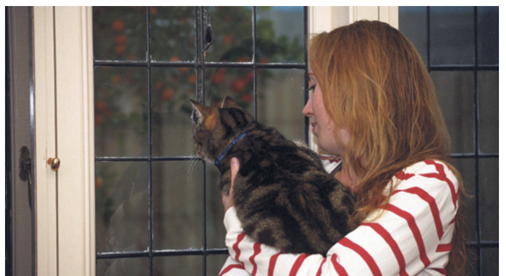
Cats kept inside at night generally live at least three times longer.

Cats can be kept in your house, flat, garage or shed, however make sure their sleeping area is well ventilated, warm and dry and that they have access to food, water and a litter tray.