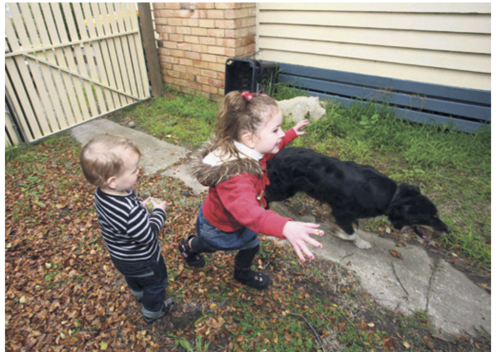
Dogs should be confined to the backyard.