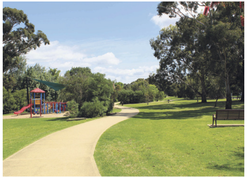
This summer, why not take a pleasant walk through Boyd Park, Murrumbeena?

After its closure, sections of land were fenced off and leased for agistment of horses, while other parts were turned into unkempt paddocks until Council took over maintenance in the 1960s.