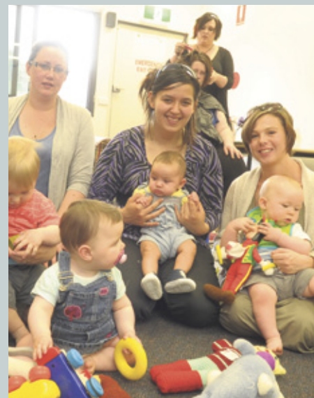
The young mums' group meets every Wednesday from 1pm to 3pm during the school term.