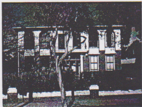
The Old Shire Offices Blackburn & Mitcham/City of Nunawading at 360 Whitehorse Road - will this site get heritage protection?

Heritage Victoria serves as Victoria's central government heritage agency, providing heritage services and supporting the work of the Heritage Council. It is part of the Department of Infrastructure. Heritage Victoria works within the framework of the Heritage Act 1995 (Vic) which