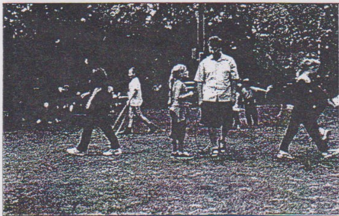
Children really enjoyed the hula hoops and so did some of the adults!