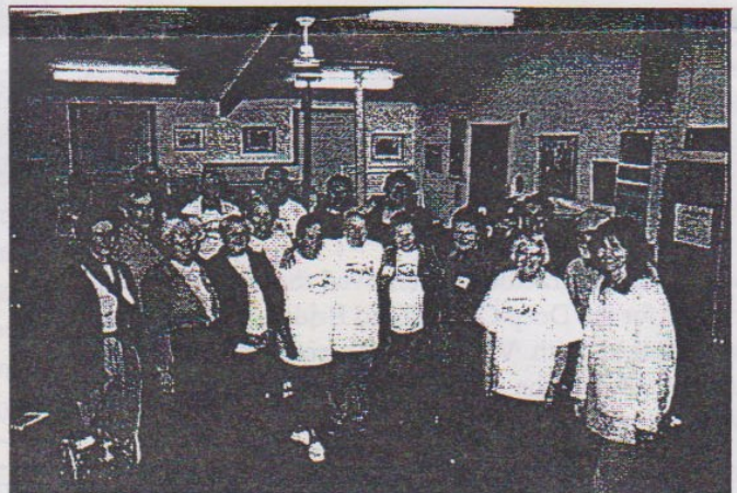
The workers spared a moment from the chore of packing up for this photo opportunity. Our thanks to all who contributed.