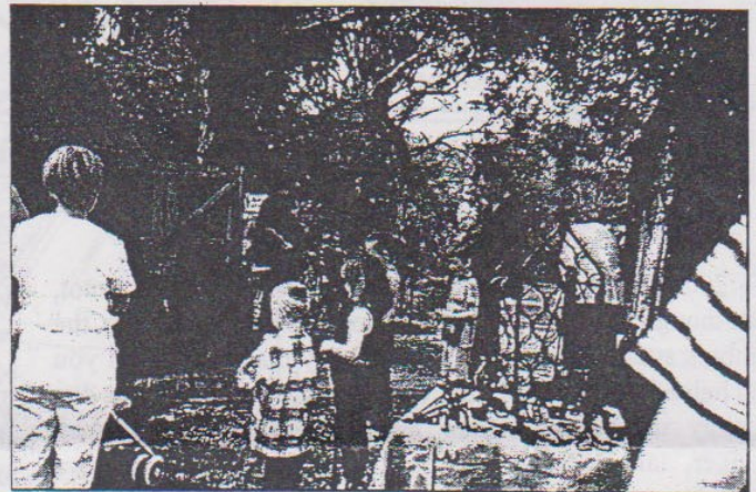
The Blacksmiths continue to interest young and old in their ancient craft.