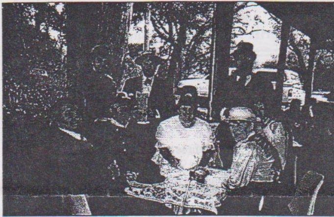
Members of the Victorian Re-enactment Society enjoy afternoon tea following their performance.

Our Schwerkolt Cottage and Museum Complex Open Day was once again a great success with many favourable remarks from visitors.