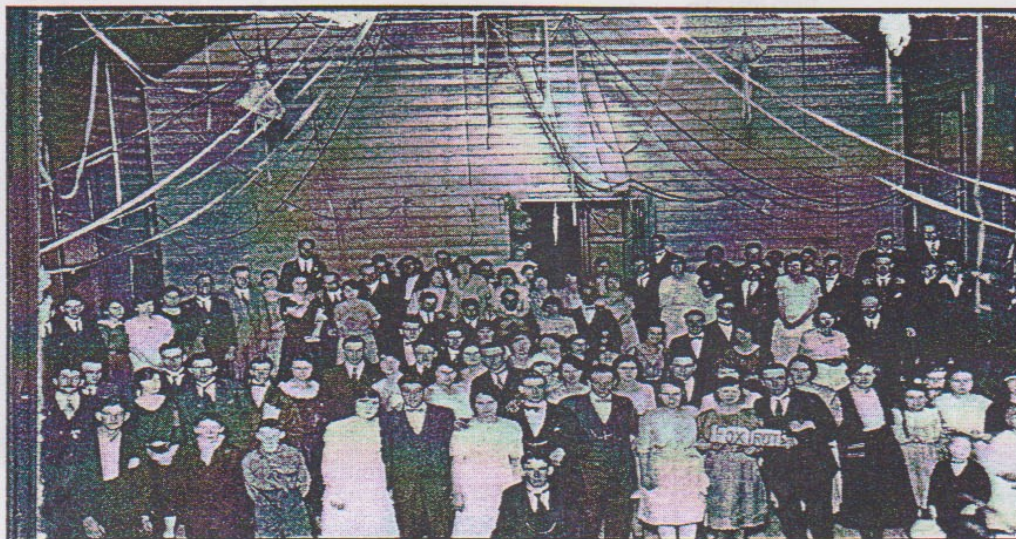
CAN ANYONE DATE THIS PHOTOGRAPH? BLACKBURN FOOTBALL CLUB DANCE AT MORTON HALL, BLACKBURN