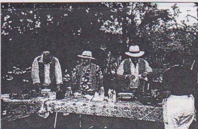
Members of Rotary Club of Forest Hill worked very successfully with the sausage sizzle.