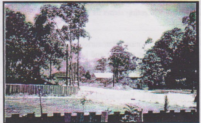
The fire in Heatherdale after crossing Antonio Park, Whitehorse Road and the Railway Line.

In the weeks that followed, it was interesting to watch the bush in Antonio Park recover - in no time, it was all green again."