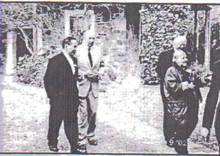
The Governor inspecting the Barn.