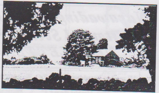
St John's Church Westgarthtown from the Cemetery