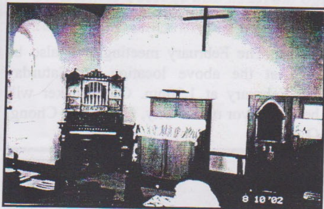
Interior St Johns Church Westgarthtown