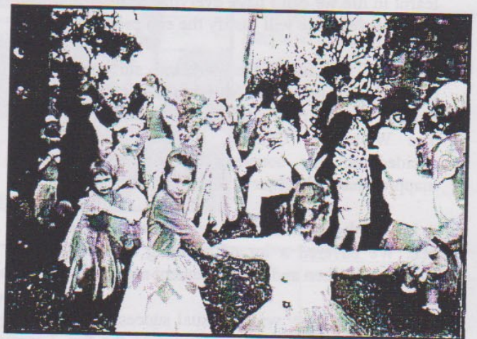
Children enjoying the fun at the Wisteria Party.