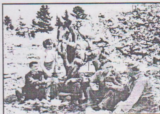
Cherry Blossom on Pearce's Orchard, Blackburn. Now the site of the Blackburn High School