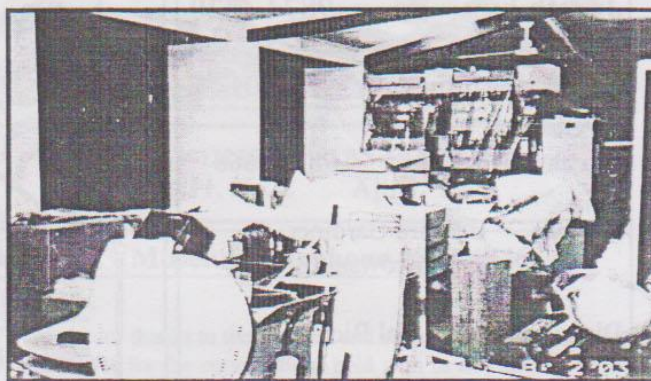
The Local History Room after the extension and painting had been completed before the items were put away