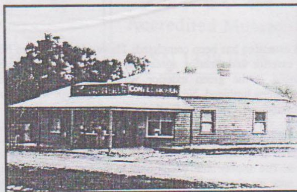
First shop in Blackburn, built by Mrs. Pearce at corner of Railway Road and Chapel Street. C1907