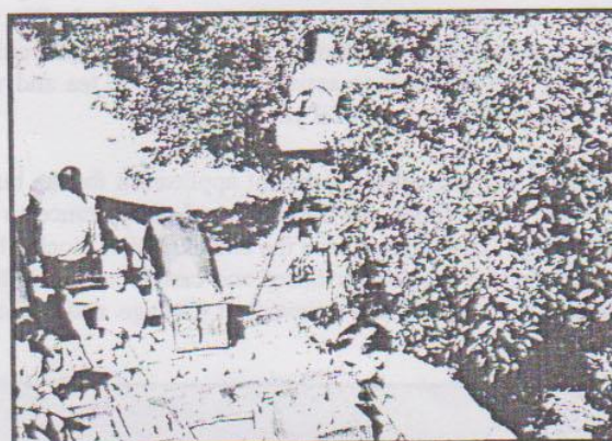
Picking apples at Pearce's Orchard, Blackburn. Now the site of Blackburn High School