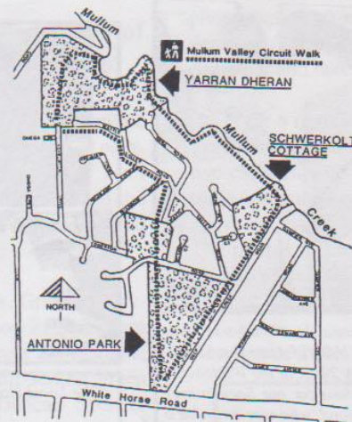
Melway Ref. 49 D7