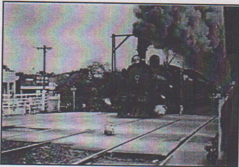
Vintage Train at Blackburn Railway Crossing May 1968

MHP MHP MHP Accredited Museum ISSN 1328-2395