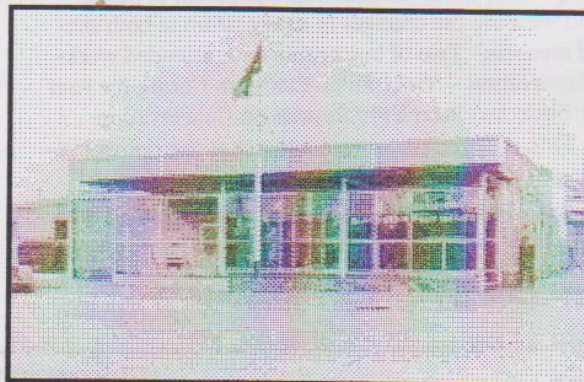
New Blackburn Post Office opened 12 September 1960