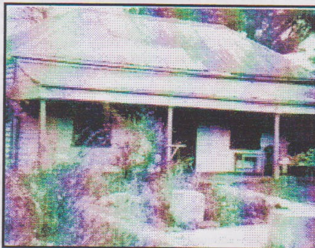
Blackburn Creek Post Office 1876